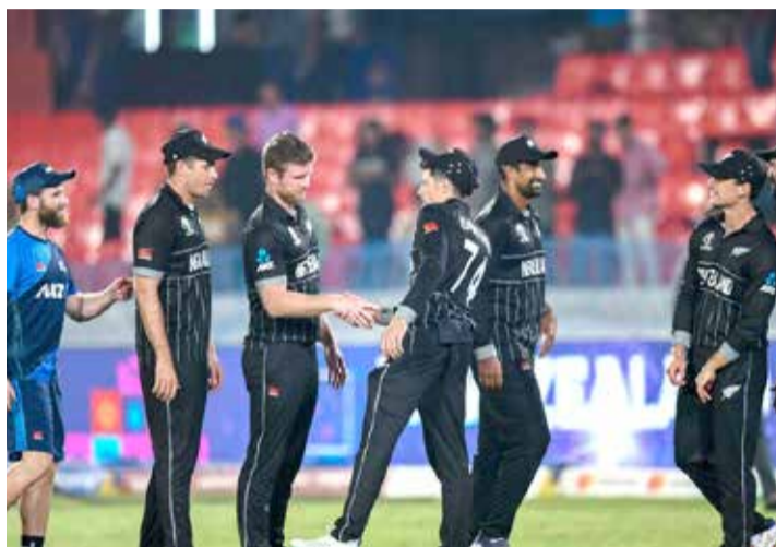
New Zealand's Mitchell Santner (C) shakes hands with his teammates at the end of the match

"We did a great job batting first, built partnerships at the top and the bowlers did a fan-