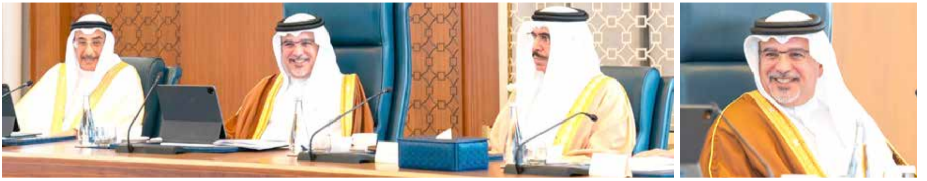
HRH the Crown Prince and Prime Minister chairs the weekly Cabinet meeting