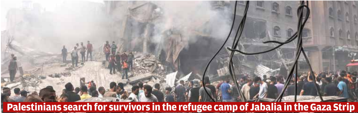
Palestinians search for survivors in the refugee camp of Jabalia in the Gaza Strip