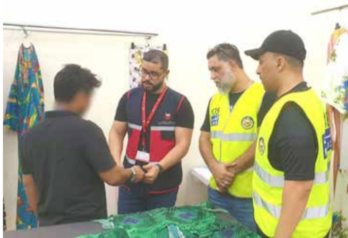
LMRA personnel check the labour and residence status of an expatriate