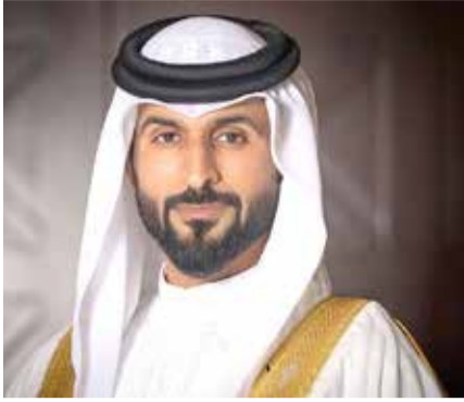
His Highness Shaikh Nasser bin Hamad Al Khalifa