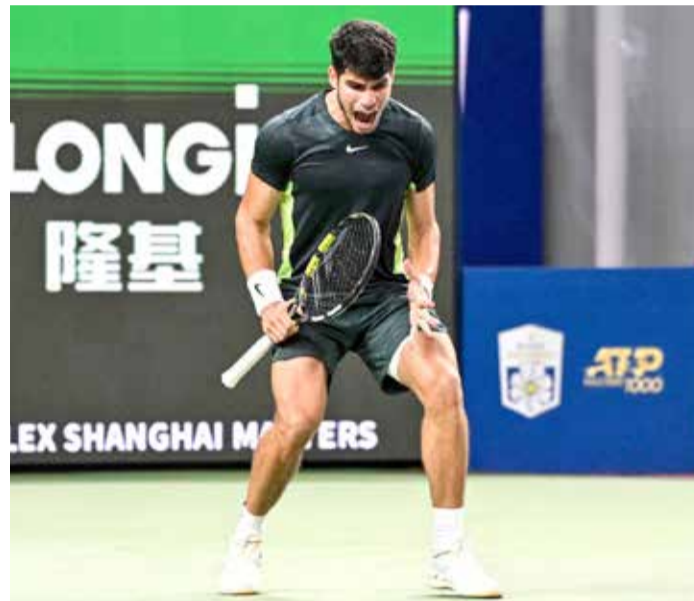
Spain's Carlos Alcaraz celebrates after winning against Britain's Daniel Evans

And his pool of main rivals has shrunk as the competition