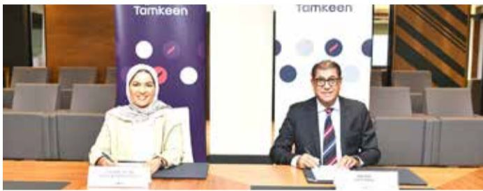
Officials signing the deal

A total of 130 Bahrainis will be employed and trained over the next five years in Low-Code development approaches and methods enabling them to efficiently develop digital solutions and applications. The training will focus on technologies that allow organizations to develop, deploy, and manage websites