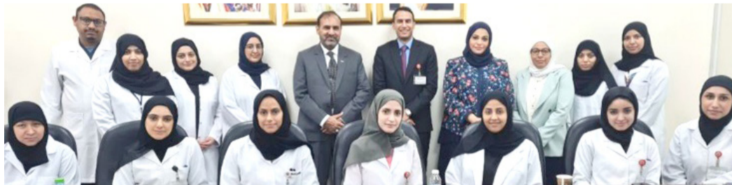
Participants at the event