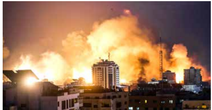
A fireball erupts during Israeli bombardment of Gaza City yesterday.

Through the statement, the Ministry affirmed the Kingdom's denunciation of the reported kidnappings of civilians from their homes to be taken as hostages and called calling for the de-escalation of the violence that threatens regional security