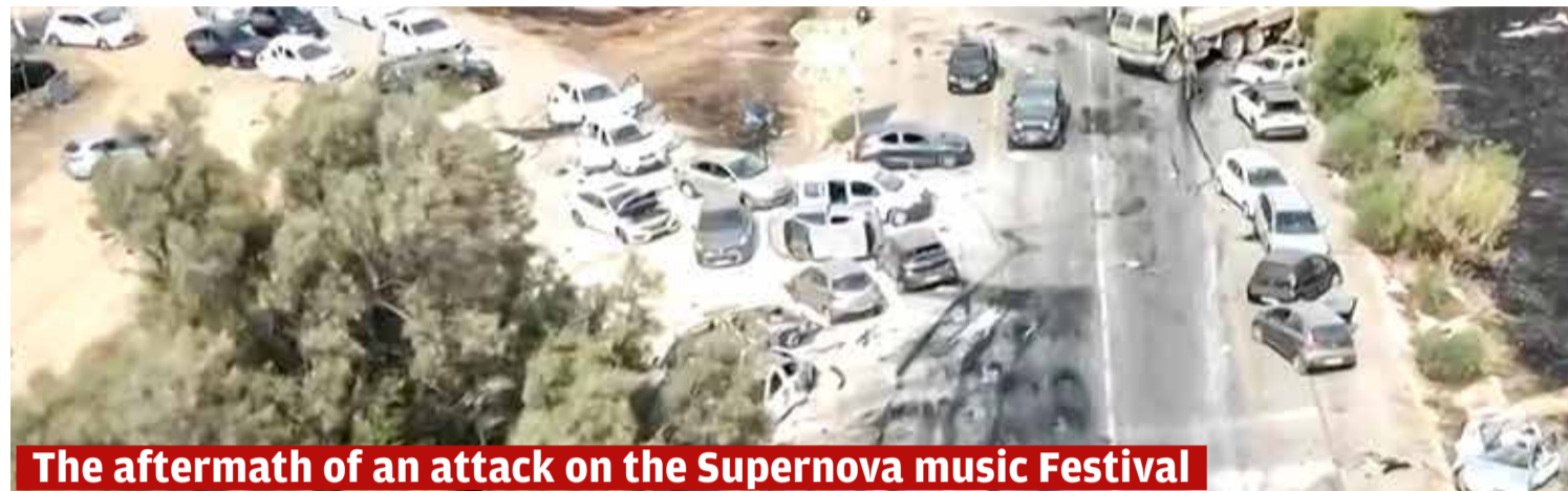
The aftermath of an attack on the Supernova music Festival