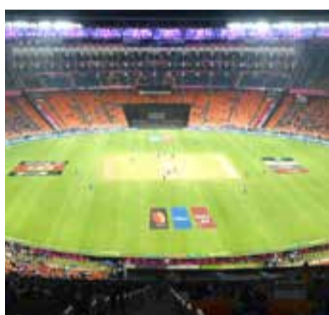
A general view shows a cricket match at a stadium

The final choice of which sports are retained for 2028 will be voted on at the IOC Session next Monday in Mumbai, one of the hotbeds of the sport, as India hosts the men's 50-