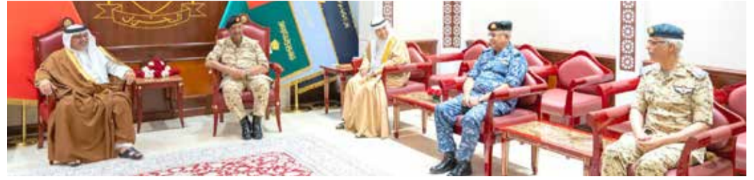
HRH Prince Salman holds talks with senior BDF officials during his visit to the General Command

This came as His Royal Highness visited yesterday the General Command of the BDF.