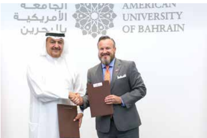
The deal signing

This agreement opens doors for AUBH students, regardless of their major, who have a passion