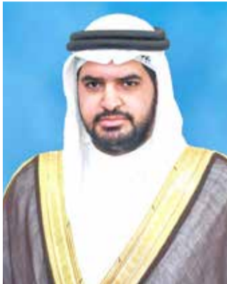
His Highness Shaikh Isa bin Ali Al Khalifa

King for Humanitarian Works and Youth Affairs, and His Highness Shaikh Khalid bin Hamad Al Khalifa, First Deputy Chairman of the Supreme Council for Youth and Sports, Chairman of the General Sports Authority, and President of the BOC, in recognition of Bahrain's remarkable achievements on the Asian stage.