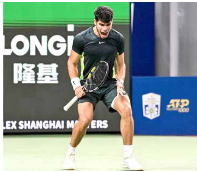
Spain's Carlos Alcaraz celebrates after winning against Britain's Daniel Evans

And his pool of main rivals has shrunk as the competition