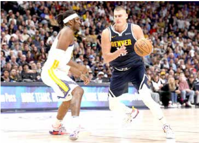
Nikola Jokic of the Denver Nuggets drives against Kevin Looney of the Golden State Warriors

But Denver recovered from a five-point deficit early in the fourth to snatch victory, clinching the win after Klay Thomp-