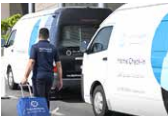
Home Check-In service for hassle-free travel experience

hours before the flight. A Hala Bahrain agent will then arrive at the passenger's preferred location to weigh and tag their bags, check them in, and issue boarding passes. The bags will then be transported to Bahrain International Airport and loaded onto the passenger's flight.