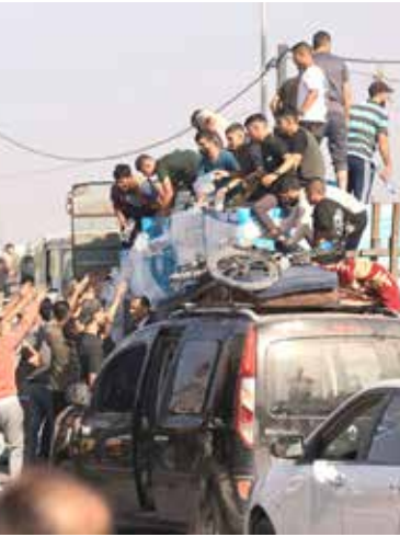
Palestinian families fleeing Gaza City and other northern areas, walk along a highway

fire have mounted, as have protests, including one at the weekend which targeted the White House. However, Biden ruled out a longer truce for now.