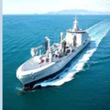
Italian Navy's "Vulcano" ship

It is expected to arrive "in a couple of days, weather permitting", a defence ministry spokesman told AFP, without confirming how close the ship would get to Gaza.