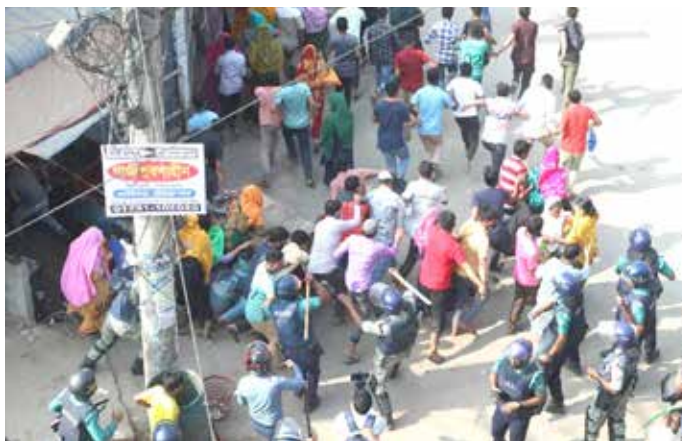
Bangladeshi security personnel disperse protesting garment workers

But conditions are dire for many of the sector's four million workers, the vast majority