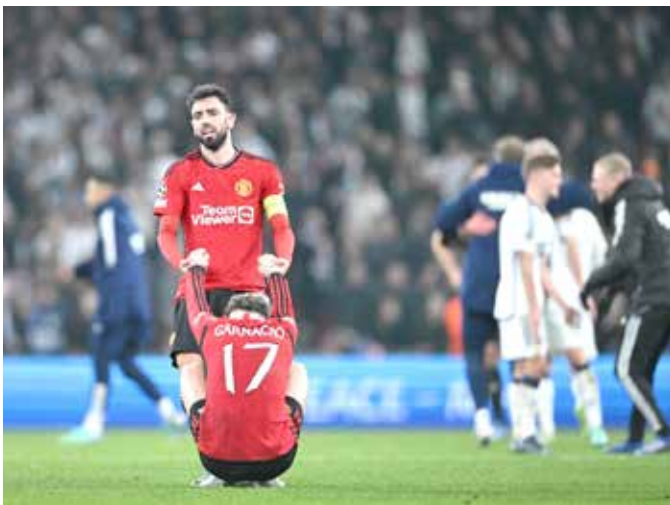
Manchester United's Bruno Fernandes and Alejandro Garnacho react after the match