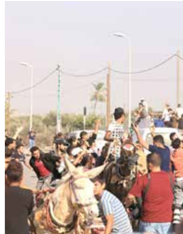
Bottles of water are handed out as Palestinian parts of northern Gaza towards the south

Israel had also opened up "humanitarian corridors" for the past few days that had already allowed "many thousands" of people to leave the worst-hit area of north Gaza to the south, Kirby added.