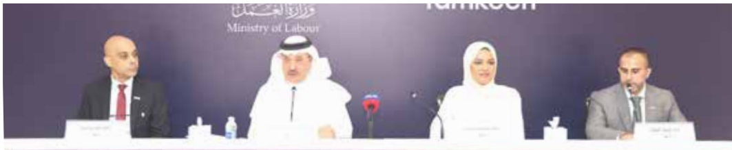
Officials with the Labour Minister at the press conference

Additionally, Tamkeen aims to support the employment of Bahrainis in executive and leadership positions and encouraging enterprises to train and employ Bahrainis through apprenticeships.