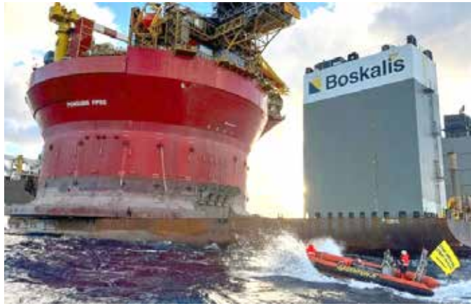
Greenpeace activists in inflatable boats approaching a Shell floating production storage and offloading unit earlier this year