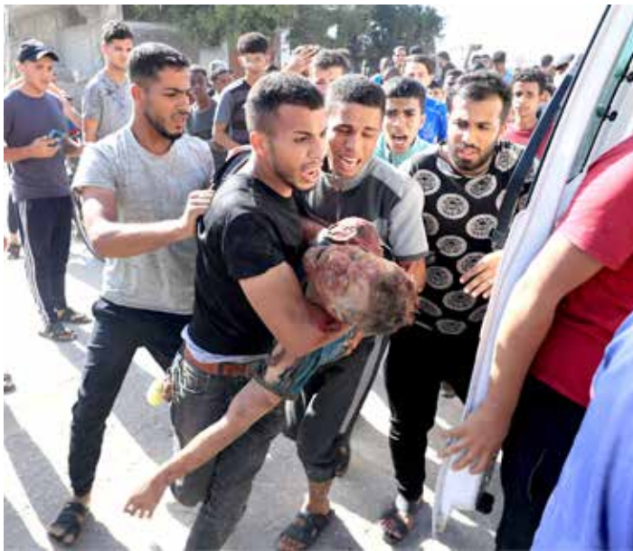
Palestinians rush an injured man to a waiting ambulance following an Israeli strike on Rafah city, in the southern Gaza Strip, yesterday.

"This is a difficult campaign. Hamas has structured it to be a campaign that produces civilian casualties. But still every possible effort must be taken to minimize the damage, minimize