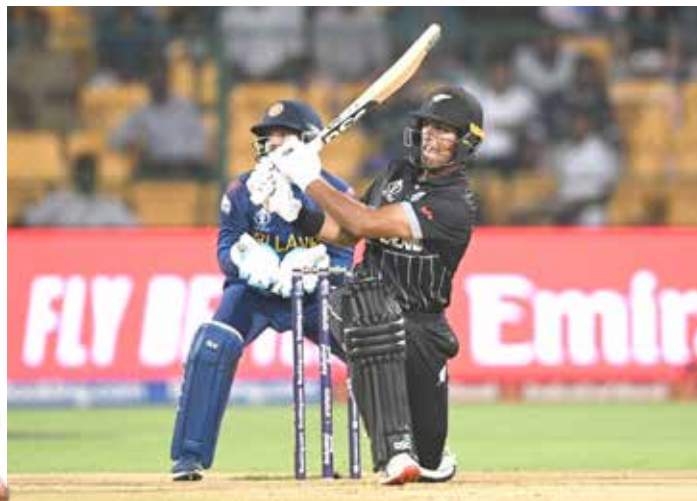
Rachin Ravindra plays a shot