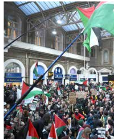
Protesters take part in a protest inside City Hall AFP | London

British interior minister Suella Braverman sparked outrage yesterday for accusing police of double standards before a politically charged pro-Palestinian rally on Armistice Day, the latest incendiary rhetoric from the hardline Conservative.