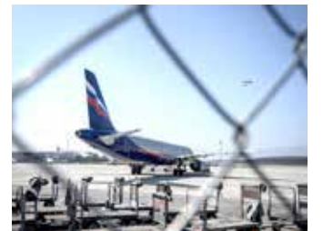
An Airbus A321-211 flown by Aeroflot sits at the Geneva airport

which are on average 50 years old -- are due to be grounded in around five years, according to current rules, he added.