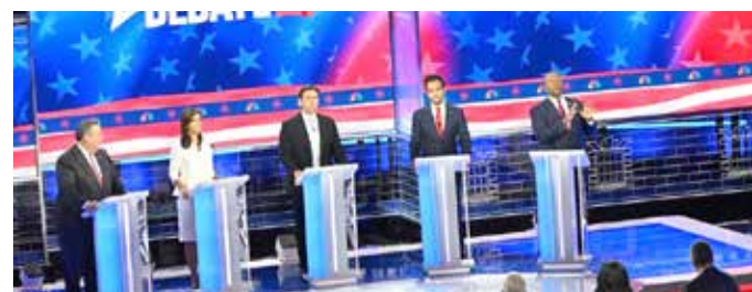
Contenders for the Republican Party nomination take part in the debate

While the challengers appeared united in their support of Israel and its war against Hamas, tensions flared -- including fierce personal attacks -- in the debate barely two months before the all-important first votes