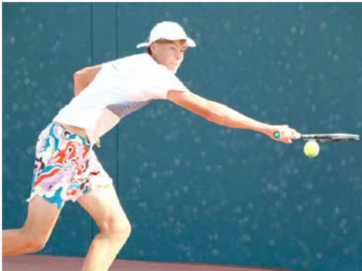
A player in action during yesterday's matches

Ariana remained in contention for the titles in both the girls'