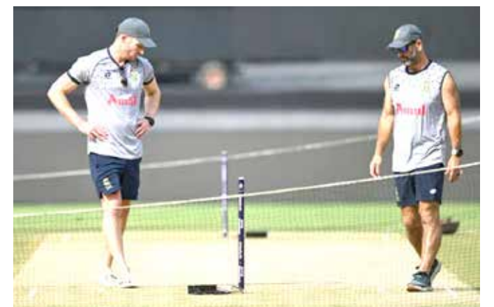
South Africa's David Miller (left) and head coach Rob Walter inspect the strip in Ahmedabad