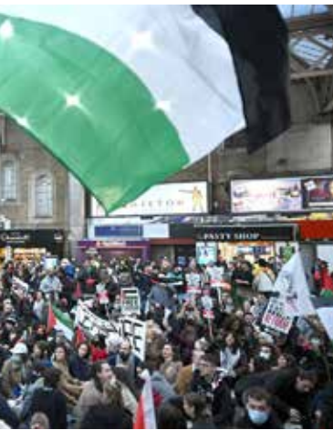
Protesting garment workers

Rishi Sunak's party to appeal to right-wingers before the next general election.