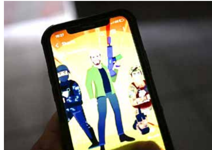
A boy watches a short video on YouTube

TikTok, owned by Chinese company ByteDance, is particularly popular with younger users, while YouTube is part of the Alphabet digital empire that includes Google.