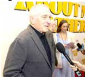
Robert De Niro