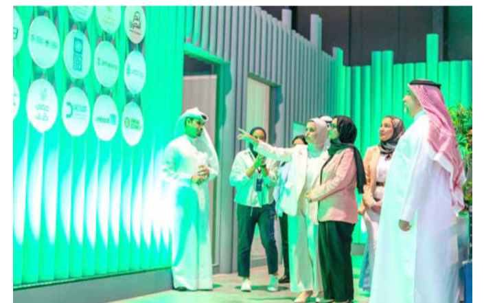
H.E. Dr. Jaleela bint Al Sayyed Jawad Hasan is briefed on the event's activities

● Thirteenth edition at Exhibition World Bahrain