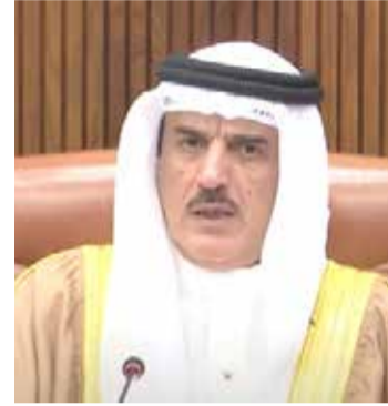
Council of Representatives Speaker Ahmed bin Salman Al Musallam

Besides, the parliament will discuss the government's policy on outsourcing services to private companies, including the regulations governing collaboration with these companies, focusing on ensuring transparency and accountability in the outsourcing process.