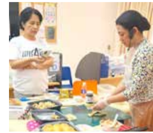
Trainer and participants at the event