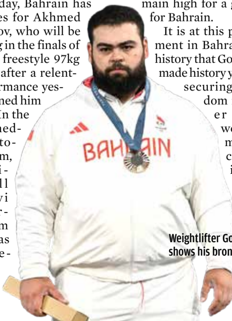
Weightlifter Gor Minasyan shows his bronze medal

main high for a gold medal for Bahrain. It is at this pivotal moment in Bahrain's sports history that Gor Minasyan made history yesterday by securing the Kingdom its first-ever Olympic weightlifting medal by competing in the men's +102kg category.