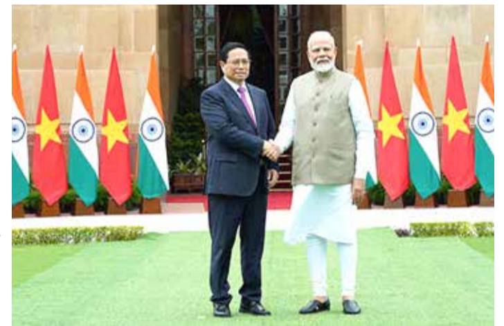
Vietnam PM Pham Minh Chinh with PM Narendra Modi