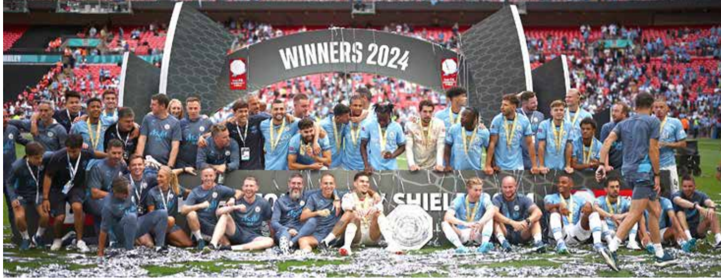
Manchester City's Belgian midfielder #17 Kevin De Bruyne holds aloft the trophy as the team pose after winning the English FA Community Shield football match between Manchester City and Manchester United at Wembley Stadium, in London