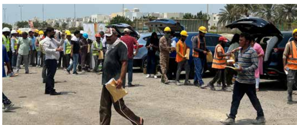
Bottled drinks provide relief for workers