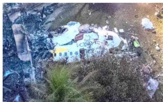
Aerial view of the wreckage of the crashed airplane