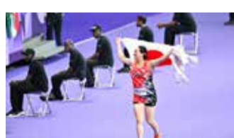
Gold medalist Japan's Haruka Kitaguchi celebrates winning the women's javelin throw final of the athletics event

AFP | Paris, France Rai Benjamin anchored the United States to victory in the Olympic men's 4x400m relay in Paris. Benjamin, who won the 400m hurdles gold, helped the US quartet also featuring Christopher Bailey, Ver-non Norwood and Bryce Deadmon to an Olympic record of 2min 54.43sec. Botswana, with 200m champion Letsile Tebogo on their fourth leg, took silver in an African record of 2:54.53, while Britain claimed bronze in a European record of 2:55.83.