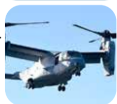
Pilot error, lax safety blamed in US Osprey crash off Australia

◆ A slew of pilot errors caused the fatal crash of a US military Osprey aircraft in Australia last August, the Pentagon said Friday in an investigation that also slammed a lax attitude towards safety. Three US Marines died in the August 27 crash after the crew lost control of their MV-22B Osprey during war games near a remote tropical island off Australia. The deadly accident was one of several involving Ospreys in the past few years, prompting renewed scrutiny of the tilt-rotor aircraft, a mix between a helicopter and a plane. "Ultimately, based on the evidence available, the primary cause for this mishap was pilot error and complacency," the report said. But the probe also found "several concerning maintenance practices" by the squad, including falsified paperwork about the aircraft's weight and load, and incomplete turnaround inspections prior to flight.