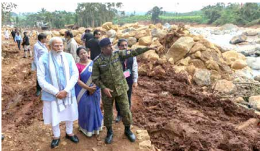
Modi receiving a briefing at the landslide-affected area Mumbai, India

Indian Prime Minister Narendra Modi yesterday visited the site of landslides that killed more than 200 people last month, vowing to extend "every possible support" to those who lost homes and loved ones. Torrential monsoon rains battered the southern coastal state of Kerala and triggered landslides on July 30, burying homes and people in Wayanad district under tonnes of rock and soil.