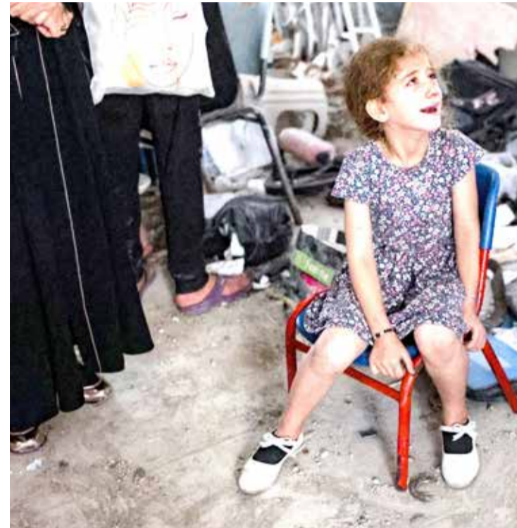
A young girl cries inside a school used as a temporary shelter for displaced Palestinians killed more than 90 people.

"They dropped a missile on them while they were just praying," said one woman, mourning over a dead child shrouded in a plastic body bag. Israel's military said it had "pre-