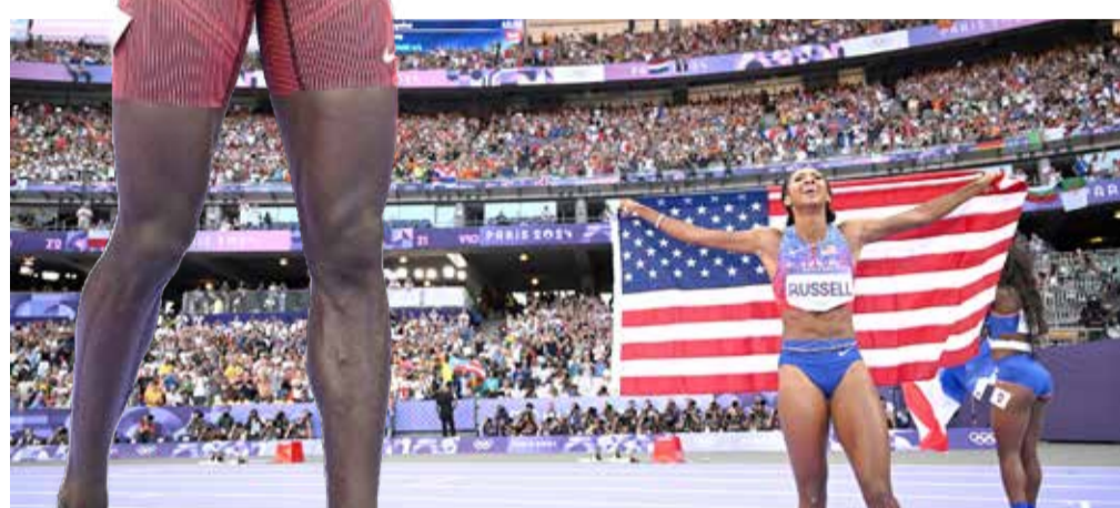
Gold medalist US' Masai Russell celebrates with the national flag

Records tumbled as greatness was born and thrilled the crowd in Paris, with track and field champions delivering a thriller