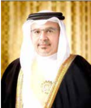
HRH Prince Salman.jpg TDT | Manama

His Royal Highness Prince Salman bin Hamad Al Khalifa, the Crown Prince and Prime Minister, congratulated the Kingdom of Bahrain for winning the bronze medal at the Paris 2024 Olympics courtesy of weightlifter Gor Minasyan in the men's +102kg competition.