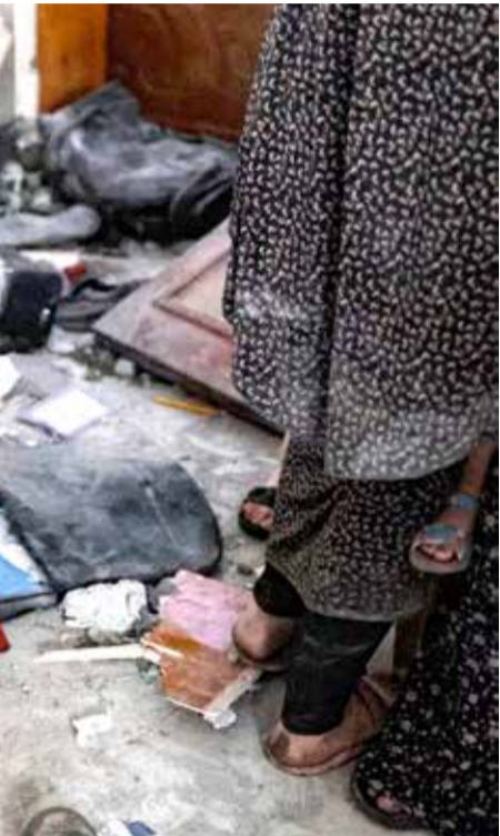
ians in Gaza City, following an Israeli strike that... ...had... ...ians group's Lebanese ally Hezbollah... ...called it a "horrific massacre". ...Iran, which backs both groups... ...and had accused Israel of wanting