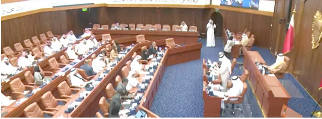
MPS brace for marathon discussions

Moreover, they will scrutinise the government's response to the declining fish stock in Bahrain, the limited variety of fish