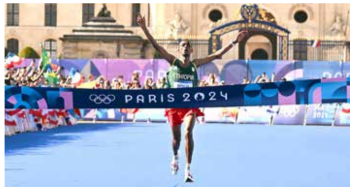
Ethiopia's Tamirat Tola crosses the finish line to win the men's marathon

AFP | Paris, France Ethiopia's Tamirat Tola broke the Olympic record to win the men's marathon on Saturday as China completed an unprecedented clean sweep of all eight diving medals. New Zealand's Lydia Ko upgraded to a gold in the women's golf while Victor Wembanyama's France prepared to take on the mighty USA in a dream basketball final.