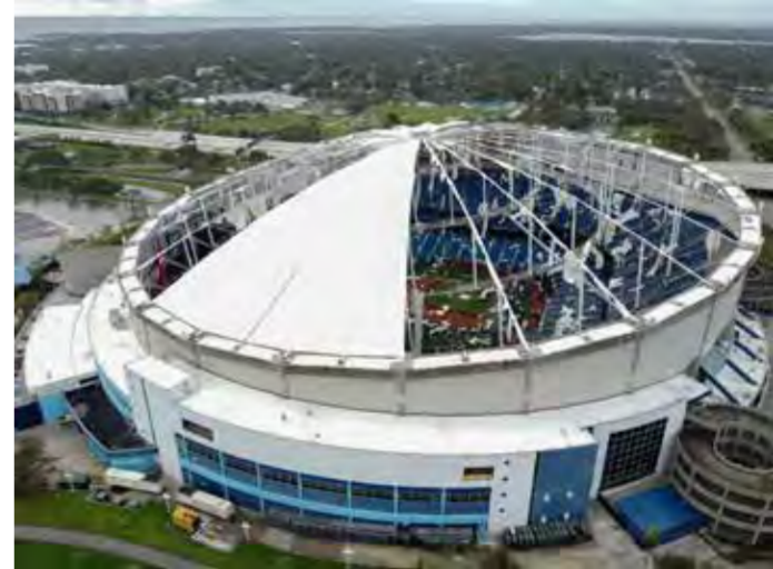
A drone image shows the dome of Tropicana Field which has been torn open due to Hurricane Milton in St. Petersburg, Florida

Across the storm's path, roads were blocked by downed trees and power lines and some three million people were without power as of Thursday morning. Lines and some three million people were without power as