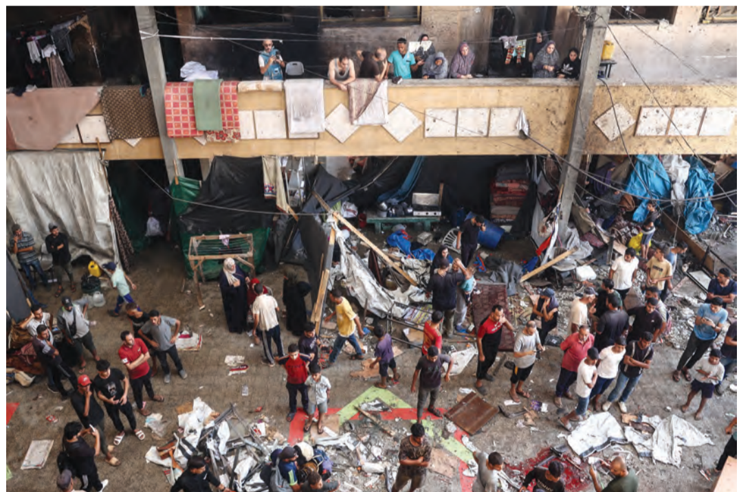
Palestinians react after an Israeli strike hit the Rafida school housing displaced people in Deir al-Balah in the central Gaza Strip.

A local source from Jabalia who wished to remain anonymous