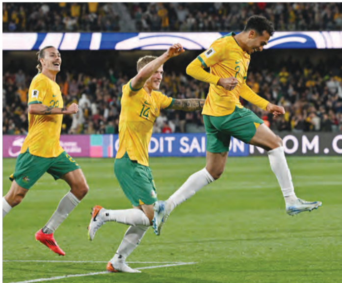
Australia's Nishan Velupillay celebrates a goal during the FIFA World Cup 2026 Asia zone qualifiers football match between Australia and China in Adelaide

"But the boys took to it quickly, they are such an adaptable group. It was an all-round great performance."