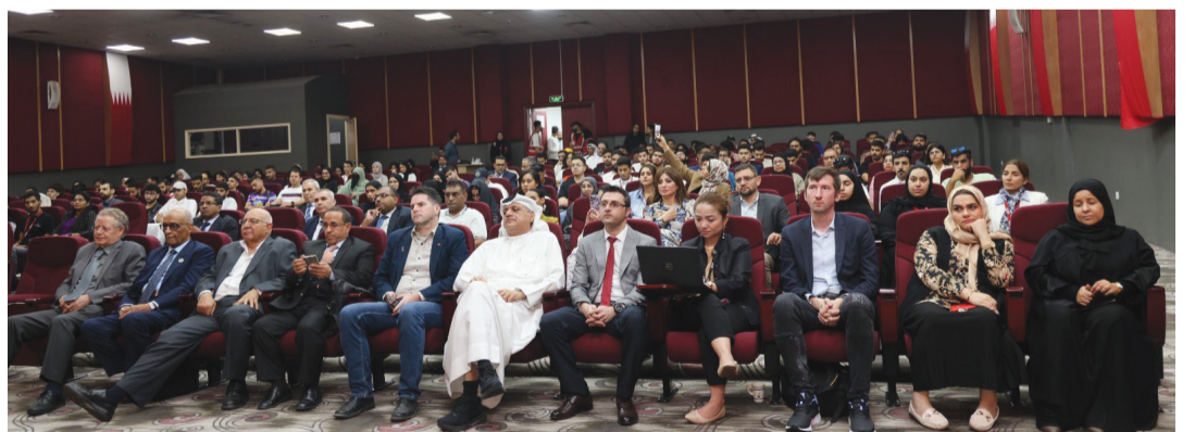
Attendees at the event