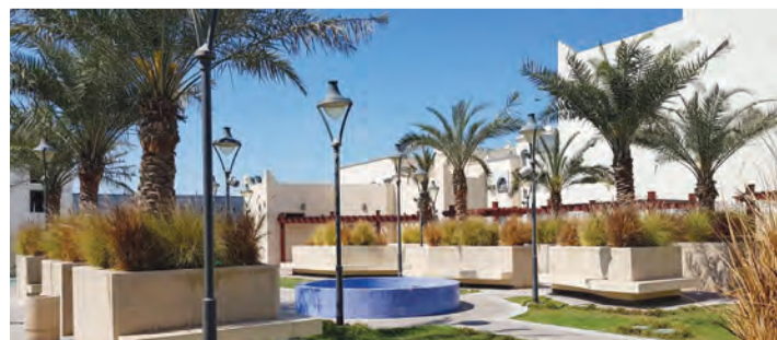
The Hanging Gardens gets a makeover

The project will include repainting, upgrading restrooms and facilities, improving park-