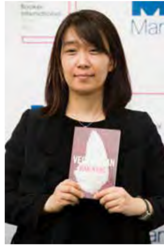
Korean author Han Kang poses for a photograph with her book 'The Vegetarian' at a photocall in London

Han will receive the award from King Carl XVI Gustav in