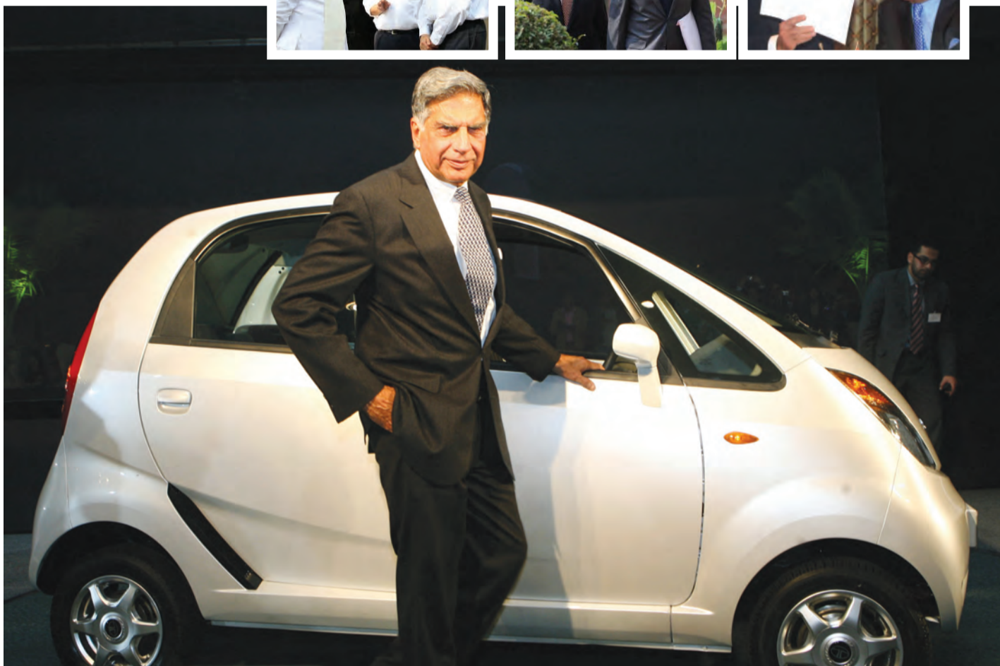
Chairman of India's giant Tata Group Ratan Tata poses in front of the Tata Nano, unveiled as the world's cheapest compact car at 2,500 USD, during the vehicle's launch in New Delhi on January 10, 2008.

That same year, he declared he wanted Tata Group to "spread its wings far beyond India" and become "at home in the world" -- prompting a world tour to buy up major brands, including Britain's Tetley Tea and Anglo-Dutch steel firm Corus.