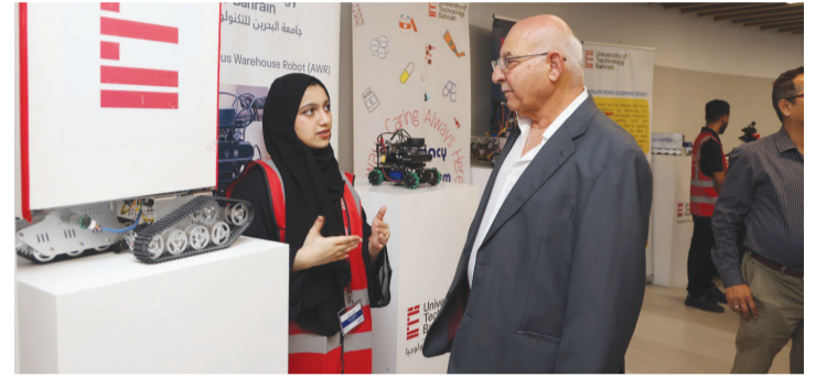
A participant presents the project to judges