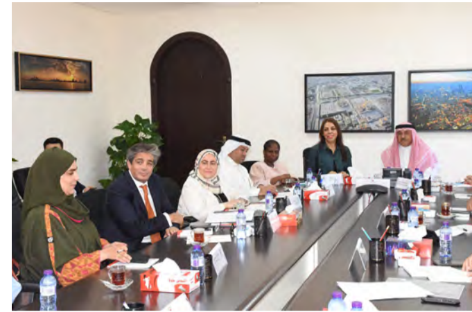
The Capital Trustees Board meeting in progress