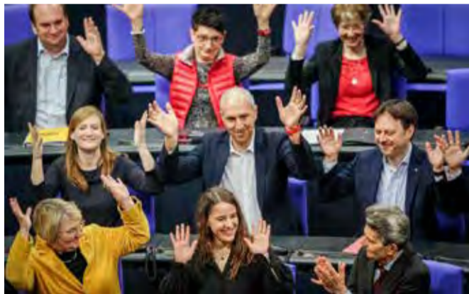
Lawmaker Heike Heubach, front center, the first deaf member of the Bundestag, sits between members of the faction of the German Social Democrats (SPD) at the start of a meeting of the German federal parliament, Bundestag, at the Reichstag building in Berlin, Germany

German lawmaker made history on Thursday by giving the first address to parliament delivered in sign language and simultaneously spoken by an interpreter. Heike Heubach, a 44-year-old MP from the centre-left Social Democrats who has been hearing impaired since childhood, addressed climate change in a debate on urban planning.