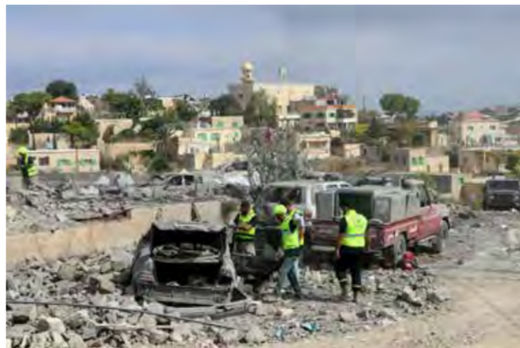
Rescuers search for survivors at the site of an overnight Israeli airstrike that targeted the southern Lebanese village of Derrdhalia

The Iran-backed group also said it fired rockets at Israel troops in another Lebanese area along the frontier, Mais al-Jabal.