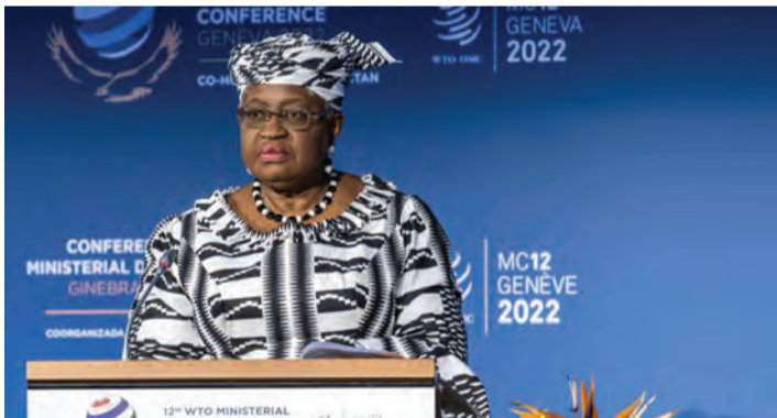
WTO director-general Ngozi Okonjo-Iweala

"We are expecting a gradual recovery in global trade for 2024, but we remain vigilant of potential setbacks -- particularly