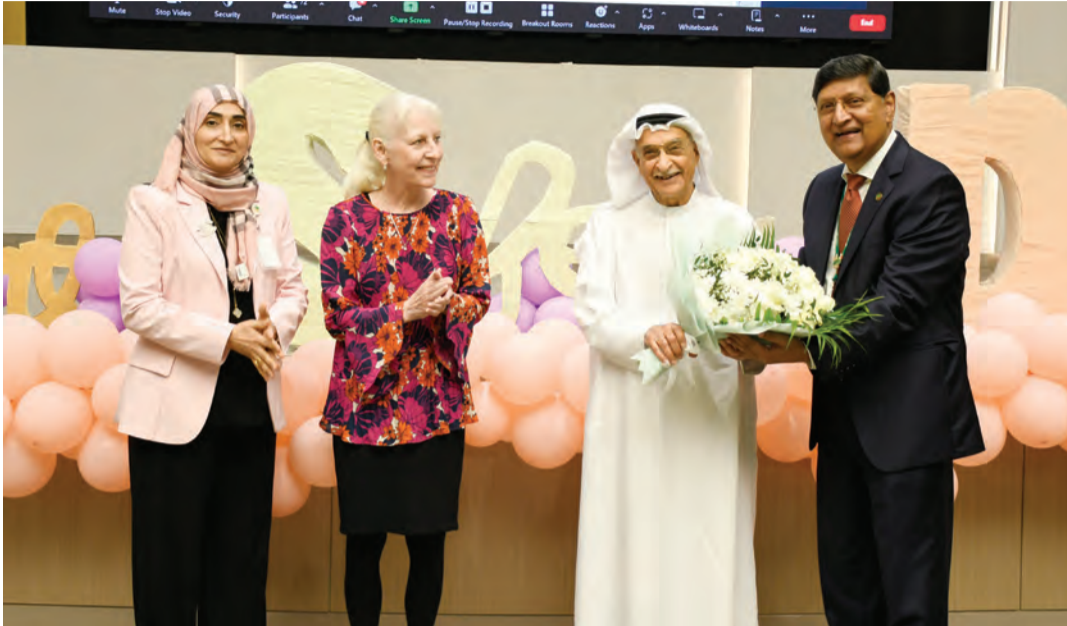
In pictures, The World Patient Safety & Quality Day celebration at the American Mission Hospital