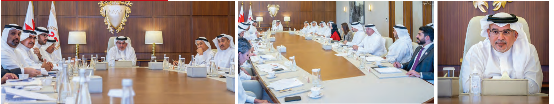
The Coordination Committee convened to review the latest developments in the National Health Insurance Program, focusing on proposals aimed at enhancing the performance and efficiency of government service centers. The Committee also reviewed recent developments concerning the authorised distributor activity in the Kingdom of Bahrain.