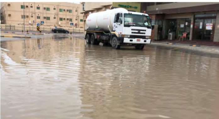
Residents faced severe flooding issues last April, causing disruptions

He acknowledged past drainage issues, particularly during April’s downpours, saying, “Sanad, Nuwaidrat, and Sitra have experienced the most damage, but we have redirected tank-