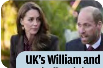
UK's William and Kate in first joint public engagement since cancer treatment

◆ Catherine, Princess of Wales and her husband Prince William on Thursday made their first joint public engagement since she ended a course of chemotherapy for cancer, Kensington Palace announced. The couple visited Southport, northwest England, "to show support to the community and hear how local people have come together as the town recovers" from a July knife attack that killed three children, the palace said. Catherine, also known as Kate, and William met members of the emergency services who responded to the stabbing spree at a Taylor Swift-themed summer dance class, which also injured eight other children and two adults. The couple, both 42, heard "about their experiences of responding to the attack and the impact it has had on their mental health," their office said in a statement.