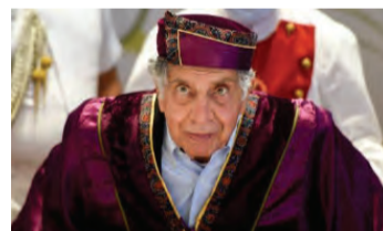
Tata attends an event to receive a Doctor of Literature honorary title from the HSNL University in Mumbai

The conglomerate stayed strong after his second departure, with Tata in 2021 welcoming debt-laden Air India back