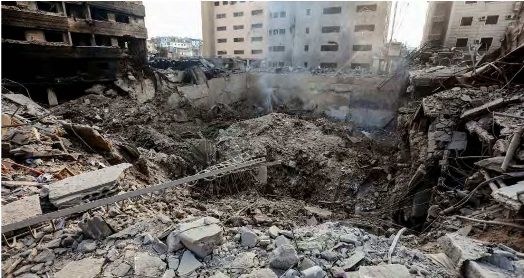
The rubble from destroyed buildings lie at the site of overnight Israeli airstrikes that targeted a Beirut's southern suburb

Following her, the vice president of the Bundestag Aydan Ozoguz said Heubach's speech was "a very special moment, as we are showing that we can represent our society a little better." Fellow lawmakers applauded Heubach in sign language by raising and waving their hands as she took the podium and during her speech, and then giving her a standing ovation. Heubach thanked them by making a heart sign with her hands.