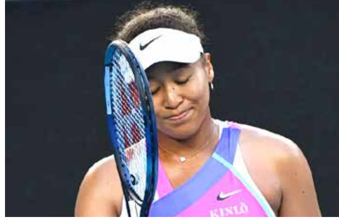
Naomi Osaka reacts during a match (file photo)