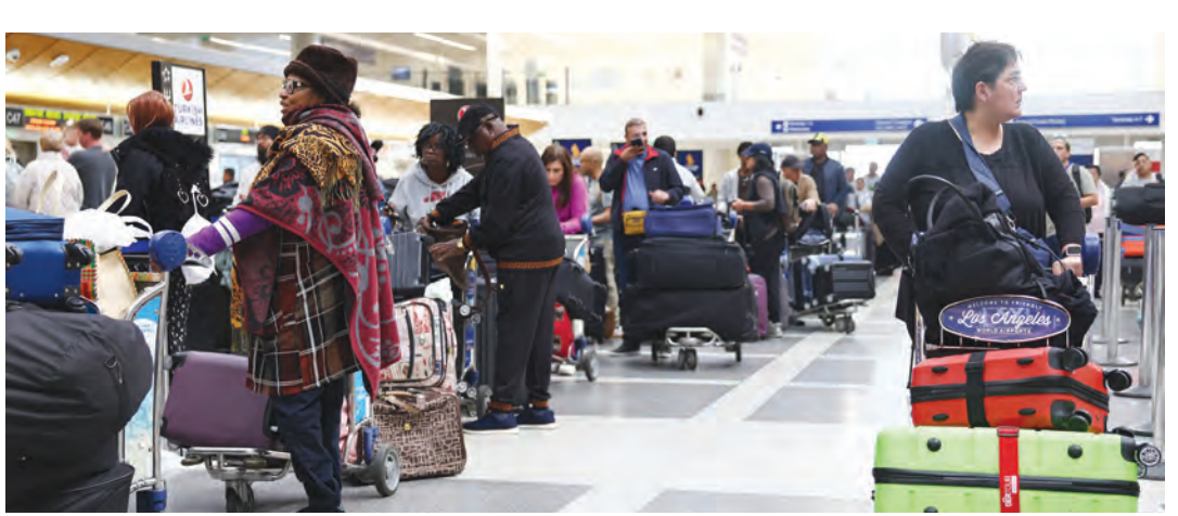
Travelers gather with their luggage in Tom Bradley International Terminal at Los Angeles International Airport

Revenues will be up 4.4% from 2024, it said.