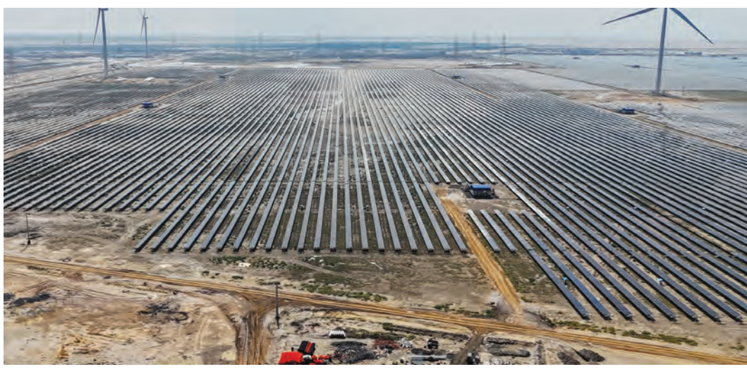
Indian companies are already Solar panels installed at the Adani Green Renewable Energy Plant in Khavda, in India's Gujarat state.

The new rule mandates that order, issued by India's renewa-