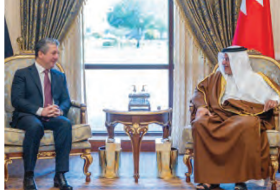
HM the King and HRH Prince Salman hold talks with H.E. Prime Minister Masrour Barzani TDT | Manama

is Majesty King Hamad bin Isa Al Khalifa and His Royal Highness Prince Salman bin Hamad Al his warm regards to President the Kingdom's future progress. Khalifa, the Crown Prince and Barzani and expressed Bah-Prime Minister, held separate rain's commitment to further but significant meetings with the Prime Minister of the Kurdistan Regional Government of Iraq, His Excellency Masrour Barzani, during his visit to the Kingdom of Bahrain.