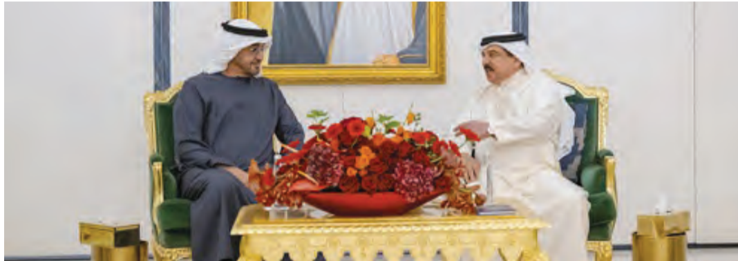
HM the King and HH Sheikh Mohammed bin Zayed hold talks

The meeting also touched on the continuous progress in co-