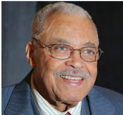
James Earl Jones

Schwarzenegger film "Conan The Barbarian" and the 1989 Kevin Costner movie "Field of Dreams."