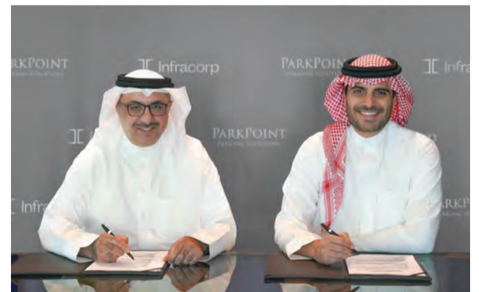
Officials sign the agreement