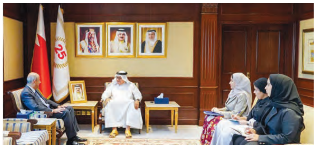
His Excellency Dr. Abdullatif bin Rashid Al Zayani, Minister of Foreign Affairs, received Khaled El Mekwad, the United Nations Resident Coordinator in Bahrain. The meeting discussed means to strengthening bilateral cooperation and coordination between Bahrain and the United Nations and its various agencies. The two sides also reviewed topics of common interest.