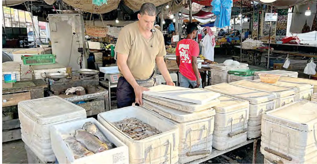
A sigh of relief for vendors and buyers as fish prices become more affordable

Jamri attributed the increase in smaller safi fish to the fishing