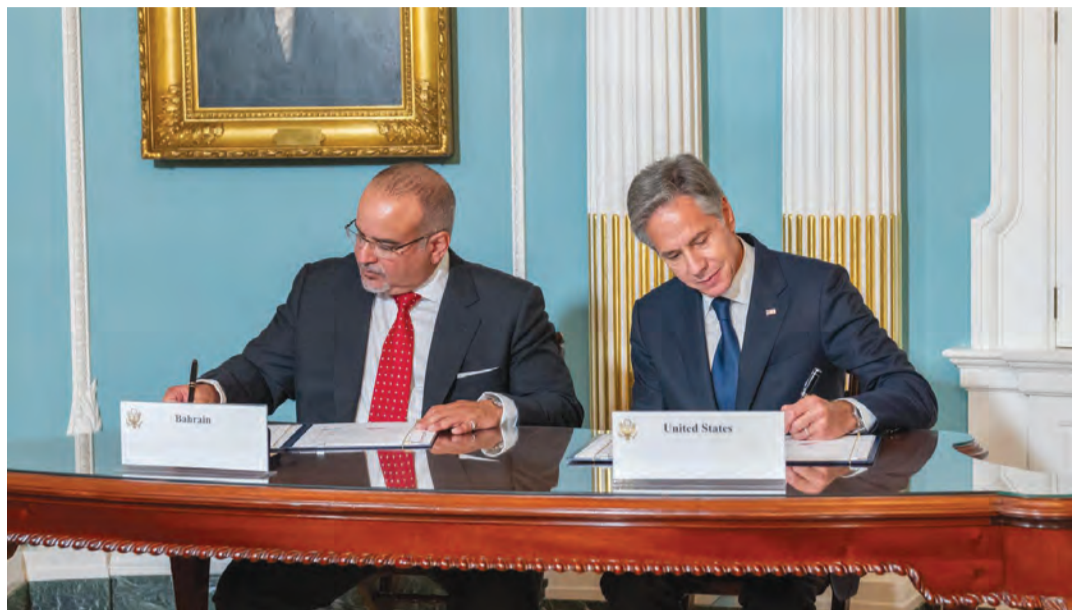
His Royal Highness Prince Salman bin Hamad Al Khalifa, the Crown Prince and Prime Minister, and US Secretary of State Antony Blinken sign the C-SIPA in Washington

His Excellency Minister of Industry and Commerce Abdullah Adel Fakhro's June visit to Washington identified practical