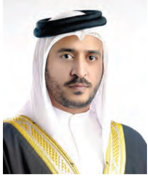
HH Shaikh Khalid bin Hamad Al Khalifa