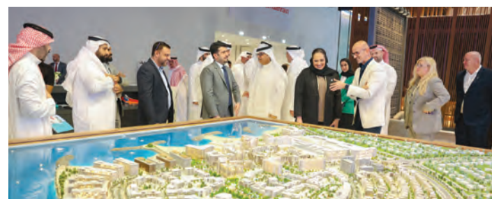
Visitors walk past a displayed model at a previous edition of Cityscape Bahrain

home to discovering attractive investment opportunities, attendees can look forward to an exclusive experience featuring the most sought-after proper-