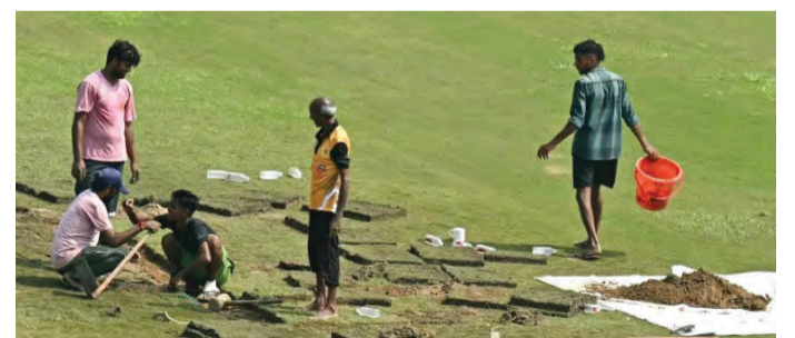
Groundsmen attempt to repair wet patches on the ground

The venue, which is hosting its first Test, has come under scrutiny for lacking world-class facilities and basic drainage.