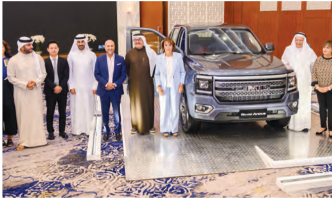
Officials during the launch

"This brand represents not only quality and reliability but also our commitment to serving our customers with excellence."