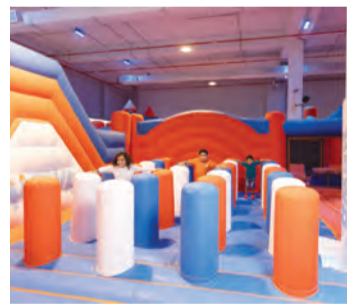
Children play at Hawa

With a sprawling area of 1,000 square metres, visitors can en-