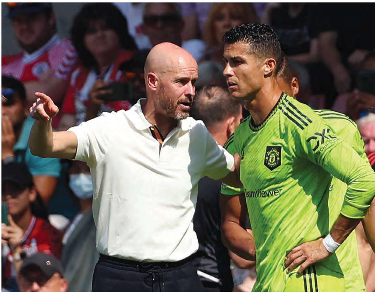
Erik ten Hag (L) talks with Cristiano Ronaldo

"The coach, they say they cannot compete to win the league and Champi-