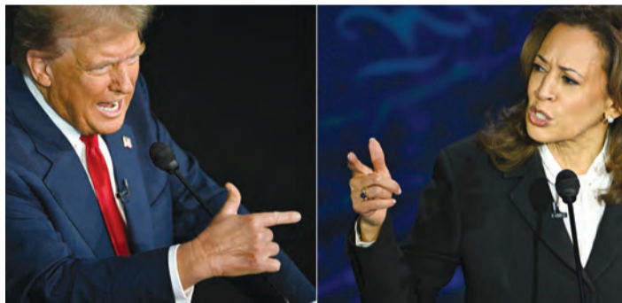
A combo photos of Harris and Trump during the presidential debate.

The 59-year-old US vice president managed to knock former president Trump off his game in their first and only scheduled showdown, which featured a series of bitter personal attacks on both sides.