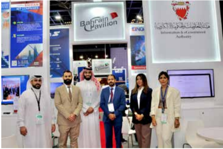
GITEX GLOBAL hosts 5,000 companies across a two million square feet exhibition space between October 10 and 14.

GITEX GLOBAL unifies the world's most influential ecosystems advancing business, economy, society and culture through