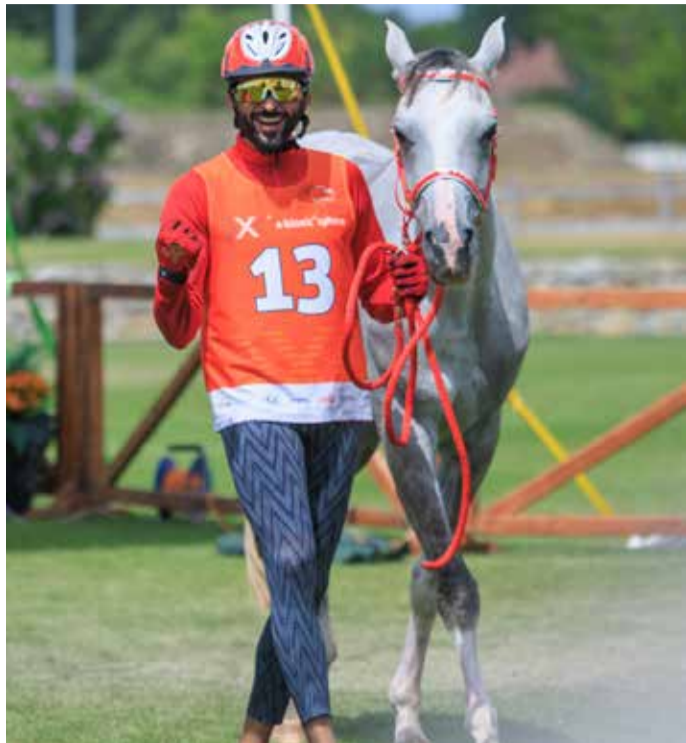
HH Shaikh Nasser bin Hamad Al Khalifa celebrates after winning at Samorin International Endurance Championship in Slovakia (file photo)

His Highness stated that the Royal Endurance Team's participation follows its recent successes in major European races in which HH had claimed four consecutive titles, including those of the Royal Windsor Horse Show, the Montal-