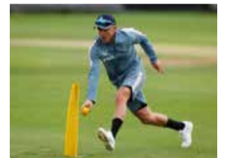
England's Sam Curran during nets

England all-rounder Sam Curran says third umpires should be able to rule on players obstructing the field rather than require players to appeal, as debate continued yesterday over Matthew Wade's clash with Mark Wood in a T20 World Cup warm-up.