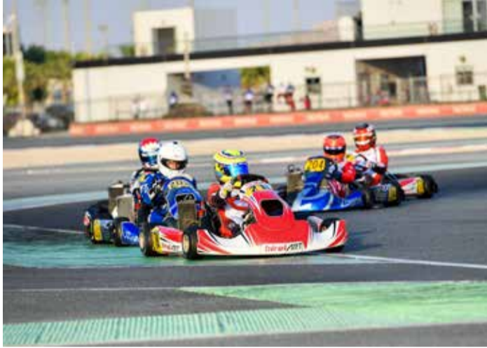
Action from a previous round (File photo)

The Kingdom's vibrant karting community will once again descend on the world-class grassroots motor racing facility of Bahrain International Circuit (BIC), with all still to play for in this SRMC campaign and the newest champions set to be