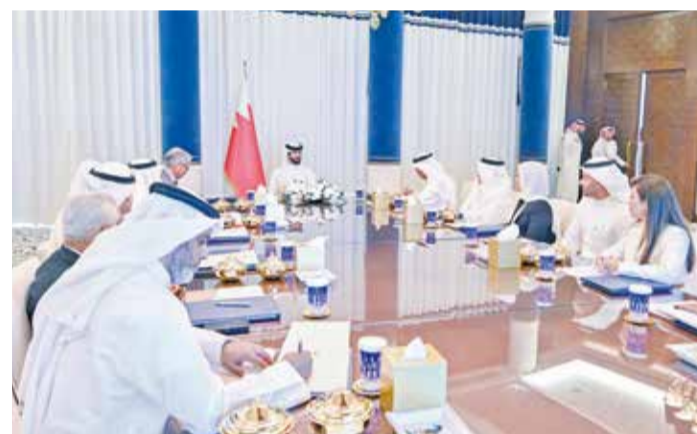
HH Shaikh Nasser chairs RHF's board meeting

He also updated the meeting on the strategic and investment projects implemented by the RHF in Bahrain and abroad, as well as its efforts to deliver support and services to orphans,