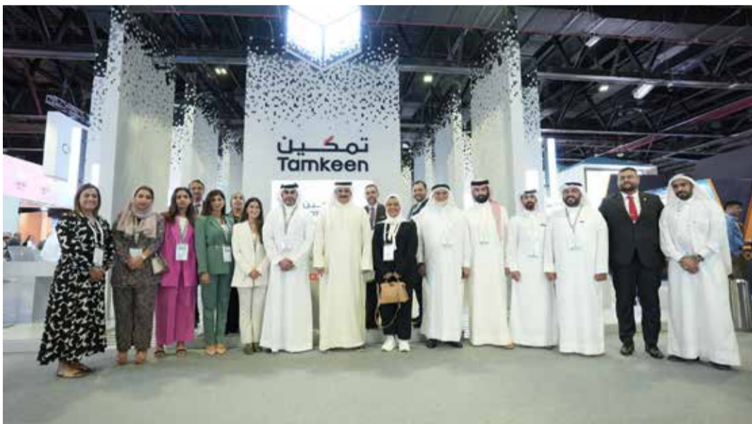
Bahrain's delegation to GITEX 2022

The week kicked off with the signing of an agreement by Bahraini startup VirtuThinko W.L.L. agreement on their first day participating in GITEX with the Boston-based American company HYCU, which specializes