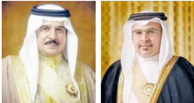
HM the King