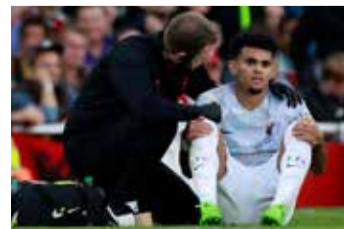
Luis Diaz receives medical attention

Liverpool forward Luis Diaz is expected to be out of action until late December after picking up a knee injury in the first half of Sunday's 3-2 Premier League defeat at leaders Arsenal, British media reported.