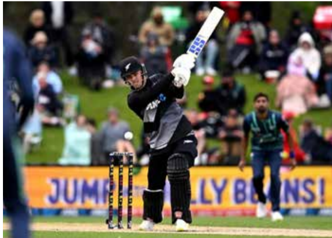
New Zealand's Finn Allen plays a shot AFP | Christchurch

Finn Allen showed his form ahead of the Twenty20 World Cup by top-scoring for New Zealand with a disciplined batting display in their nine-wicket romp over Pakistan in Christchurch yesterday in the tri-series.