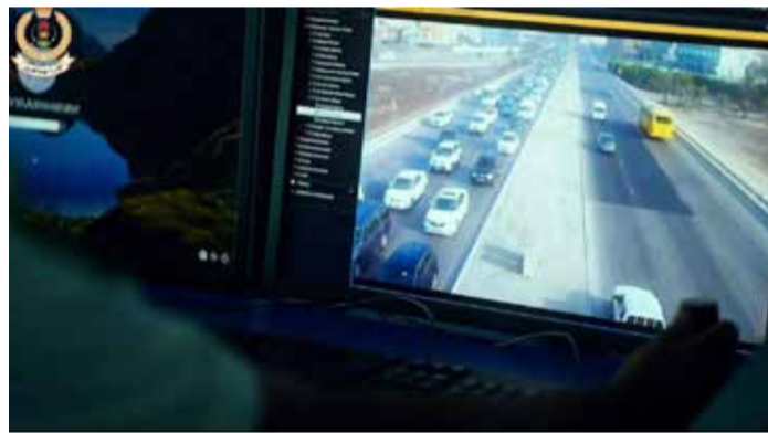
Driving on hard shoulders is a serious violation of traffic rules

The move aimed at ensuring the interests of students, parents and commuters by imple-