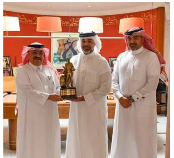
HH Shaikh Abdullah bin Hamad with a sponsor

HH Shaikh Abdullah bin Hamad Al Khalifa commended the sponsorship of Alba, Batelco and NBB and its positive impact on the team's performance. He affirmed the international reputation of Bahrain 1 Racing team and its standing as a