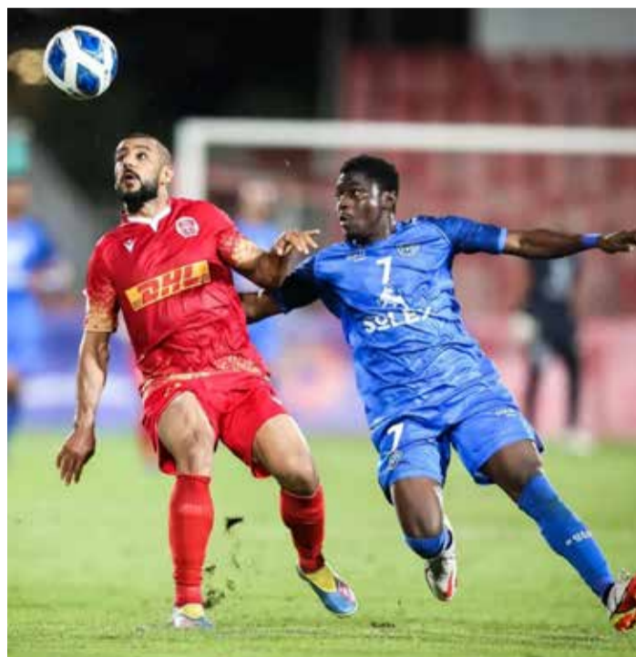
Action from Muharraaq's win over Busaiteen last night

With the results, Muharraaq set up a mammoth clash with league champions Riffa in their quarter-final meeting. Riffa had