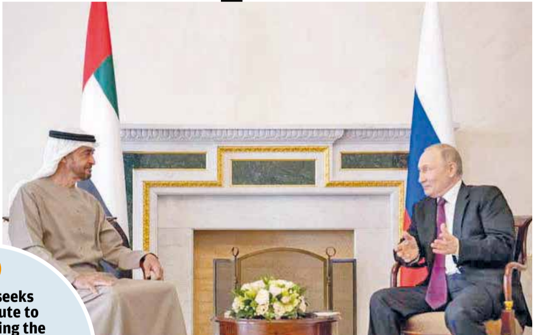
UAE President Shaikh Mohamed and President Putin hold talks in Saint Petersburg, Russia

UAE PRESIDENT SHAIKH MOHAMED BIN ZAYED AL NAHYAN