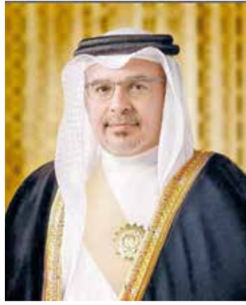
HRH Prince Salman

and all social sectors to provide decent life for all.