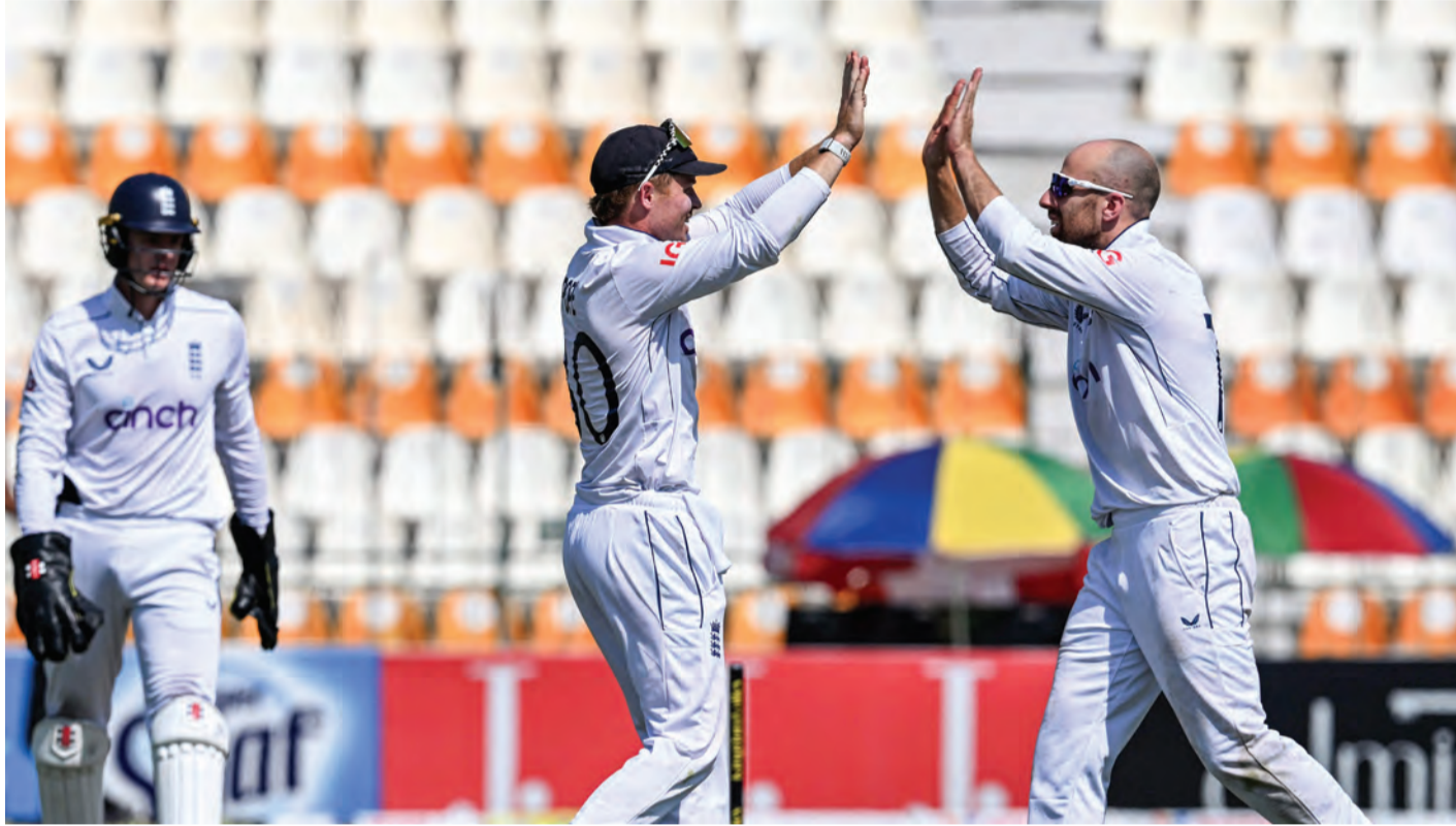
England captain Ollie Pope, left, celebrates with spinner Jack Leach, right

Brook smashed 317 and Root a record-setting 262 in England's mammoth 823-7 declared, giving the visitors a 267-run lead and both players their highest Test scores.