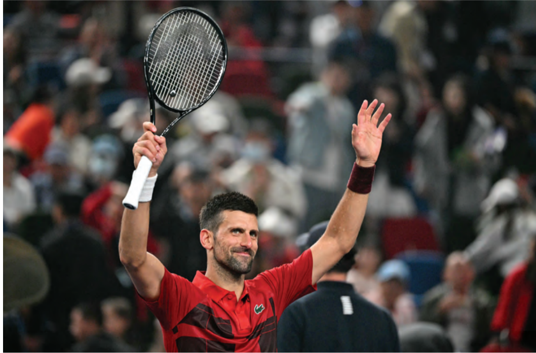
Novak Djokovic celebrates after winning against Jakub Mensik

Both Djokovic and 65th-ranked Mensik brought serious firepower to the court, their