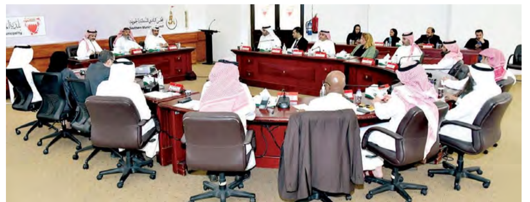
Southern Governorate Municipal Council meeting