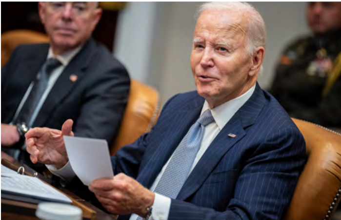
US President Joe Biden, accompanied by Homeland Security Secretary Alejandro Mayorkas from Iran."

The State Department announced it was sanctioning an additional six firms and six ships for "knowingly engaging in a significant transaction for the purchase, acquisition, sale, transport, or marketing of petroleum or petroleum products