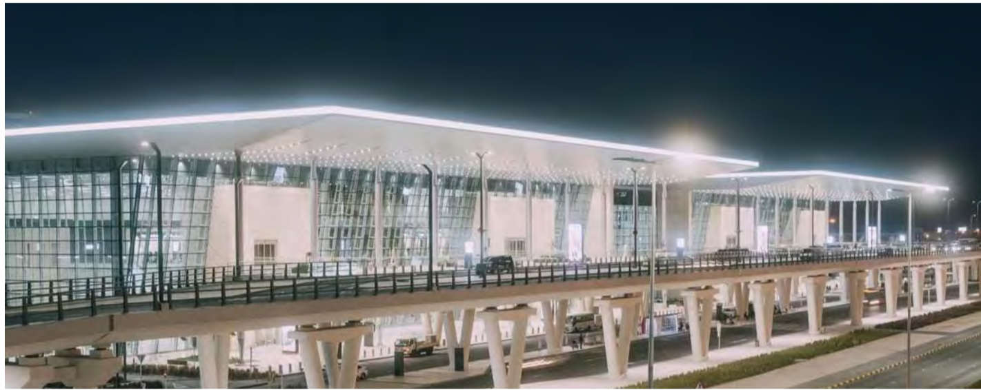
Bahrain International Airport (file)

The numbers tell a remarkable story: the King Fahd Causeway alone saw a staggering 1,476,813 passengers crossing its threshold. Meanwhile, Bahrain International Airport processed a total of 515,048 travellers, with 219,534 arriving and 295,514 departing. The country's sea ports contributed to the momentum with 3,274 passengers navigating their waters. This surge in traffic