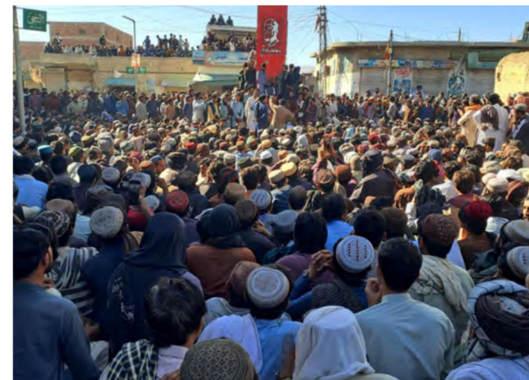
Labourers gather to protest against the killings of coal miners in an overnight attack in Duki district of Pakistan's southwestern Balochistan province