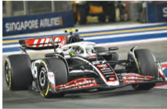
Haas F1 Team's Nico Hulkenberg drives during Singapore Grand Prix

The Japanese manufacturers spent eight seasons in Formula One before leaving at the end of 2009 with a record of 13 podium