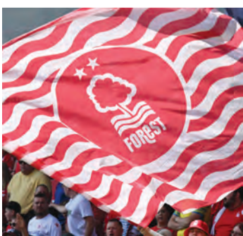
A flag of Nottingham Forest is waved ahead of a match

Forest were furious not to be awarded three penalties during a 2-0 defeat at Everton in April as they battled to preserve their Premier League status.