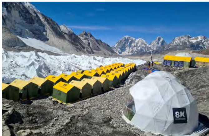
Tents of mountaineers are pictured at Everest base camp in the Mount Everest region of Solukhumbu district