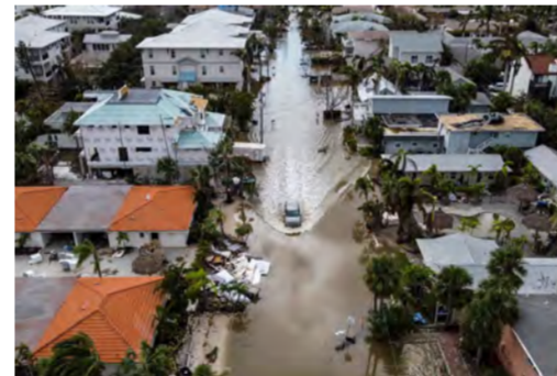
A vehicle drives through a flooded street after Hurricane Milton, in Siesta Key, Florida