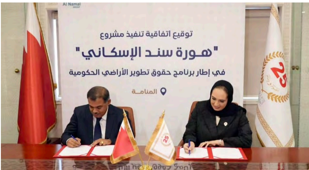
The deal signing