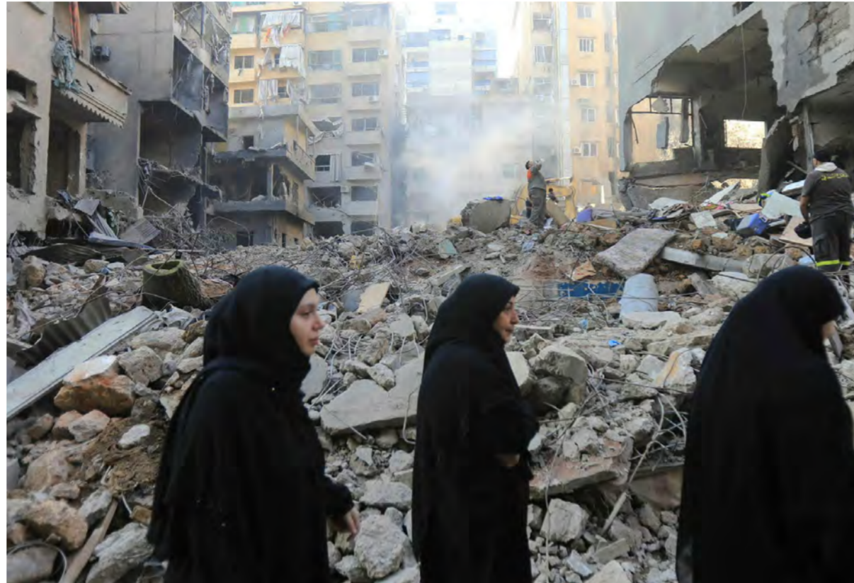
People walk past the rubble of a building at the site of an Israeli strike on the Basta neighbourhood in the Lebanese capital Beirut

A diplomatic backlash erupted after Israel's troops allegedly injured four UN peacekeepers in Lebanon, prompting Israel to launch a "thorough review" into the incident yesterday. UN peacekeepers patrolling the Lebanese side of the border with Israel have been thrust into the violence of the Israel-Hezbollah war that has killed more than 1,200 people in Lebanon, according to an AFP tally of Lebanese health ministry figures, and displaced a million others. The UN peacekeeping mission said two more of its members were wounded yesterday -- after two Indonesian Blue Helmets were injured on Thursday -- leading the Israeli army to say it was "conducting a thorough review at the highest levels