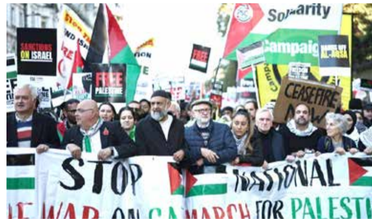
Former Labour party leader Jeremy Corbyn (C) joins protesters with placards and flags taking part in the 'National March For Palestine' in central London

Huge crowds marched through the British capital yesterday, as pro-Palestinian supporters made their latest mass call for a ceasefire, with police out in force to prevent clashes with counter-protesters. The "National March for Palestine", organised by the Stop the War Coalition, set off after a two-minute silence to remember Britain's war dead on Armistice Day was observed at The Cenotaph war memorial in central London at 1100 GMT. Huge crowds of protesters waved black, red, white and green Palestinian flags and held aloft placards proclaiming "Stop Bombing Gaza", just over a month since the crisis began.