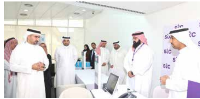
In pictures, minister during the opening ceremony of the event to support SMEs (BisB) and the SMEs Development Board.

The minister said this as he opened an event to support Small and Medium-sized Enterprises by Bahrain Islamic Bank