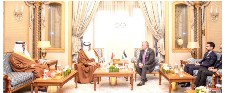
HRH Prince Salman during talks with Jordan King yesterday

● HRH said the war violates International resolutions and conventions