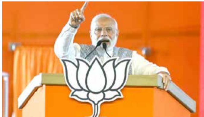
Indian Prime Minister Narendra Modi during a speech