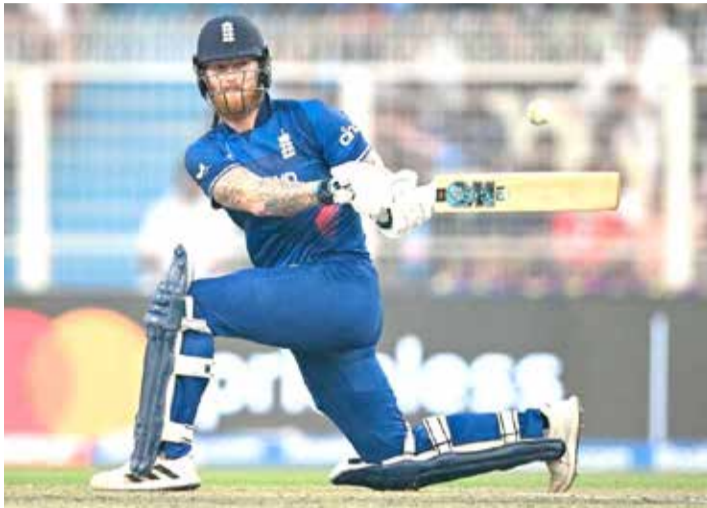
England's Ben Stokes plays a shot

Willey, who already announced he will retire from international cricket after the World Cup, removed Pakistan openers Abdullah Shafique (nought) and Fakhar Zaman (one) before dismissing Agha Salman for 51 to finish with 3-56.