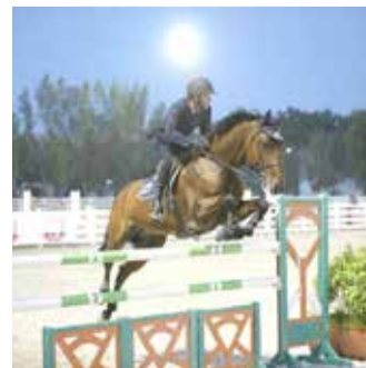
Action from the event