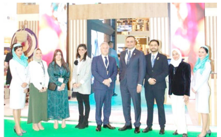
Officials during a group photo opportunity