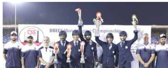
Winners with their trophies