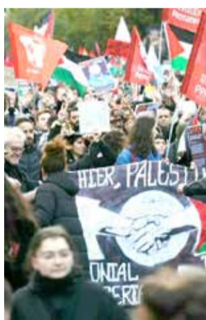
Protesters march in Paris AFP | Paris

Several thousand people demonstrated in Paris yesterday under the rallying cry "Stop the massacre in Gaza".