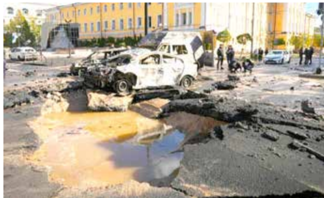
Police inspect the scene of Russian shelling in Kyiv, Ukraine