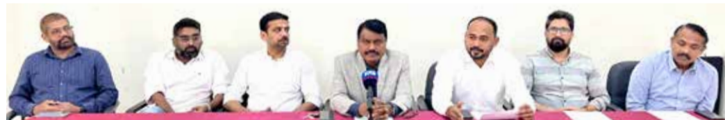
BKS officials during the press meet