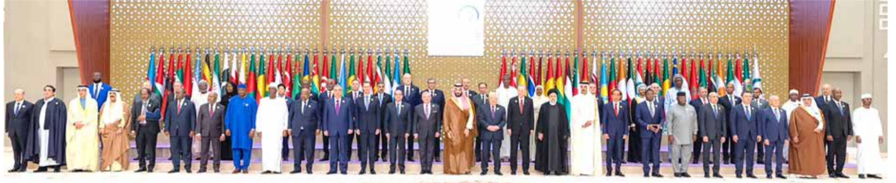
Leaders posing for a group picture ahead of an emergency meeting of the Arab League and the Organisation of Islamic Cooperation (OIC), in Riyadh yesterday