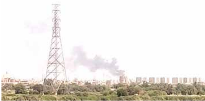
Smoke rises from north of Khartoum (file photo)

Images posted online, which AFP was unable to immediately