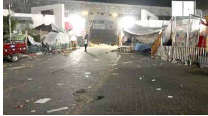
A picture shows a view of the exterior of Al-Shifa hospital in Gaza City AFP | Jerusalem

Two premature babies have died due to power cuts at Gaza's largest hospital, Physicians for Human Rights Israel said yesterday, citing doctors there, as fighting rages around the Al-Shifa complex. "As a result of the lack of electricity, we can report that the neonatal intensive care unit has stopped working. Two premature infants have died, and there is a real risk to the lives of 37 other premature infants" at Al-Shifa hospital, the Israeli doctors' group said in a statement. No fuel has entered Gaza in more than five weeks of war, prompting multiple hospitals and clinics relying on generators to shut down. "The hospital is besieged, with no option to bring in the corpses and injured people sprawled outside. There is no movement in or out of the hospital," Physicians for Human