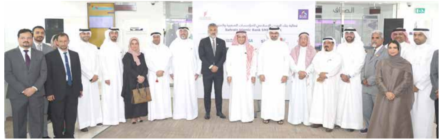
TDT | Manama

Bahrain will raise the share of SME financing to 20% of retail banks local finance portfolio by end 2025, said the Minister of Industry and Commerce.