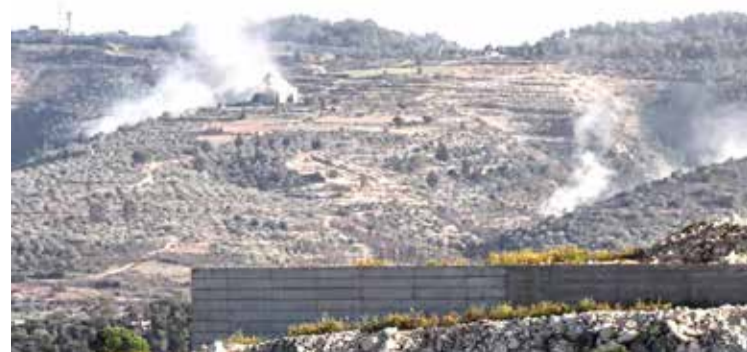
Shells fired from northern Israel fall close to the village of Yarine near Lebanon's southern border with northern Israel

An Israeli drone struck yesterday a vehicle deep in Lebanese territory, official media in Lebanon said, after weeks of skirmishes mainly limited to border areas since the Israel-Hamas war began. Lebanon's National News Agency (NNA) said "an enemy drone targeted a pick-up truck" on a farmland in the Zahrani area on Lebanon's coast, some 45 kilometres (28 miles) from the Israeli border, without reporting any casualties. The frontier between the two countries has seen daily exchanges of fire, mainly between Lebanon's Iran-backed Hezbollah