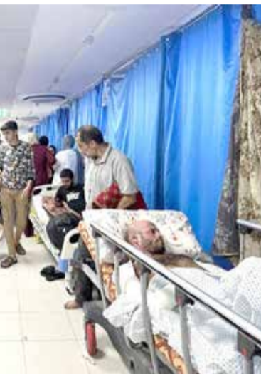
As pictured at Al-Shifa hospital in Gaza City

prompted growing calls for a halt in five weeks of fighting in order to protect civilian lives and allow humanitarian aid into the densely populated territory.