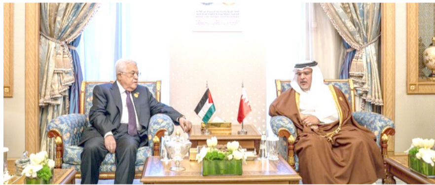
HRH Prince Salman during a meeting with Palestine President yesterday

"If it (Hezbollah) makes this kind of mistake here, the ones who will pay the price will be first and foremost Lebanese citizens," Gallant told soldiers on Israel's northern border in remarks relayed by his office. "What we're doing in Gaza, we can also do in Beirut."