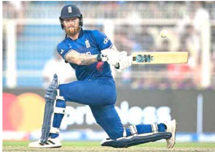
England's Ben Stokes plays a shot

Willey, who already announced he will retire from international cricket after the World Cup, removed Pakistan openers Abdullah Shafique (nought) and Fakhar Zaman (one) before dismissing Agha Salman for 51 to finish with 3-56.