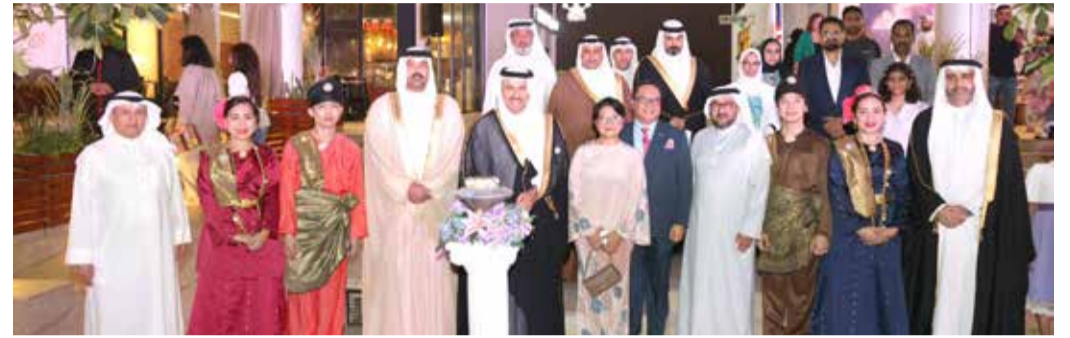
Attendees at the launching ceremony