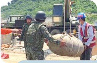
Unexploded 'corroded' bomb found at TSMC construction site in Taiwan

◆ A Taiwanese army unit yesterday removed a "corroded" unexploded 227-kilogram bomb from a construction site for a TSMC semiconductor plant in the island's south, authorities said. The "severely corroded" bomb was found at the Nanzih Technology Industrial Park in Kaohsiung where the Taiwanese chipmaking giant is building a new fabrication plant. Construction workers were briefly evacuated from the site while the army bomb disposal unit recovered the bomb. The 500-pound bomb appeared to be from an "early period" but its exact vintage could not be determined due to its "unclear serial number", 8th Field Army spokeswoman Kung Chiung-yu told AFP. The bomb was later taken to a secure storage facility where it will be destroyed, Kung said.