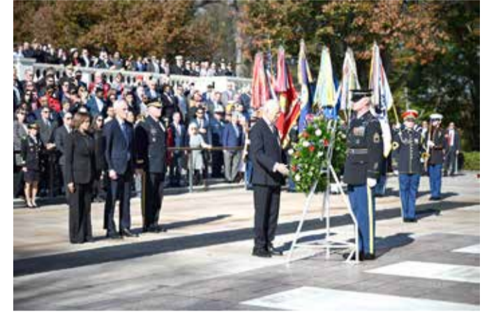
US President Joe Biden lays a wreath at The Tomb of the Unknown Soldier in Arlington National Cemetery to mark Veterans Day as Vice President Kamala Harris (L) and Veterans' Affairs Secretary Dennis McDonough (2nd L) look on November 11, 2024 in Arlington, Virginia