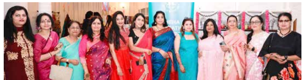
ILA officials and members along with other attendees