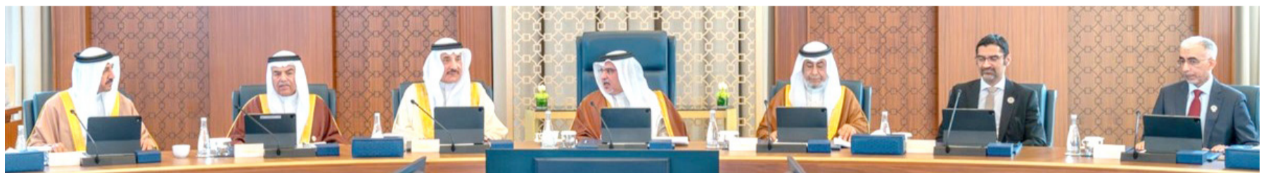
HRH the Deputy King chairs the weekly Cabinet meeting

Bahrain hopeful Arab summit will strengthen regional solidarity and help ease tensions