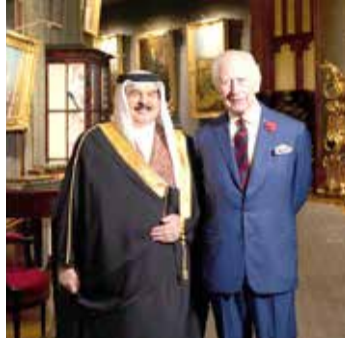
HM King Hamad meets HM King Charles III