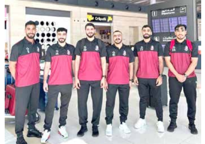
The Youth Club team has arrived in Doha, Qatar, to compete in the 27th Asian Club League Handball Championship. Hosted by Al Rayyan Club from November 12 to 23, this championship also serves as a qualifier for the 2025 IHF Men's Super Globe. Matches will take place at the Duhail Handball Sports Hall, under the Qatar Handball Federation

Arteta has been hampered by injuries to Martin Odegaard, Jurrien Timber and Bukayo Saka among others, with a rash of red cards also unsettling his side early in the season.