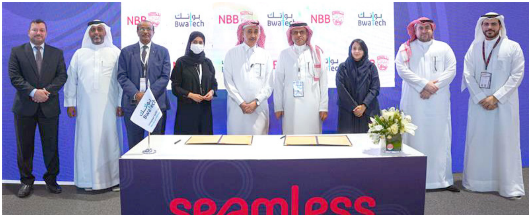
Officials during a photocall after the signing

By joining hands with prominent fintech companies, NBB remains demonstrably committed to leading innovation in the financial sector and becoming a key player in delivering transformative solutions to support businesses across the region.