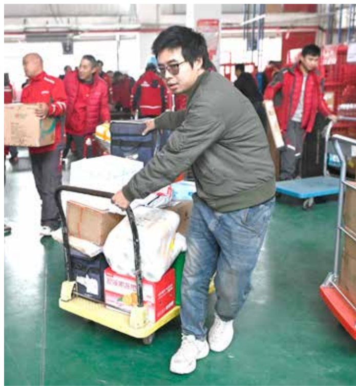
A worker pulls a trolley with packages for delivery after sorting at a JD.com warehouse in Beijing

Beijing has in recent weeks announced a slew of the most aggressive measures in years aimed at bolstering growth, including key rate cuts and increasing the debt limit for local governments.