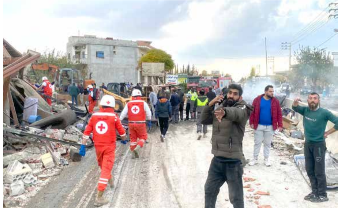
Rescuers from the Lebanese Red Cross search for victims and survivors at the site of an Israeli airstrike that targeted the village of Rasm El-Hadath in the eastern Lebanese Bekaa valley Abu Dhabi, United Arab Emirates

The Middle East needs "robust leadership" from the United States as the region faces multiple wars and crises, a top UAE official said yesterday as President-elect Donald Trump prepares to return to power.