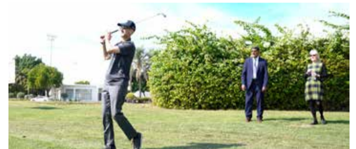
Action from a previous event on the golf course.”