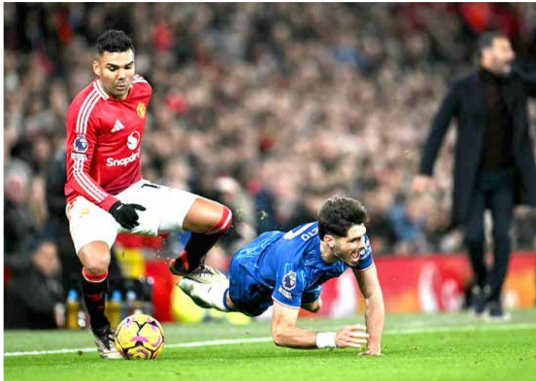
Manchester United's Brazilian midfielder #18 Casemiro fouls Chelsea's Portuguese midfielder #07 Pedro Neto

The popular former striker returned to Old Trafford in July