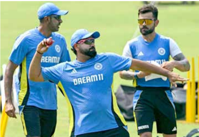
India's captain Rohit Sharma (C) with teammates Ravichandran Ashwin (L) and Virat Kohli attend a practice session

"I feel there is a lot of hunger, especially after what has happened in the last series," he said.