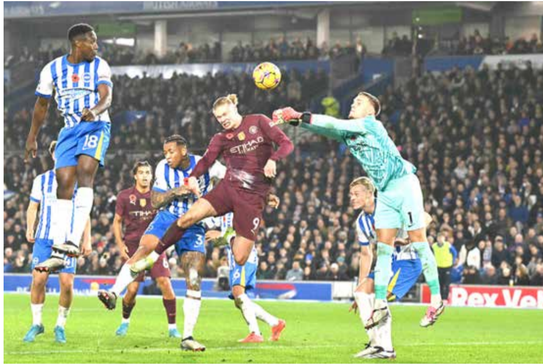
Manchester City's Erling Haaland (C) misses with this headed attempt

Guardiola’s men, chasing an unprecedented fifth straight Premier League title, are now five points behind leaders Liverpool after 11 matches in the