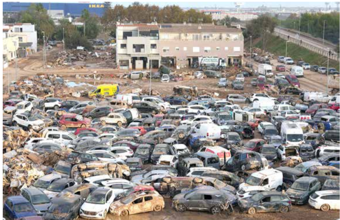
Flood-damaged vehicles are gathered on a plot after removing them from the streets of Alfafar, region of Valencia, eastern Spain, in the aftermath of deadly floods. Spain announced an aid package worth 10.6 billion euros ($11.5 billion) to rebuild regions devastated by its worst floods in a generation that have killed 219 people.

"The UAE will continue to work closely with the United States in this strategic and institutionally-based relationship," Gargash said.