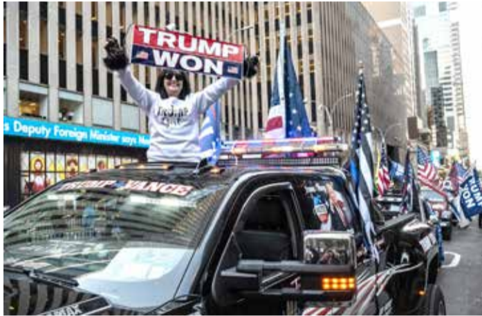
People participate in a car caravan in support of U.S. President-elect Donald Trump

But Trump said Sunday on social media that "any Republi-