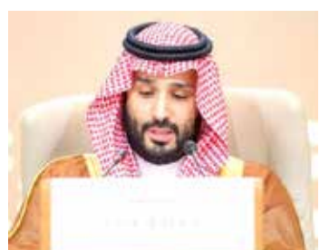
HRH Prince Mohammed bin Salman bin Abdulaziz Al Saud

Opening the summit, HRH Prince Mohammed said the international community must "immediately halt the Israeli actions against our brothers in