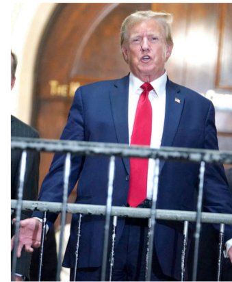
Former US President Donald Trump speaks to the media before departing the civil fraud trial against the Trump Organization, at the New York State Supreme Court in New York City

Donald Trump changed his mind about testifying in his own defense in his New York fraud case yesterday, he said, announcing that he will not take the stand as expected because he has "nothing more to say."