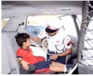
The campaign aims to improve children's safety on the roads

The organisers highlighted the importance of supporting national efforts aimed at achieving road safety through compliance with traffic laws and regulations, expressing their wishes for continued cooperation in serving the community.