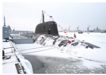
The new Krasnoyarsk nuclear submarine

Russian President Vladimir Putin Monday promised to reinforce Russia's "military-naval might" as he attended the inauguration of two nuclear submarines in the country's Far North.