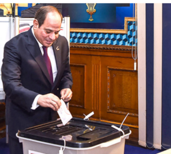
Egyptian president Abdel Fattah el-Sisi casting his vote in the presidential election at Mustafa Yousoy Emmera School in Cairo