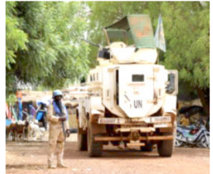
UN peacekeeping mission in Mali Bamako, Mali

The United Nations mission in Mali officially ended a 10-year deployment in the country on Monday, its spokesperson said, in a pullout ordered by Mali's military leaders.