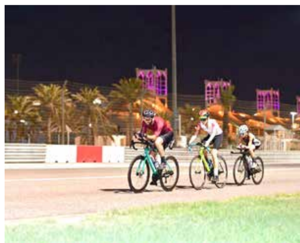
Cyclists at a previous Batelco Fitness on Track

BIC's Batelco Fitness on Track Season Pass is still also available. The pass is a great way to save money over the course of the year. Season Passes can be purchased by contacting the BIC Hotline.