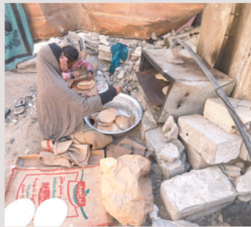
A Palestinian woman bakes bread inside a damaged house in Rafah on the southern Gaza Strip

In a workshop in the war-torn and besieged Gaza Strip, Ibrahim Shouman is bringing old brass stoves back to life, giving hope to displaced people deprived of gas for cooking.