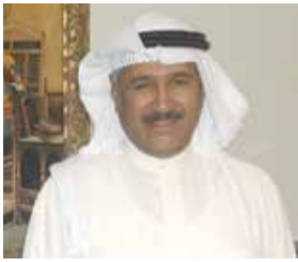
Ali Al Mahrous TDT | Manama

Former Minister and Ambassador Ali Al Mahrous, a prominent figure in the government, has passed away.