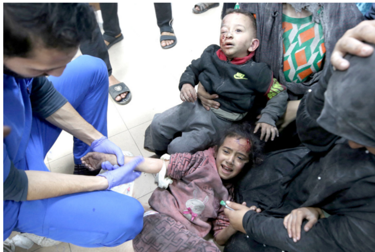
Palestinians injured following Israeli strikes on al-Maghazi refugee camp receive care at Al-Aqsa hospital in Deir Balah in the central Gaza Strip

UN Security Council ambassadors travelled to Egypt yesterday to meet Gazan