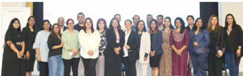
GOPIO and American Mission Hospital officials with participants

A panel discussion on psychological factors such as depression, trauma, harassment,