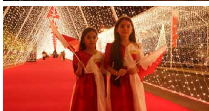
A mesmerising display of colours igniting the spirit of patriotism

fills. Medium-sized flags are available at approximately BDI, while larger flags range from BDI.5 to BD.