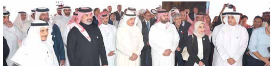
HH Shaikh Abdullah bin Hamad bin Isa Al Khalifa with government officials and industry leaders