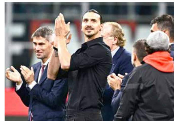
AC Milan's Swedish forward Zlatan Ibrahimovic acknowledges the public during a farewell ceremony (file photo)