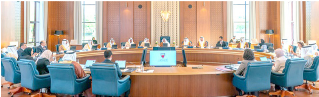
HRH the Crown Prince and Prime Minister chairs the weekly Cabinet meeting at Gudaibiya Palace

HRH Prince Salman orders distribution of 6,800 housing units to citizens starting from December 16