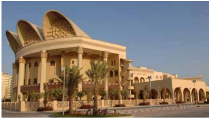
Isa Cultural Centre

Its statement highlights the kingdom's celebration of its National Days on December 16 and 17, in commemoration of the establishment of the mod-