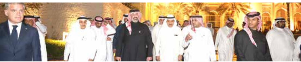
His Highness Shaikh Abdullah bin Hamad bin Isa Al Khalifa attends the ceremony representative of His Majesty the King and the President of the Supreme Council for Environment, management, and subsidiary Al Areen Holding Company, alongside strategic partners and media, the event provided a platform for the comprehensive disclosure of Areen's developmental plans.

The ceremony, held under the patronage of His Highness Shaikh Abdullah bin Hamad bin Isa Al Khalifa, Personal Rep-