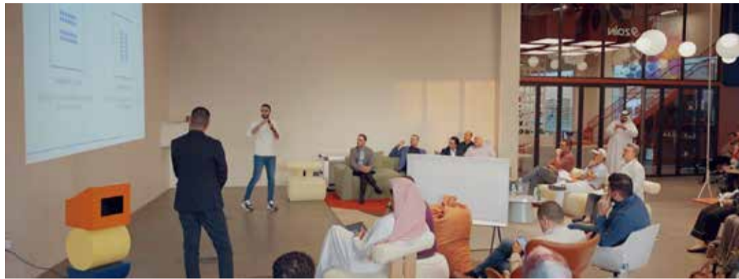
NBB Innovation Challenge