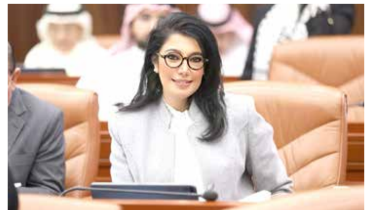
MP Maryam Al Dhaen

After noting down the grievances raised by the doctors, the MP included points from her first-hand experience of the situation in the bill and submitted it to the Parliament. At that point,