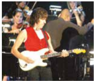
Jeff Beck | Los Angeles

Jeff Beck, the influential, genre-bending English guitarist who rose to fame with The Yardbirds before later embarking on a solo career, has died at the age of 78, his family announced on social media on Wednesday.