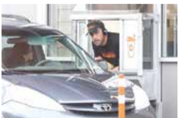
Ben Affleck takes orders at a Dunkin' Donuts drive-through in Boston

Margot told E! News about the kiss at the start of December: "That wasn't in the script, but I thought, 'When else am I gonna get the chance to kiss Brad Pitt? I'm just gonna go for it.' I said, 'Damien (Chazelle, the director), I think Nellie would just go up and kiss Jack (Brad's character)."