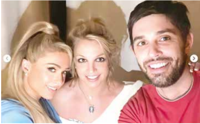
The image shared by Paris Hilton

Britney wrote on Instagram: "Also have no idea about these pics of me from a birthday party ... I haven't been to a bday party in forever!!! And as for the pics, those have to be from years ago!!! Kind of creepy and weird that no one is talking about that ... makes no sense whatsoever!!!" The birthday party took place