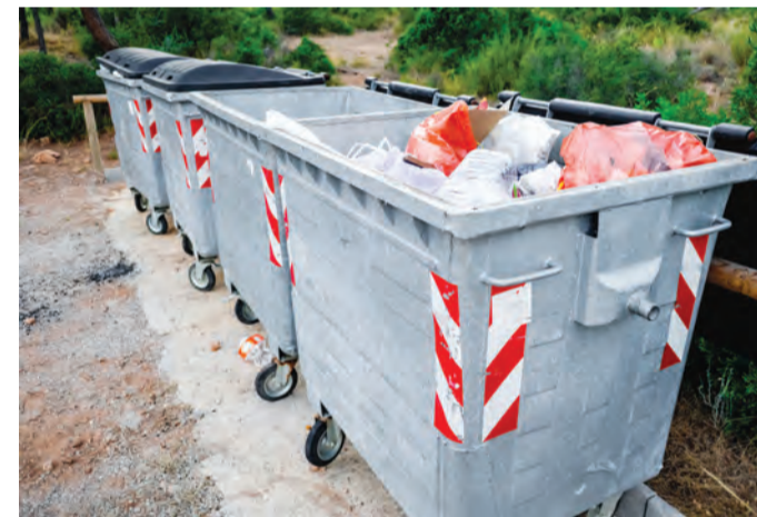
Metal garbage containers