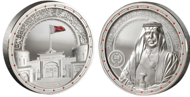
The limited-edition silver coin

The silver coin will be available in a limited quantity of 1,000 coins, each priced at BD125.