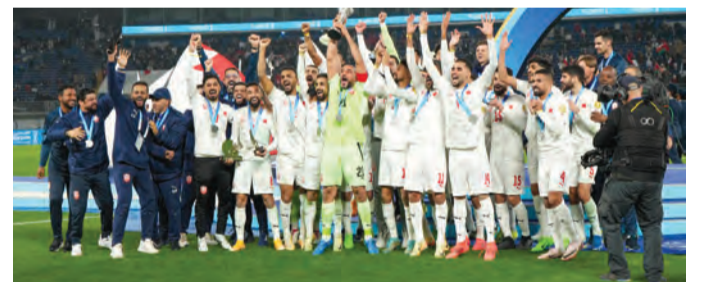
Players celebrate their win