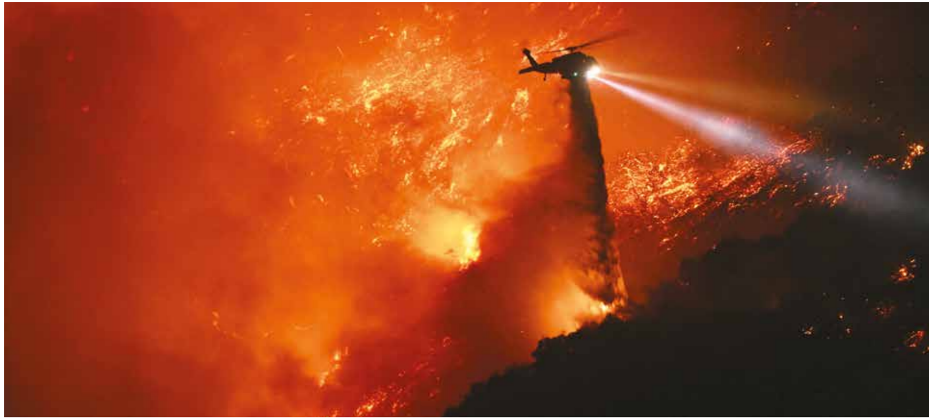
A fire fighting helicopter drops water as the Palisades fire grows near the Mandeville Canyon neighborhood and Encino, California

Syria's new leader Ahmed al-Sharaa, who led the main rebel group in the alliance that overthrew Assad, is pushing for sanctions relief. His administration is represented at the Riyadh talks by Foreign Minister Asaad al-Shaibani. Western powers, including the United States and the EU, imposed heavy sanctions on Assad's government over his brutal crackdown on anti-government protests in 2011, which triggered civil war. Some US sanctions long pre-date the conflict, with Washington labelling Syria a "state sponsor of terrorism" in 1979 and adding further measures in 2004.