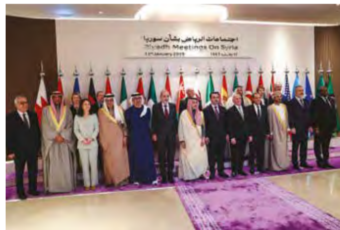
Saudi Foreign Minister Faisal bin Farhan hosting a meeting of top diplomats from the Middle East and Europe to discuss Syria, poses for a picture with the participants in Riyadh