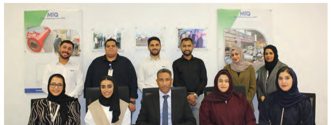
Representatives of Tamkeen and MTQ Oilfield Services

Tamkeen supports more than 50 Bahrainis at MTQ Oilfield Services through Career Development and Apprenticeship programs