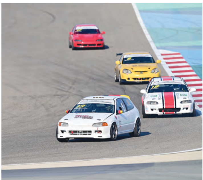
Action from the race

The event was organised by BIC, the Bahrain Motor Federation, the Circuit Racing Com-