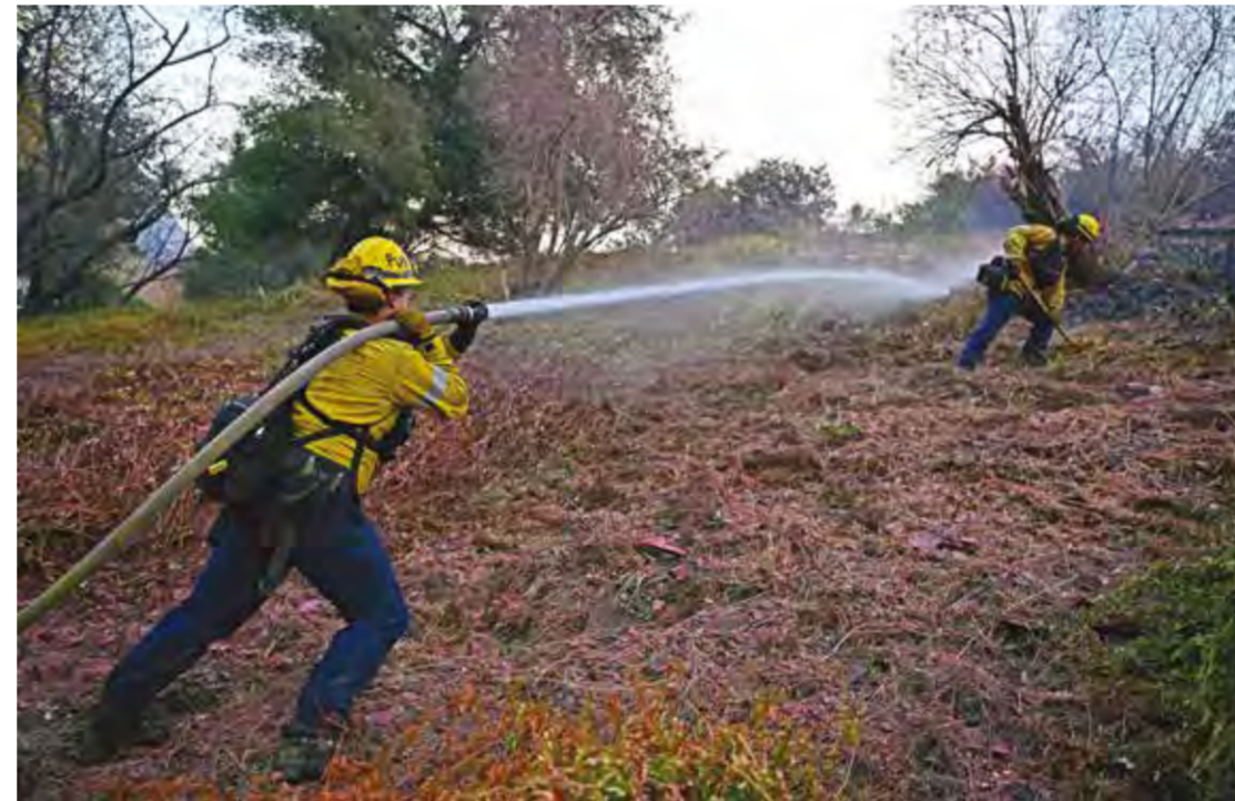
Firefighters work to put out flames in the Mandeville Canyon neighborhood of Los Angeles, California

Firefighters battled yesterday to get on top of massive wildfires around Los Angeles as winds ramped up, pushing the blazes toward previously untouched neighborhoods. At least 16 people were confirmed dead from fires that have ripped through the city, leaving communities in ruins and testing the mettle of thousands of firefighters -- and millions of California residents.