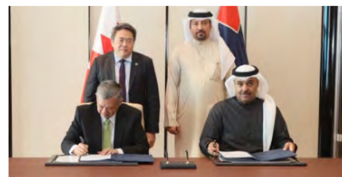
The Customs Affairs and CrimsonLogic Company signed memorandums for the pilot launch of the Customs Single Window (OFOQ2) system after passing phases of the national project as part of efforts to promote customs services and information security. The OFOQ2 is an integrated system that aims to facilitate commercial and customs operations.