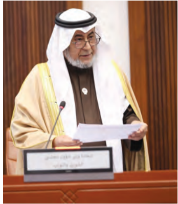
H.E. Ghanim Buainain Mohammed Darwish TDT | Manama

Shura Council rejects proposal for stricter hiring requirements for expats, calling it unnecessary and unworkable