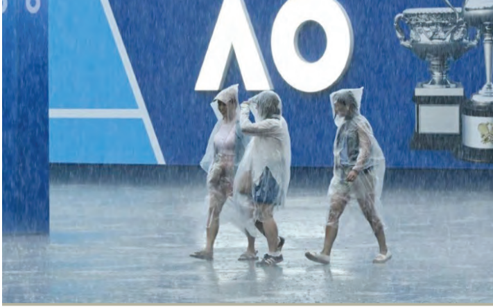
People walk in heavy rain beside tournament signage

● Nishikori won a five-set marathon match