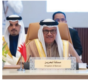
H.E. Dr. Al Zayani speaks at the event