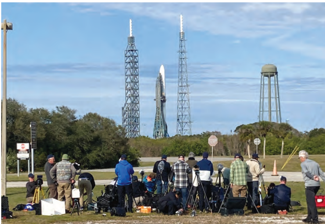
Blue Origin's New Glenn rocket sits on the launch pad one day before its maiden flight (NG-1) at the Kennedy Space Center in Cape Canaveral, Florida

These serve the commercial sector, the Pentagon, and US space agency NASA -- including,