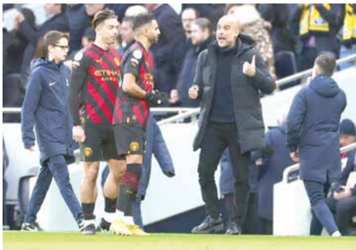
Pep Guardiola manager of Manchester City with Riyad Mahrez and Jack Grealish during a match (file photo)

City issued a statement on Monday saying: "The club welcomes the review of this matter by an independent commission, to impartially consider the comprehensive body of irrefutable