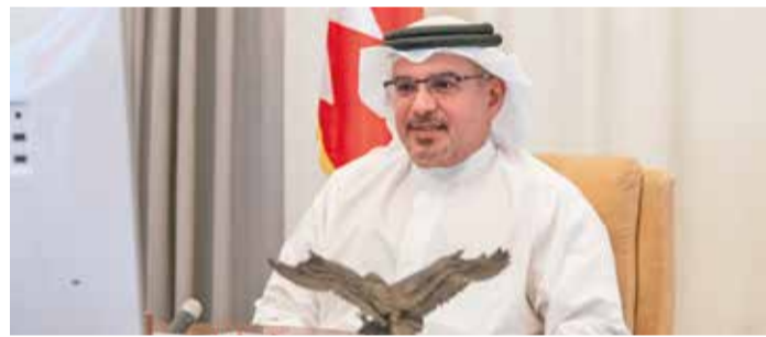
HRH the Crown Prince

HRH the Crown Prince reaffirmed that historical ties continue to go from strength to strength with His Majesty King Hamad bin Isa Al Khalifa's strong support for expanded relations between Bahrain and the US, and concerted efforts aimed at upholding regional peace and security.