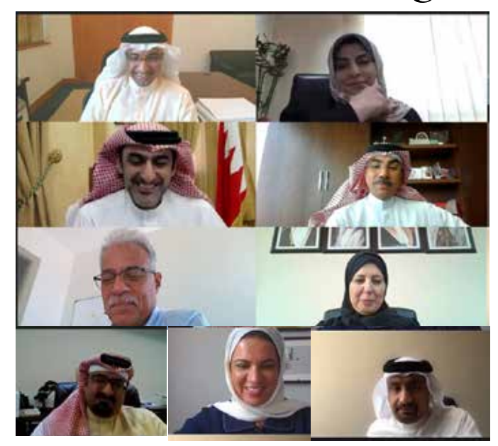
A screen shot of the online meeting