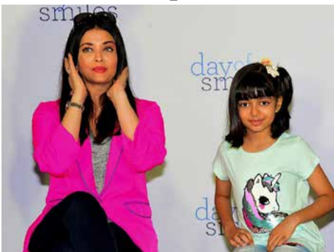
Aishwarya Rai Bachchan and daughter Aaradhya