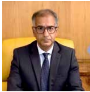
Dr. Bucheeri TDT | Manama

Tolerance, brotherhood and humanity are among the core values and messages of the Holy Quran, and the Islamic religion advocates for coexistence and respect for others.