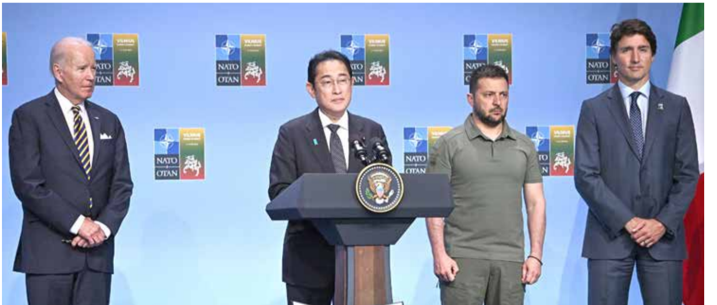
Ukrainian President Zelensky, third, with US President Joe Biden, left, Japan's Prime Minister Fumio Kishida, and Canada Prime Minister Justin Trudeau, right, at the event yesterday.

But he did not disguise the fact that he would have preferred the 31-member Atlantic alliance to have agreed a firm timetable for Ukraine to join its ranks once the 16-month old Russian invasion has been de-