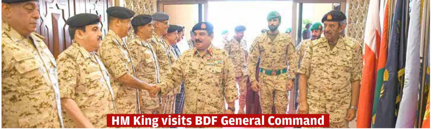
HM King visits BDF General Command

His Majesty King Hamad bin Isa Al Khalifa, the Supreme Commander of the Armed Forces, visited the General Command of the Bahrain Defence Force (BDF). Upon arrival, HM the King was received by Field Marshal Shaikh Khalifa bin Ahmed Al Khalifa, the Commander-in-Chief of BDF, Lieutenant General His Highness Shaikh Nasser bin Hamad Al Khalifa, the National Security Advisor and Royal Guard Commander, Colonel His Highness Shaikh Khalid bin Hamad Al Khalifa, the Commander of the Royal Guard's Special Force, Lieutenant-General Abdullah bin Hassan Al Nuaimi, Minister of Defence Affairs and senior BDF staff. HM the King praised the continuous development of the BDF in various disciplines and the high efficiency of its staff. He expressed his confidence and appreciation to BDF's staff, wishing them further success in performing their duties.