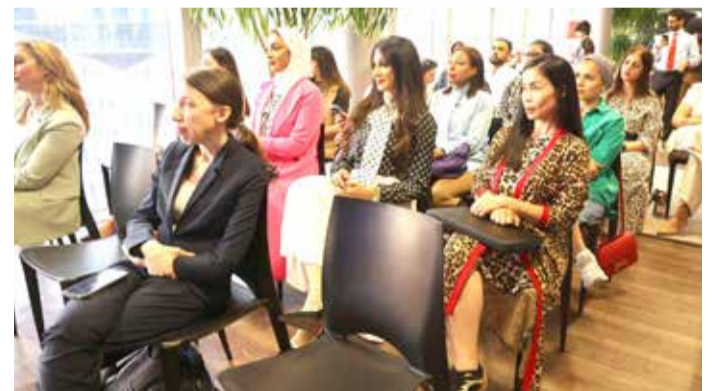
Participants at the event

Bahrain has more than 54% female participation in the public sector, and 45% of women hold executive positions in oth-