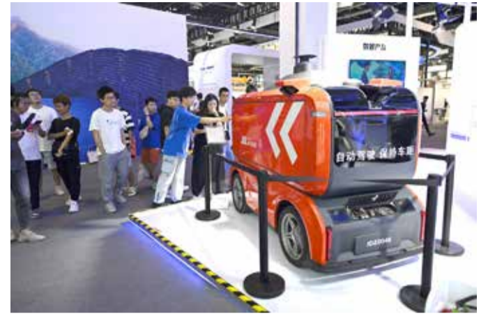
A self-driving automobile is displayed at the booth of JD Cloud during the World Artificial Intelligence Conference (WAIC) in Shanghai

“Whether and how quickly they resume a downward trajectory will depend on the speed of innovation and on the stability of mineral markets that witnessed significant volatility in 2022 after two years of pandemic-related supply chain disruptions followed by the onset of global geopolitical uncertainty.”