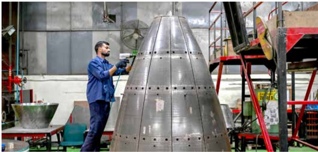
An engineer works on a component at a Godrej Aerospace manufacturing plant, which manufacture various parts for the Vikas and cryogenic engines for the Indian Space Research Organisation's (ISRO) space missions, in Mumbai

India tomorrow launches its latest attempt at an unmanned moon landing, the next frontier of a burgeoning, cut-price aerospace programme rapidly closing in on the milestones set by global superpowers.