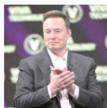
Musk electric vehicle market and Tesla announced in April it would build a second massive factory in Shanghai.