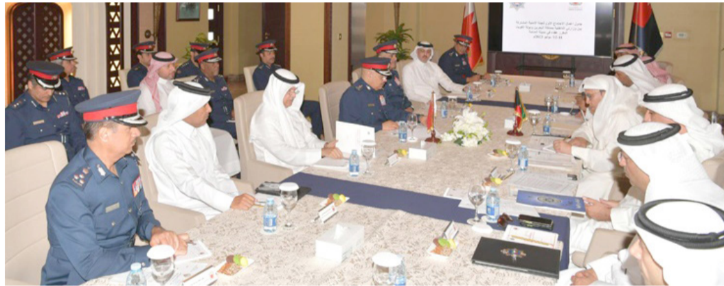
The meeting in progress

Chief of Public Security delivered a speech in which he welcomed Undersecretary of