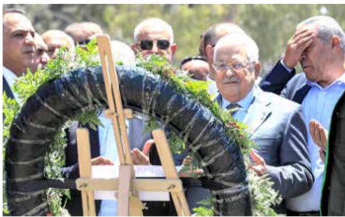
Abbas (2nd-R) recites a prayer as he lays a wreath of flowers by the graves of Palestinians killed in recent Israeli military raids

Several top officials of Abbas's Fatah party, including deputy chairman Mahmoud Aloul, had visited the camp