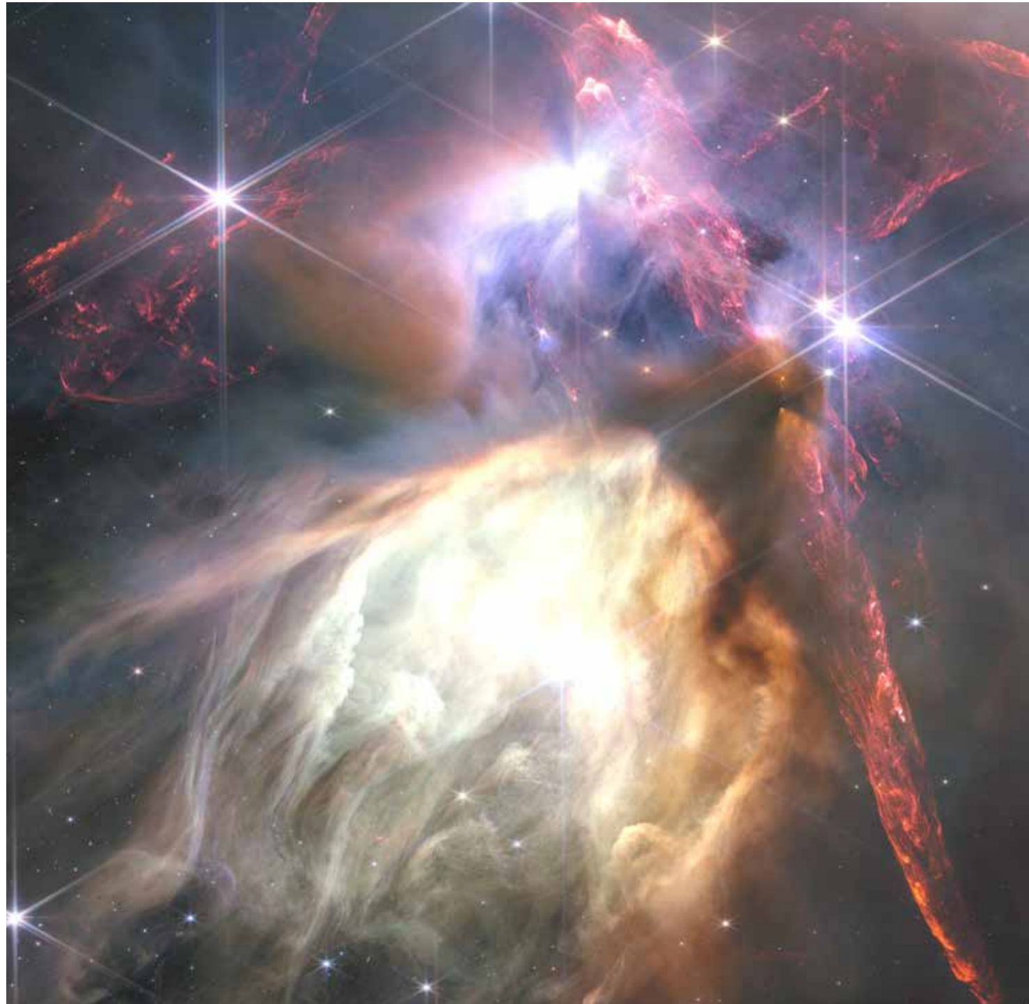
A small star-forming region in the Rho Ophiuchi cloud complex, the closest star-forming region to Earth.