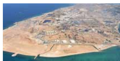
An aerial view of Abu Musa island

the Gulf Cooperation Council and Russia held talks and called for "a peaceful solution" to the issue of the Greater and Lesser Tunb islands and Abu Musa. They urged a resolution through "bilateral negotiations or the International Court of Justice, in accordance with the rules of international law and the United Nations Charter".