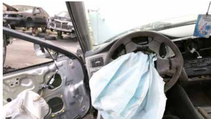
A deployed airbag is seen in a 2001 Honda Accord at the LKQ Pick Your Part salvage yard in Medley, Florida

Stellantis sent six recall notices, but “all went unheeded,” the