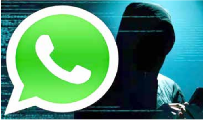
Beware of dubious Whatsapp calls and messages. (Image used for illustrative purposes only)

"The Ministry of Health warned of phone calls and messages via WhatsApp bearing its logo or the logo of the application BeAware from numbers inside and outside the Kingdom of