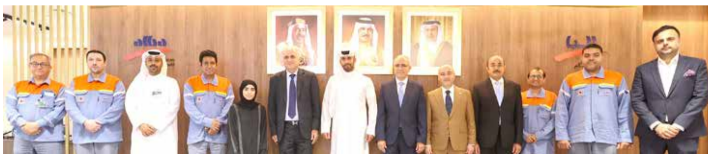
In pictures, the honouring ceremony held at Alba's premises