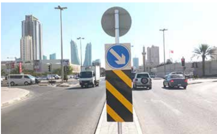
The Works Ministry regularly conducts maintenance of traffic signs for public safety