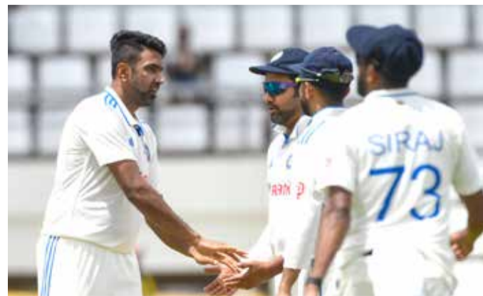
Ravichandran Ashwin (L) and Rohit Sharma (R), of India, celebrate the dismissal of Tagenarine Chanderpaul, of West Indies, during day one of the First Test between West Indies and India at Windsor Park in Roseau, Dominica

Sharma's opposite number, Brathwaite, will be regretting his decision to bat first at this stage as the home side resumes in the afternoon session with local boy and debutant, Alick Athanaze (13 not out) seeking to impress against a confident Indian side.