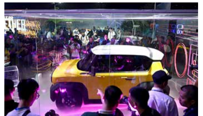
People look at an electric car displayed during the launch of VinFast electric car models in Hanoi