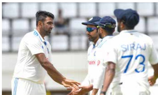
Ravichandran Ashwin (L) and Rohit Sharma (R), of India, celebrate the dismissal of Tagenarine Chanderpaul, of West Indies, during day one of the First Test between West Indies and India at Windsor Park in Roseau, Dominica