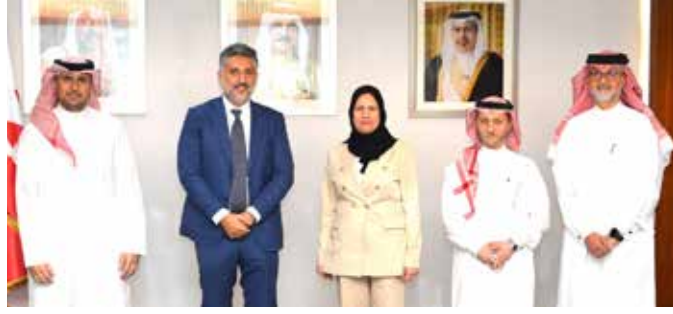
Officials of BisB and SIO after signing the agreement