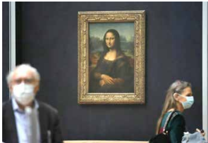
Journalists walk past Leonardo da Vinci's Mona Lisa during a visit of the Louvre museum (file photo) | Paris

The "Mona Lisa" has given up another secret.