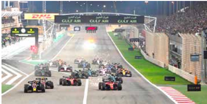
The F1 Gulf Air Bahrain Grand Prix...motorsport spectacle

and social spectacle is scheduled to take place 29 February to 2 March at "The Home of Motorsport in the Middle East". It will be the season-opening round of the 2024 FIA F1 World Championship.