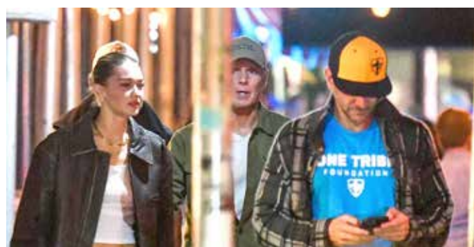
Gigi Hadid and Bradley Cooper

Gigi Hadid and Bradley Cooper "have a lot in common". The 28-year-old model and Bradley, 48, were recently spotted together in New York City, and in spite of their 20-year age gap, the celebrity duo actually have quite a lot in common. An insider told Us Weekly: "They're both single parents to a young daughter and they share a similar sense of humour." Gigi has Khai, three, with ex-boyfriend Zayn Malik, while Bradley has