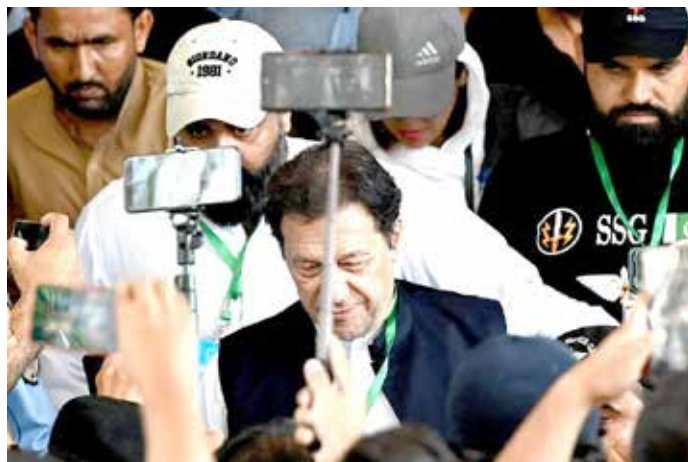
Pakistan's former Prime Minister Imran Khan (C) leaves after appearing in the Supreme Court in Islamabad (file photo)

The establishment responded with a fierce crackdown - rounding up thousands of