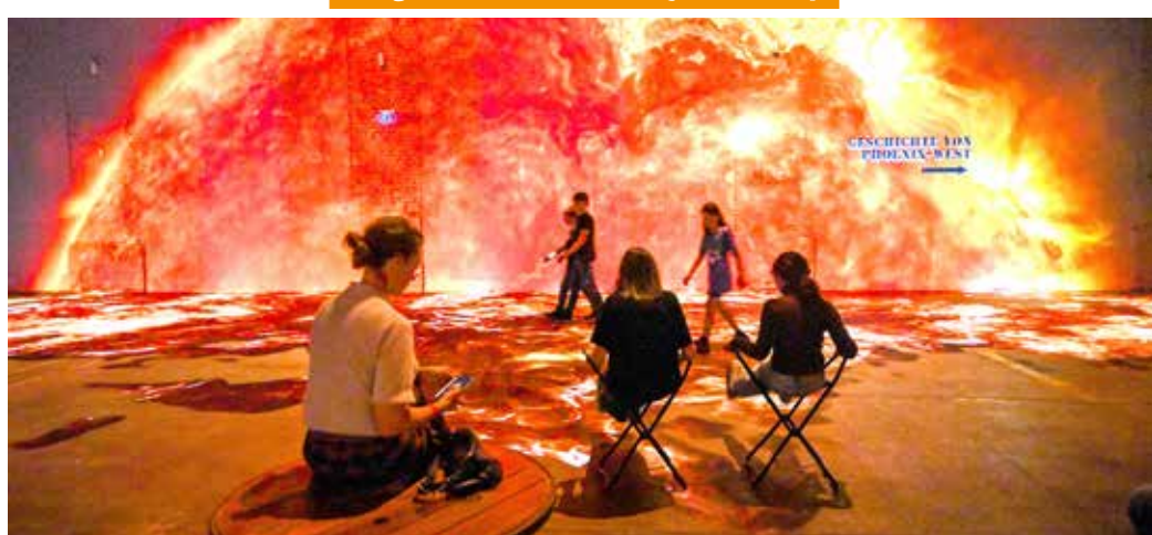
Visitors are seen during the new digital exhibition 'Destination Cosmos - An Infinite Journey' at the former gas plant Phoenix West in Dortmund, western Germany yesterday. In 2023, production company Culturespaces created an immersive art centre at the Phoenix Halle, a former gas treating plant, part of the famous Phoenix West blast furnace. The exhibition is open to the public until January 5, 2024.