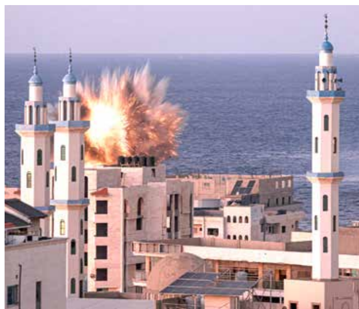
A fireball erupts from an Israeli airstrike in Gaza City yesterday.

By noon, the International Committee of the Red Cross (ICRC) said the humanitarian situation in Gaza will become unmanageable very quickly. By yesterday morning, hospitals in Gaza stopped providing care to all but emergency cases, faced with the lack of electricity and