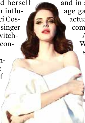
Lana Del Rey