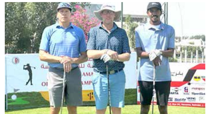
Golfers prior to teeing off yesterday

A field of 100 amateur players from all over the world are