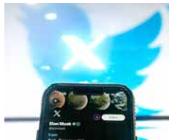
An illustration photo shows the Twitter page of Elon Musk in front of the new X Twitter logo and old bird Twitter logo

Tesla and SpaceX boss Musk bought the platform, then