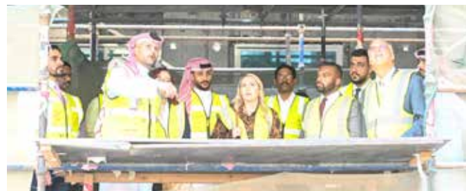
US Congress visitors are briefed about Salman City's housing units and infrastructure services