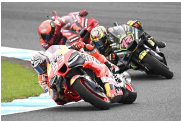
Repsol Honda Team's Marc Marquez rides during a race

The 30-year-old Spaniard, who has been hampered by in-