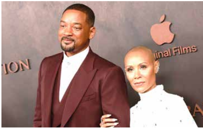
Will Smith and his wife Jada Pinkett Smith

living "totally separate lives" for years before the notorious incident, Pinkett Smith told NBC News. "By the time we got to 2016 we were just exhausted with trying," she said, in an advance clip from an interview to promote her new memoir, "Worthy." Rumors of affairs and an open marriage were repeatedly denied by the couple for many years. But in 2020, Pinkett Smith openly discussed an extramarital "entanglement" she had with singer August Alsina