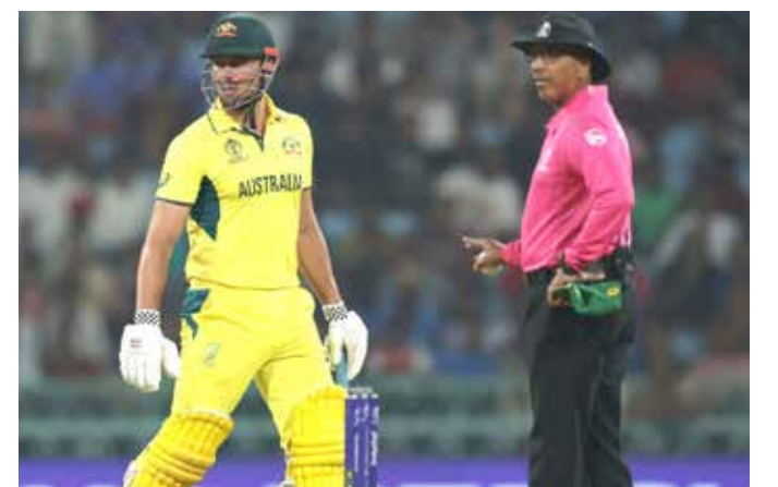
Marcus Stoinis seeks clarification from Joel Wilson after being adjudged