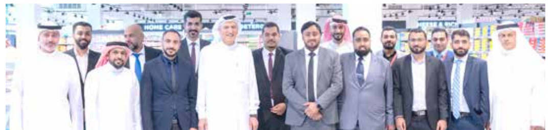
Officials of Tamkeen and Al Helli Supermarket pose for a photo

milestone in the supermarket's journey, and Tamkeen will support the employment of national talent across various positions in the organization. This expansion project will provide 86 jobs for Bahrainis, while 161