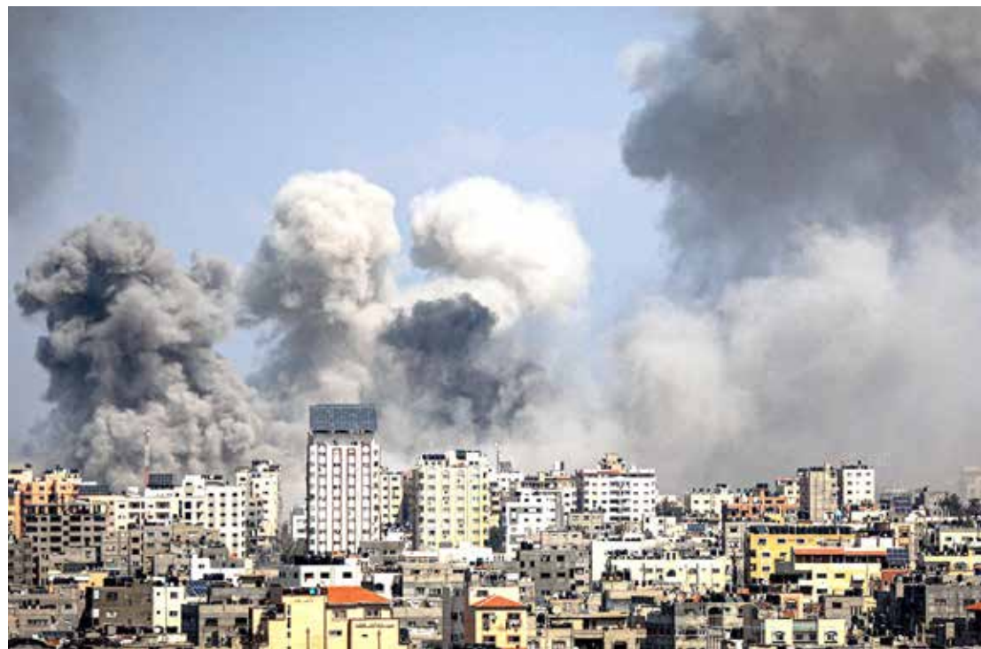
Smoke plumes billow during Israeli air strikes in Gaza City

The attack killed 1,200 people in Israel while Hamas took about 150 hostages in their surprise on-