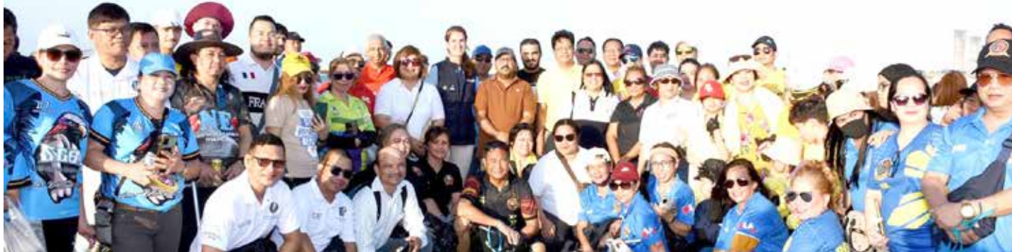
Participants in the eco-friendly activity

More than 1,200 volunteers participated in the event,