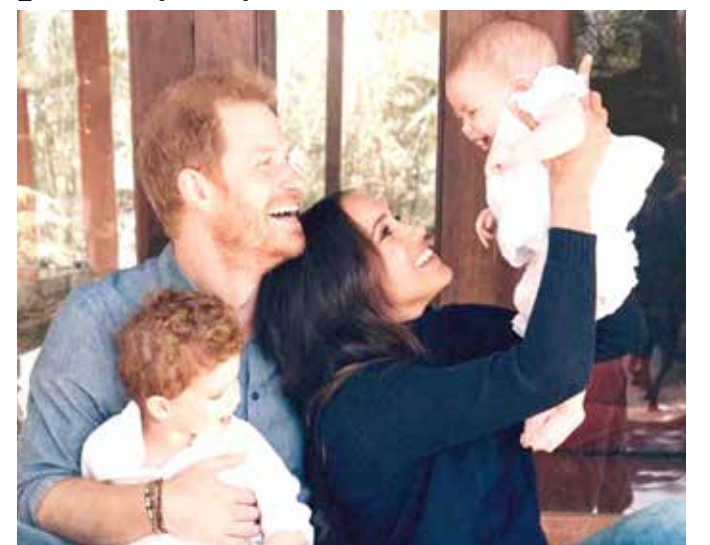
Prince Harry and Meghan with their kids