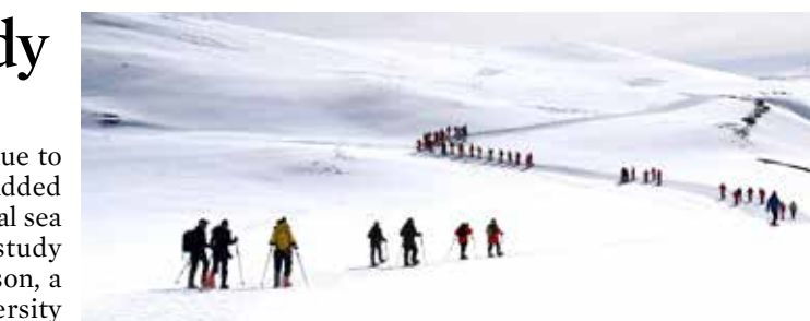
Tourists visit Half Moon island, Antarctica

US officials are discussing safe passage both with Israel and Egypt, which also borders the Gaza Strip, ahead of an expected Israeli ground operation.