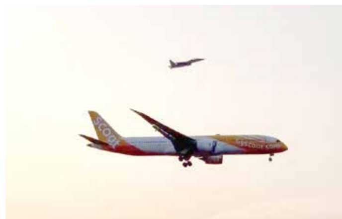
One of two RSAF fighter jets escorting Scoot flight TR16 back to Changi Airport

Scoot said the flight landed safely about two hours after takeoff, and security checks