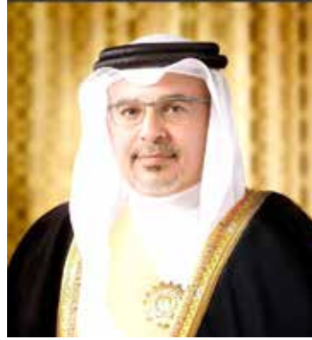
HRH Prince Salman