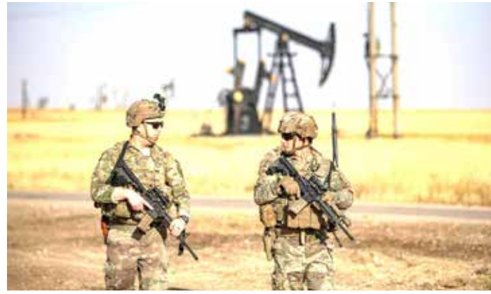
US troops patrol near an oil well in al-Qahtaniyah in Syria's northeastern Hasakah province (file photo)

The region accounts for more than one-third of the world's seaborne oil shipments.