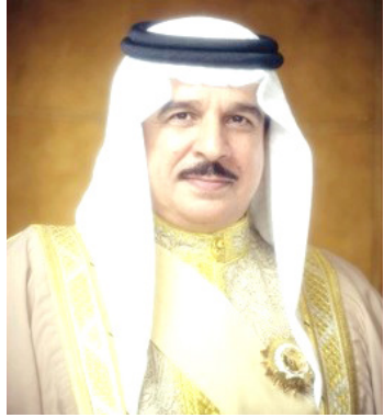
HM the King

HM the King and HRH Prince Salman received cables of thanks