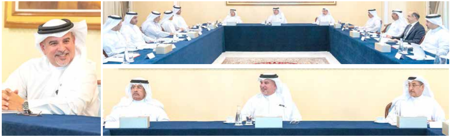
The Deputy King, His Royal Highness Prince Salman bin Hamad Al Khalifa, chaired the 466th Government Executive Committee meeting. The implementation of the Economic Recovery Plan's 2022-2026 tourism sector strategy, labour market regulations development, and the sixth National Telecommunications Plan were reviewed.