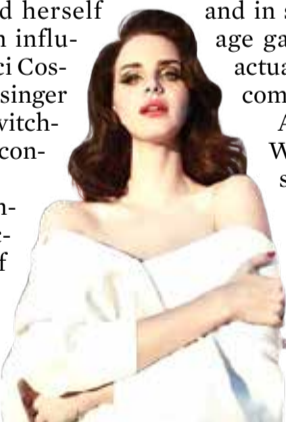
Lana Del Rey