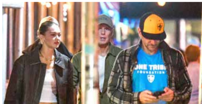
Gigi Hadid and Bradley Cooper

Gigi Hadid and Bradley Cooper "have a lot in common." The 28-year-old model and Bradley, 48, were recently spotted together in New York City, and in spite of their 20-year age gap, the celebrity duo actually have quite a lot in common. An insider told Us Weekly: "They're both single parents to a young daughter and they share a similar sense of humour." Gigi has Khai, three, with ex-boyfriend Zayn Malik, while Bradley has