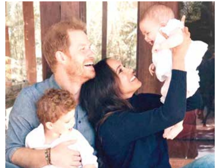
Prince Harry and Meghan with their kids