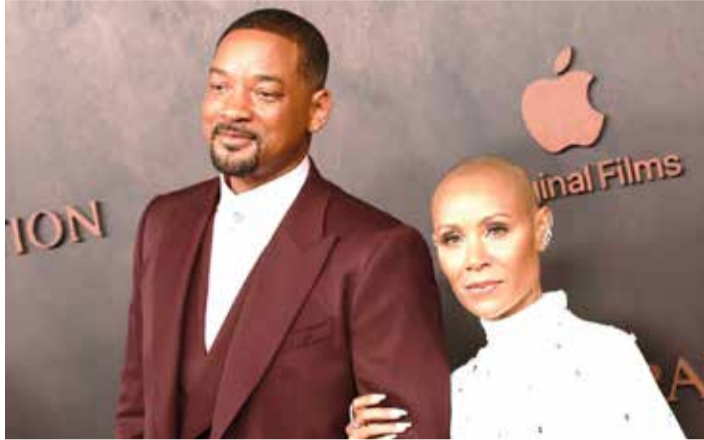
Will Smith and his wife Jada Pinkett Smith

living "totally separate lives" for years before the notorious incident, Pinkett Smith told NBC News. "By the time we got to 2016 we were just exhausted with trying," she said, in an advance clip from an interview to promote her new memoir, "Worthy." Rumors of affairs and an open marriage were repeatedly denied by the couple for many years. But in 2020, Pinkett Smith openly discussed an extramarital "entanglement" she had with singer August Alsina