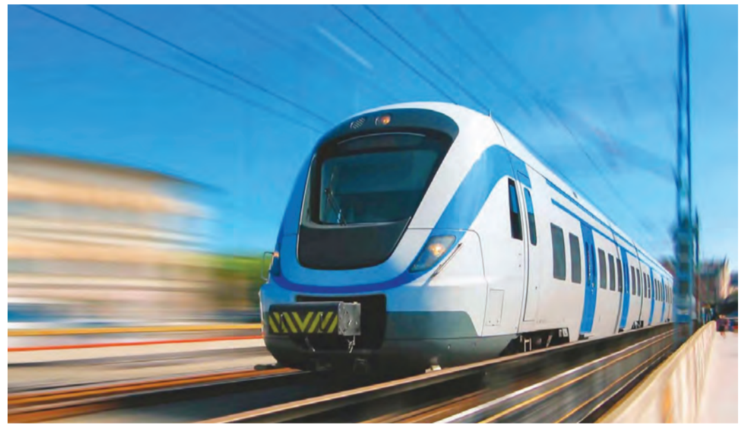
An artist's rendition of the railway

Design and implementation documents for the first phase in Qatar are finalized, and a consultancy agreement for Kuwait's section is expected in 2024.