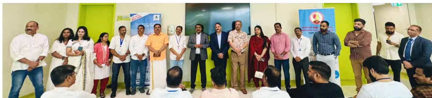
Officials of Kozhikode District Pravasi Forum (KPF Bahrain), Al Hilal Hospital and Medical Center's Manama Central Branch, along with notable guests

The Mega Medical Camp was inaugurated by Bahrain Ker-