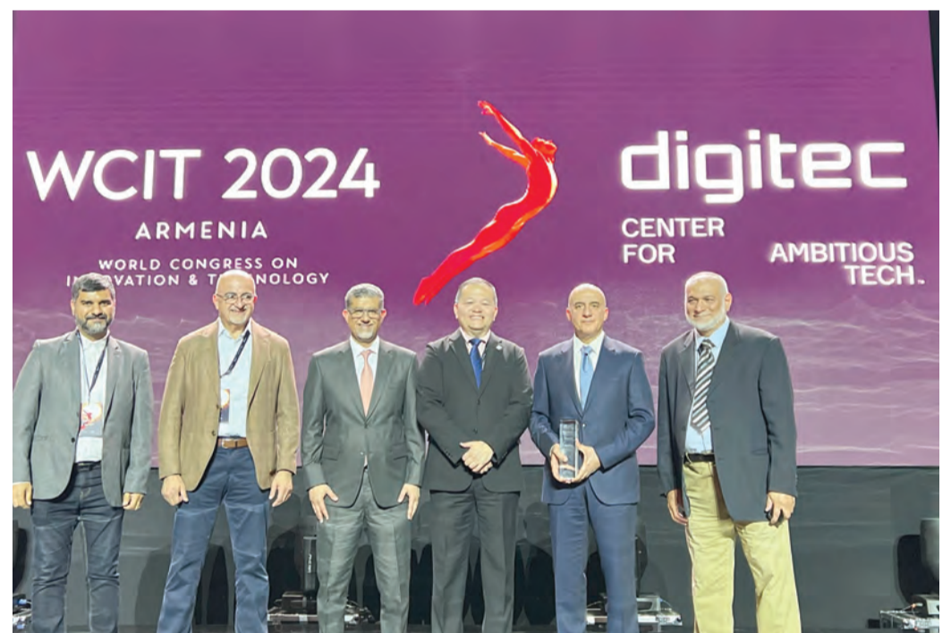
The award ceremony

● BENEFIT has been honoured with the Chairman's Award, the highest honor within the awards programme