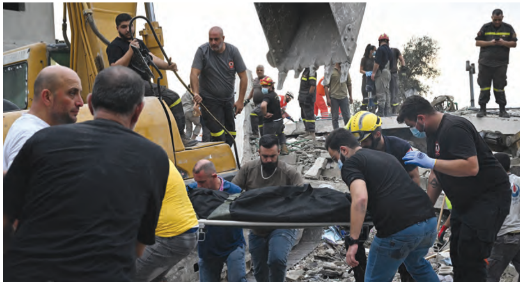
Lebanese civil defence workers transport a body after it was unearthed from under the rubble at the site of an Israeli airstrike on the Mount Lebanon village of Maaysra, east of the coastal town of Byblos.

avoid contact with Hezbollah members and not to cooperate