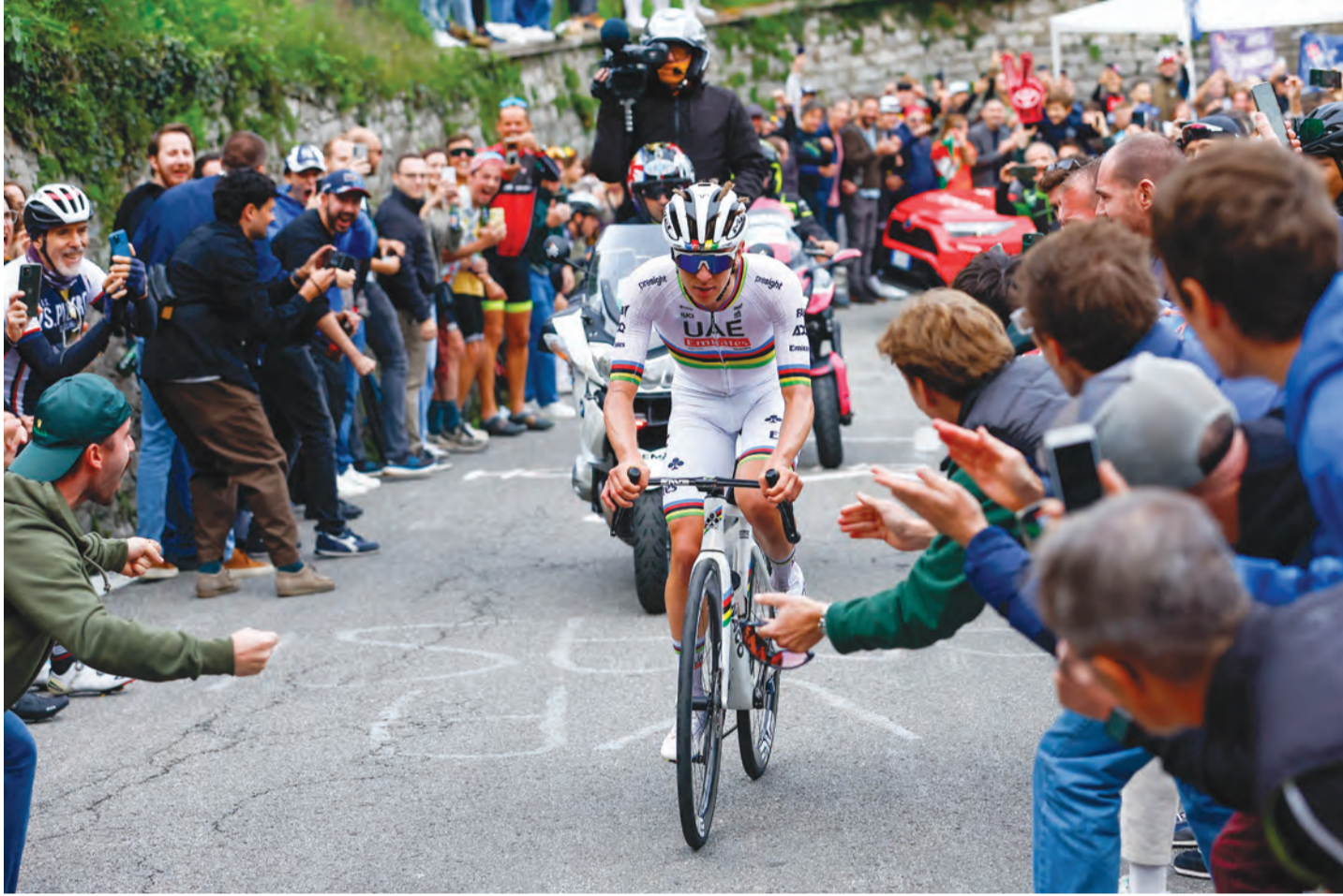
UAE Team Emirates team's Slovenian rider Tadej Pogacar cycles in a lone breakaway in the final ascent of San Fermo Della Battaglia during the 118th edition of the Giro di Lombardia (Tour of Lombardy), a 252km cycling race from Bergamo to Como

Pogacar made his move on the decisive Colma di Sorma-