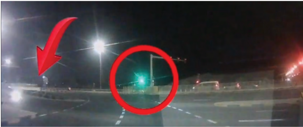
Dash cam footage shows a vehicle coming into the path of another vehicle that is traveling forward at Durrat Al Muharraq upon getting a green signal

Urgent call for traffic cameras as 'red light runners' threaten public safety in Durrat Al Muharraq