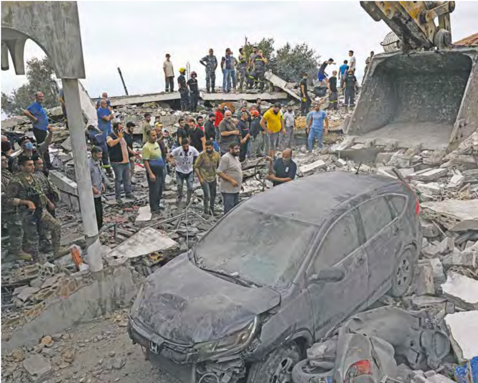
People inspect the damage at the site of an Israeli airstrike on the Mount Lebanon village of Maaysra, east of the coastal town of Byblos

Around Israel, markets were closed and public transport halted