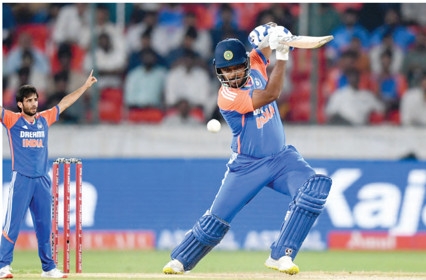
India's Sanju Samson plays a shot during the third and final Twenty20 international cricket match between India and Bangladesh at the Rajiv Gandhi International Stadium in Hyderabad

Najmul Hossain Shanto's Bangladesh, who came on the India tour at the back of a two-Test sweep in Pakistan, were