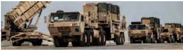
AFP | Washington, United States

The United States on Friday announced the approval of a $1.2 billion sale to the United Arab Emirates of precision munitions for multiple launch rocket systems.