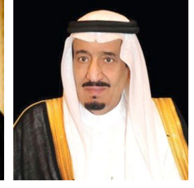
over the death of His Royal Highness Prince Yzeed bin Saud bin Abdulaziz Al Saud.

Bahrain offered sympathy to Saudi Arabia