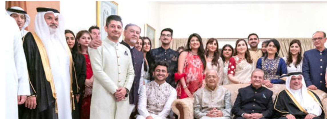
HRH the Crown Prince and Prime Minister visits families to mark the Diwali festival

He noted that the Kingdom's many other occasions, shows