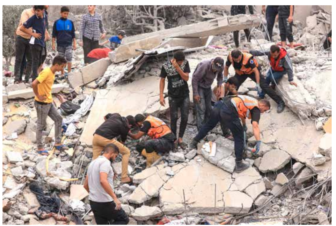
tal is caught in Israel's ground Civilians and rescuers look for survivors amid the rubble of a destroyed building following an Israeli bombardment in Khan

In Gaza City, Al-Shifa hospioffensive aimed at destroying Yunis in the southern Gaza Strip yesterday. Hamas, and the compound has been repeatedly hit by strikes, ward yesterday.