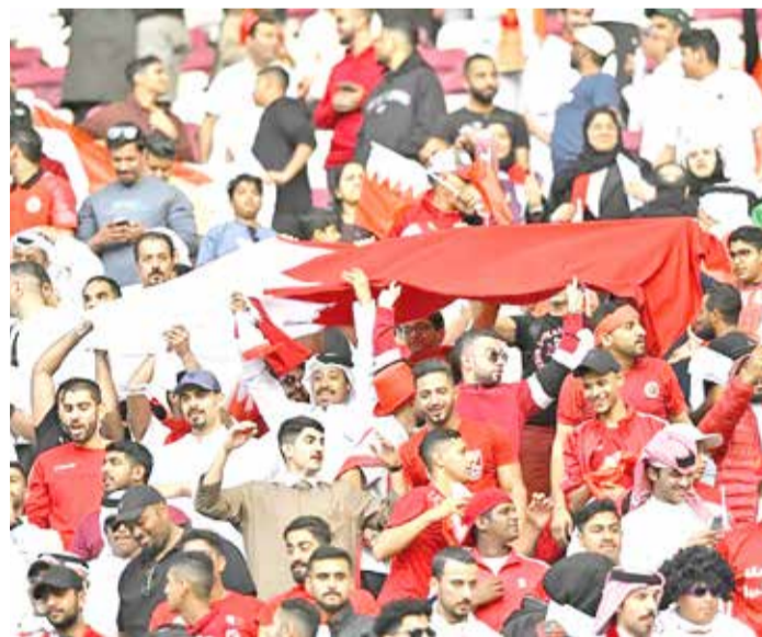
Fans celebrate during a match (file photo)

This initiative seeks to build a collective spirit among fans, allowing them to share their enthusiasm and support for the Kingdom's athletes and clubs, no matter the sport. With this unified effort, the goal is to foster national pride and create an