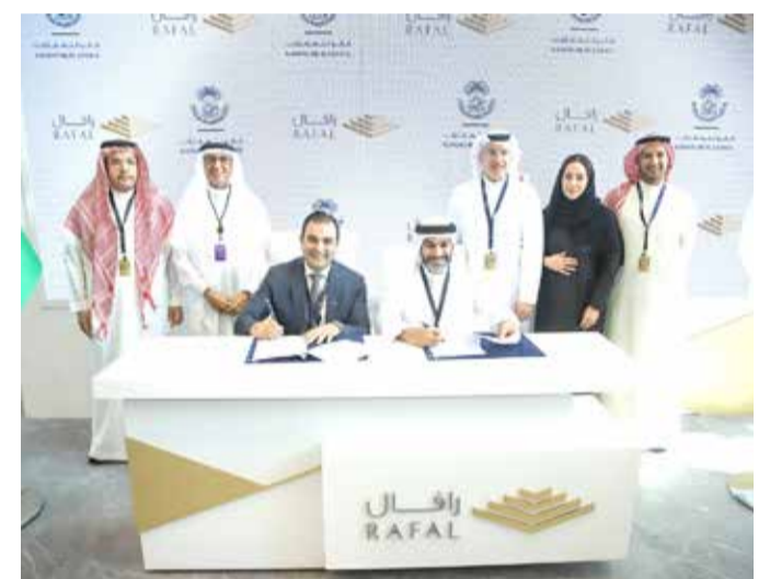
The deal signing