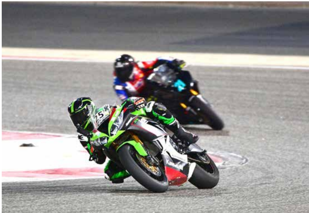
Action from Bahrain Motorcycle Championship

Seven rounds of National Race Day are scheduled to take place this 2024/2025 season, to be held all the way through to May.