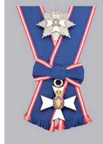
Knight Grand Cross of the Royal Victorian Order

The Knight Grand Cross of the Royal Victorian Order is a prestigious honor recognizing extraordinary personal service to the British monarchy.