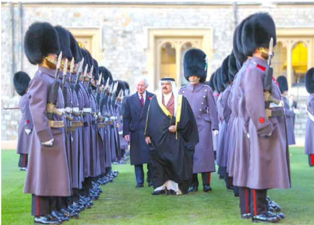
HM King receives a grand welcome from the UK Royal Guards

HM the King expressed confidence in King Charles, sharing that Bahrain has always felt assured of the UK's support,