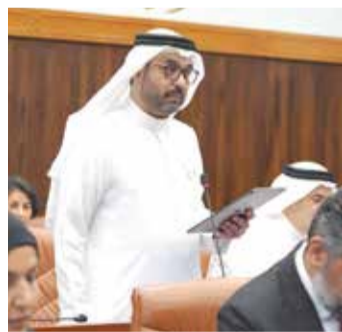
MP Ahmed Al Salloom

This adjustment aims to give consistent aid increases to Bahrain's most vulnerable, reflecting inflation pressures without needing frequent government