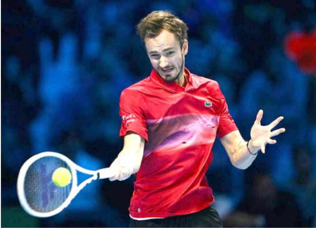
Russia's Daniil Medvedev hits a return to Australia's Alex De Minaur

Australian De Minaur will be knocked out with a match to spare if the other tie in the Ilie Nastase Group between Jannik Sinner and Fritz goes to three