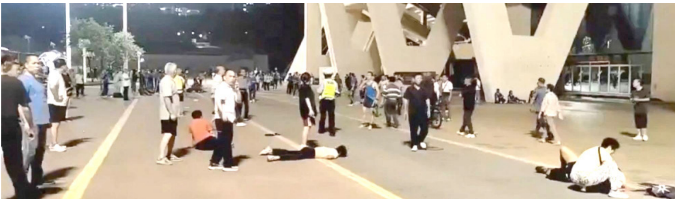
Wounded people lie on the ground after a suspected hit-and-run attack outside a sports center, in Zhuhai, China, on Monday, in this still image taken from a social media video.

Driver has killed 35 people and wounded 43 others in southern China, police said yesterday, a day after the car ploughed down people exercising in a sports centre in the city of Zhuhai.