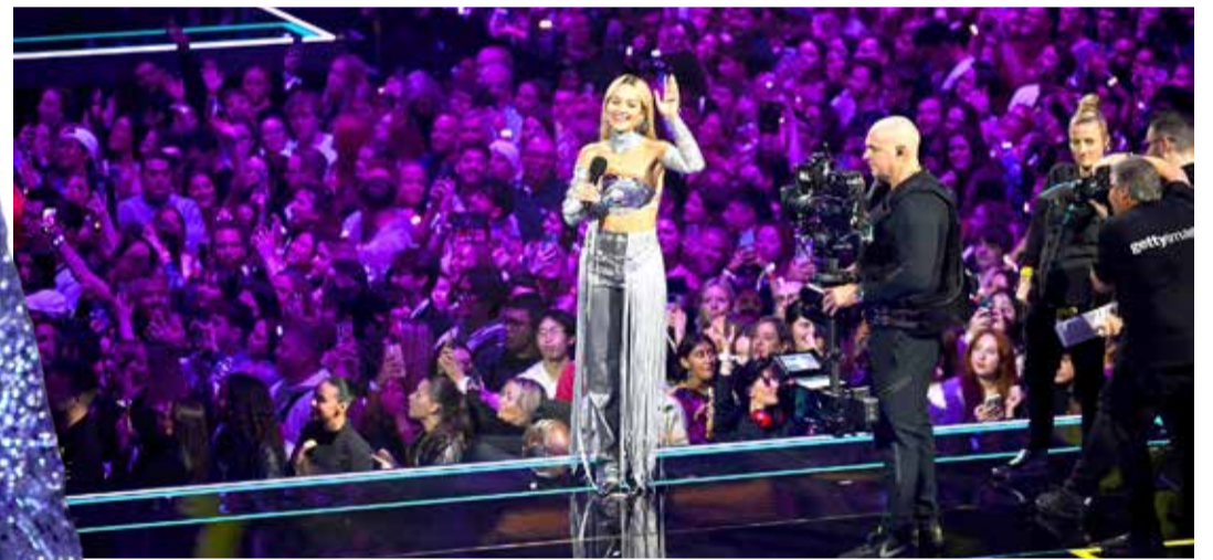
Rita Ora hosts the awards show