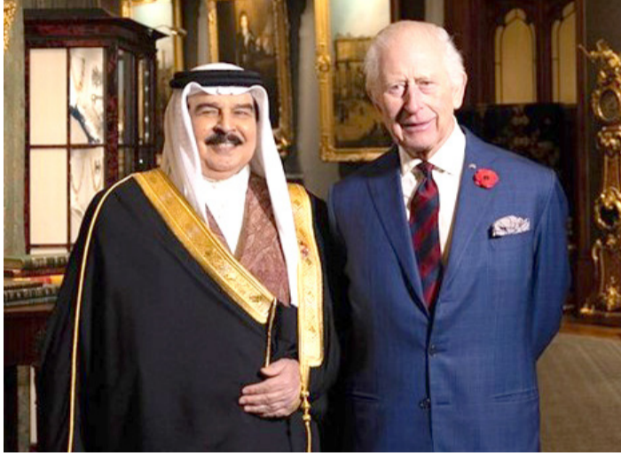
HM King Hamad with HM King Charles III

HM the King expressed his gratitude and appreciation to HM King Charles III, wishing him continued health and hap-