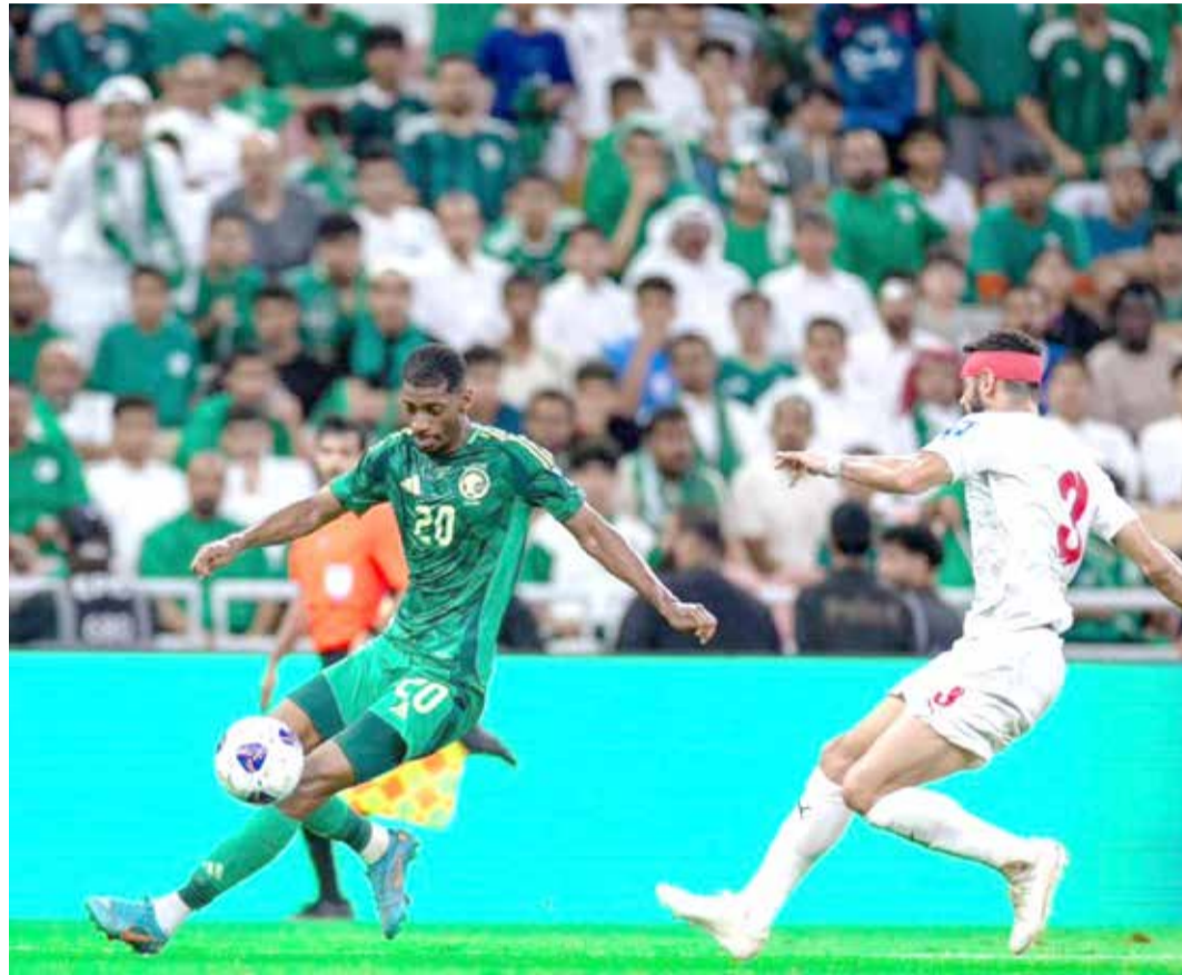
Bahrain's spirited draw against Saudi Arabia in October

As Bahrain prepares to host China in a high-stakes World Cup qualifying match, the stage is set for an electrifying encounter at the Bahrain National Stadium in Riffa tomorrow at 5PM.