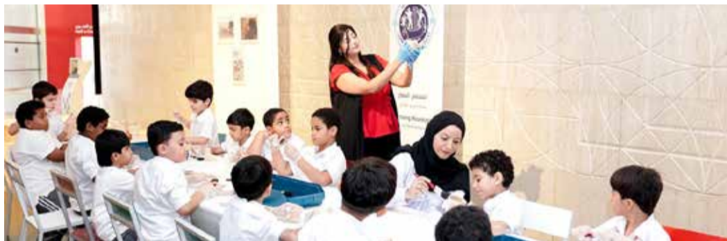
An engaging activity that sparks joy and fosters learning for kids

Targeting children and youth aged 8 to 16, the Bahrain National Museum, in collaboration with the Bahrain Authority for Culture and Antiquities, has lined up activities led by specialists in education, health, and