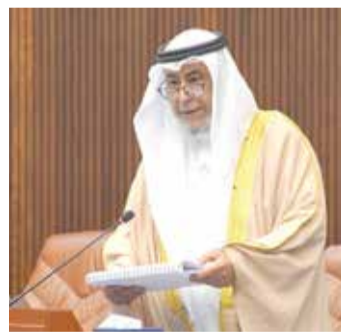
H.E. Ghanim Al Buainain