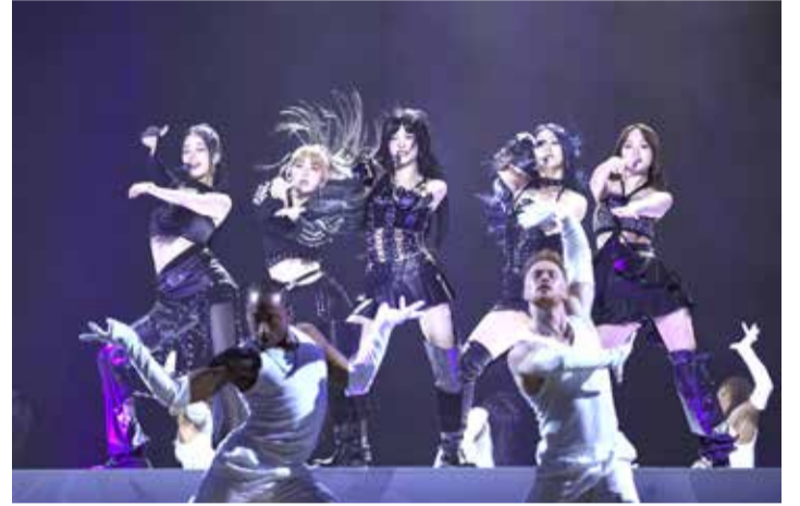
South Korean band Le Sserafim took home the push performance award