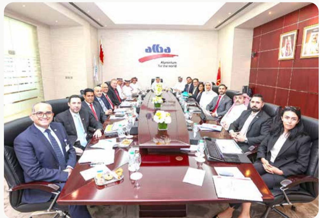
Alba officials during a group photo opportunity following a meeting