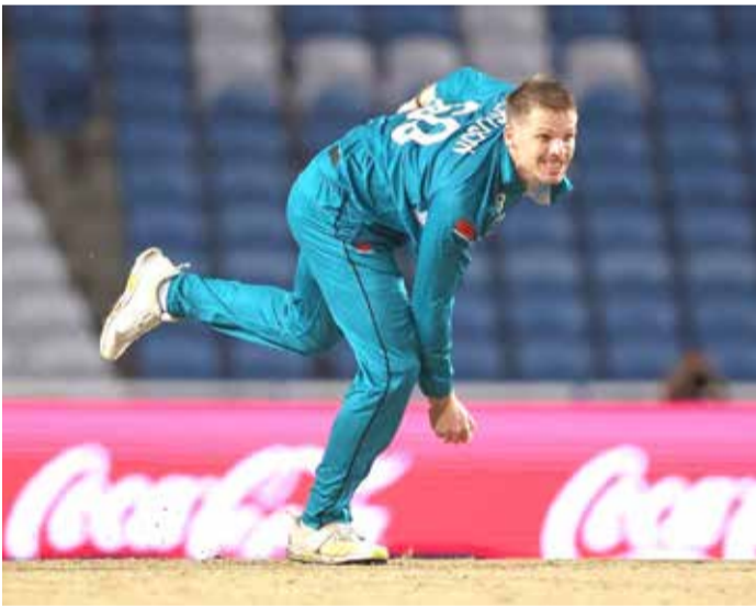
New Zealand's Lockie Ferguson in action

"He showed in the space of just two overs what an asset