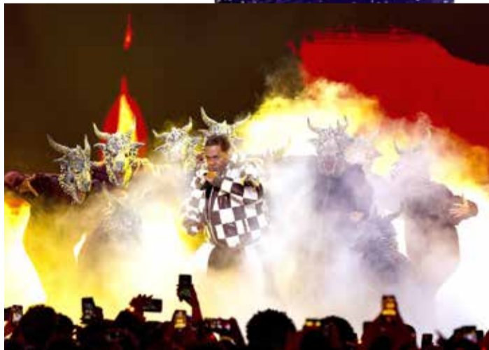
Busta Rhymes performs during the event