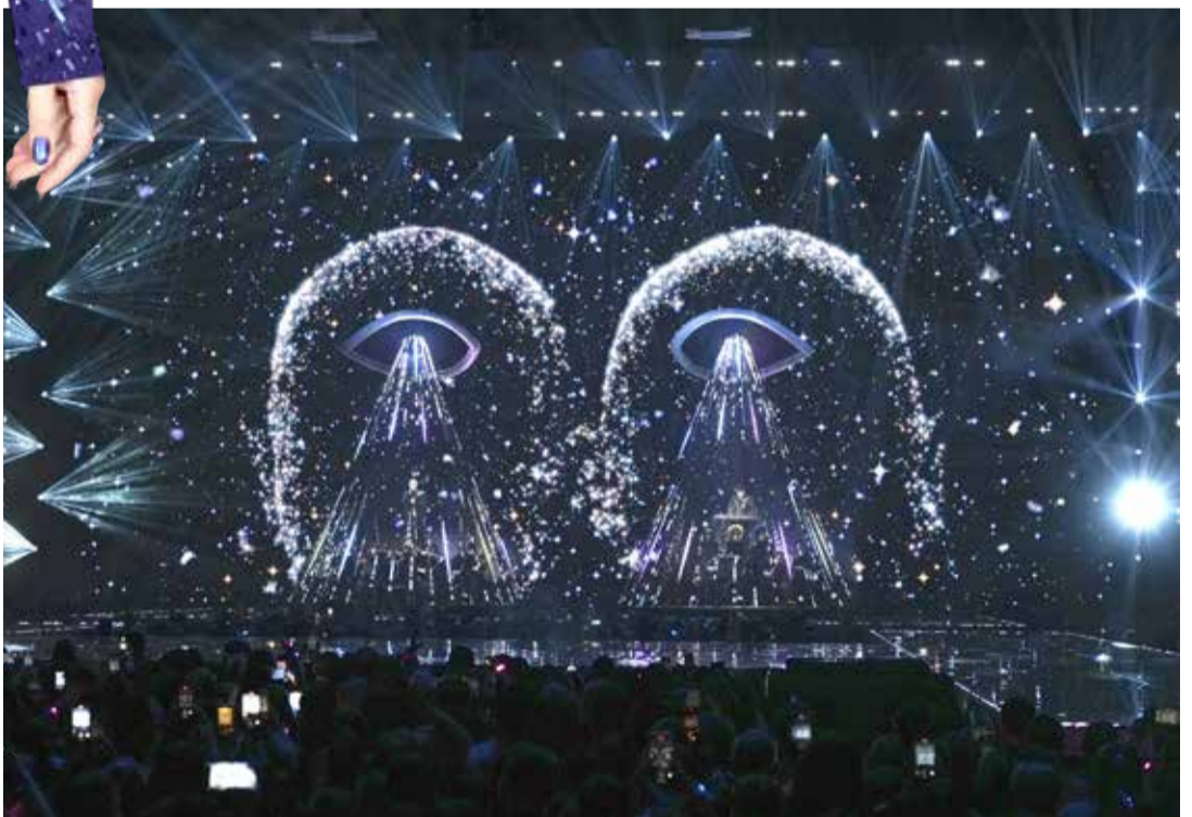
Neil Tennant and Chris Lowe of Pet Shop Boys perform alongside a local orchestra, the Manchester Camerata