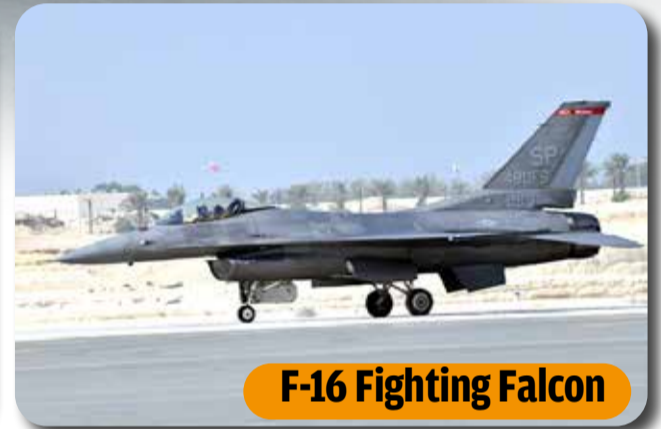
F-16 Fighting Falcon