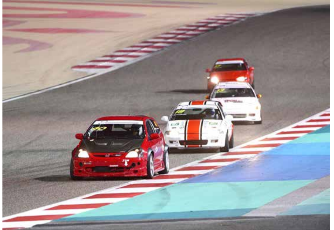
Action from Bahrain Touring Car Challenge