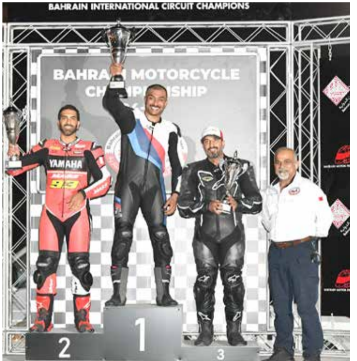
Winners of Bahrain Motorcycle Championship celebrate on the podium