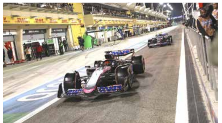
Alpine's French drivers Esteban Ocon (front) and Pierre Gasly drive through the pit lane during the qualifying session of the Bahrain Formula One Grand Prix

As a result the team leapt from ninth to sixth in the constructors' standings.