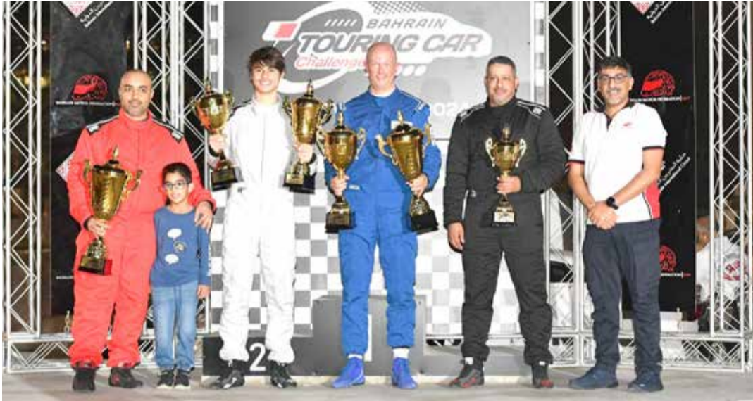
Winners of Bahrain Touring Car Challenge celebrate on the podium

Thrilling night racing action unfolds at Bahrain International Circuit