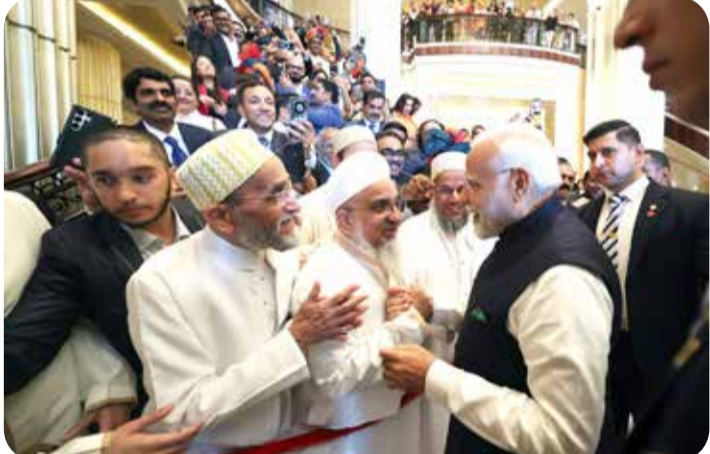
Modi (2R) speaking with people of Indian origin residing in the United Arab Emirates during a gathering at a hotel in Abu Dhabi

They signed several deals, including a bilateral investment treaty, building on a Comprehensive Economic Partnership Agreement signed in 2022, In-