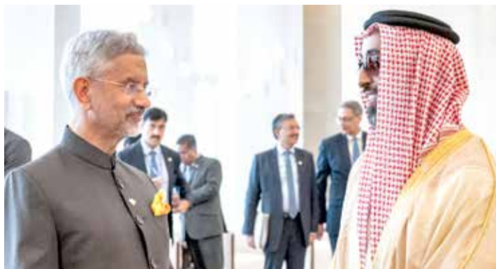
Foreign Minister Subrahmanyam Jaishankar (L) speaking with Sheikh Tahnoon bin Zayed al-Nahyan, Deputy Ruler of Abu Dhabi and UAE National Security Advisor

"The BAPS Temple is a celebration of UAE-India friendship, deep-rooted cultural bonds and an embodiment of the UAE's global commitment to harmony, tolerance and peaceful coexistence," India's foreign ministry said.