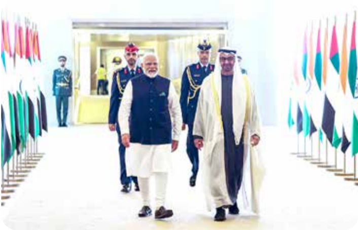
Modi (front L) walks next to the President of the United Arab Emirates Sheikh Mohammed bin Zayed Al Nahyan during a ceremonial welcome