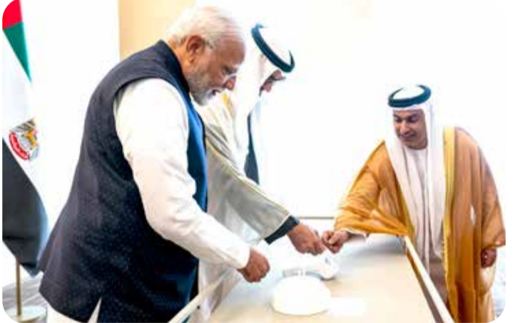
Modi (L) during the launch of the RuPay/JAYWAN digital debit card at a reception at the Presidential Airport in Abu Dhabi

But the highlight of his visit will be the inauguration of the Bochasanwasi Akshar Purushottam Swam-