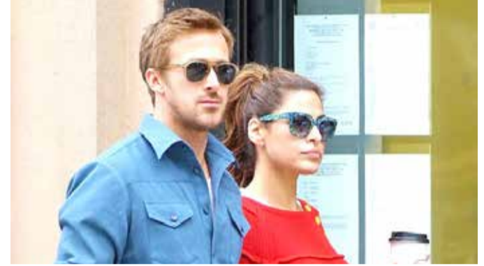
Ryan Gosling and Eva Mendes