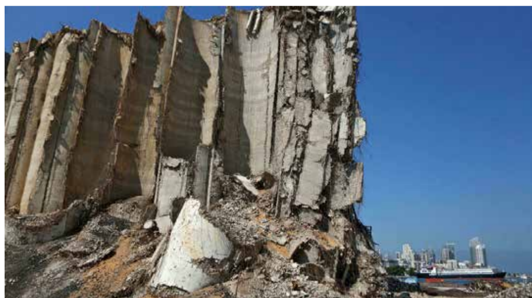
Damaged grain silos at the port of the Lebanese capital Beirut, almost a year after the August 4 massive explosion that killed more than 200 people