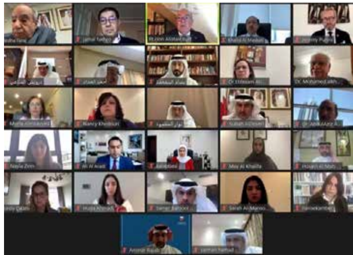
The online discussion in progress

bers, Member of the UK House of Lords and Advisor to Global Partners Governance, Lord Jeremy Purvis of Tweed and diplomats from Bahrain's Foreign Affairs Ministry participated in the online forum, moderated by former Deputy Minister at the British Foreign and Commonwealth Office and former Member of the House of Commons, Alistair Burt.