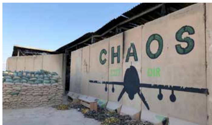
Blast walls of a sleeping quarters for US soldiers are seen at Ain al-Asad air base in Anbar province, Iraq