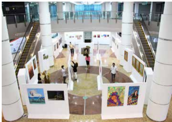
Ambassador Ver and the guests of honour view the artworks