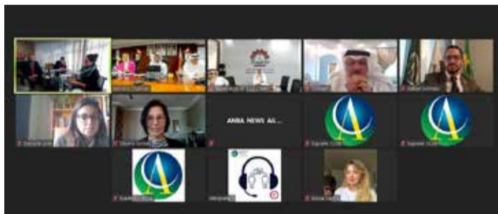
The online discussion in progress