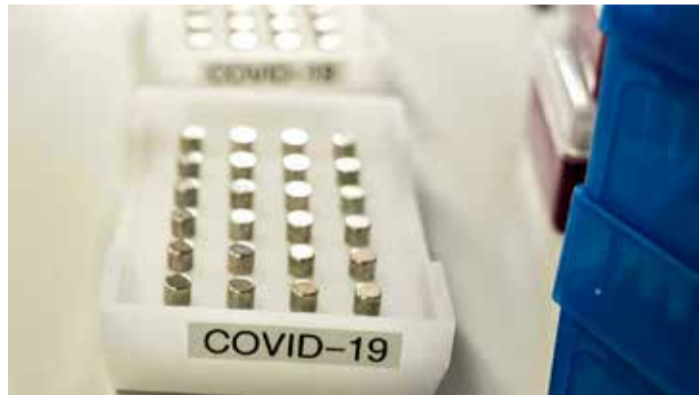
Researchers in Australia said the tool was effective against viral transmissions in lab tests, adding that they hope soon to begin animal trials on the method

CRISPR, which allows scientists to alter DNA sequences and modify gene function, has already shown promise in