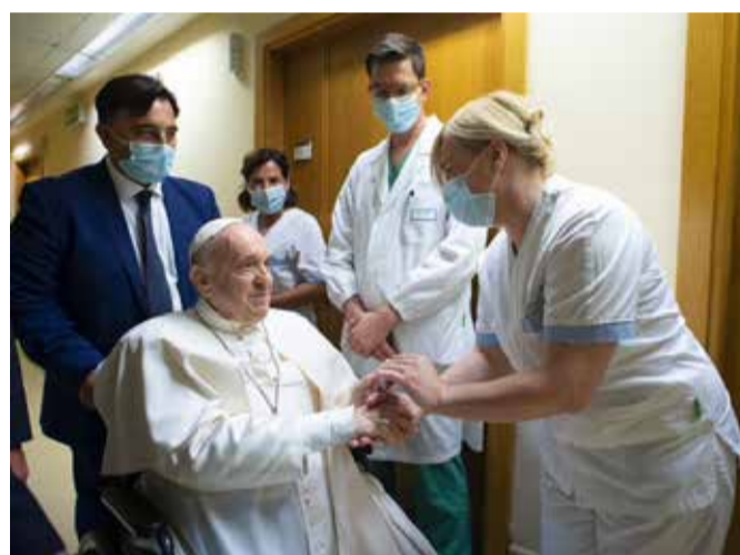
Pope Francis speaks with a health worker at the Gemelli hospital, as he recovers following scheduled surgery on his colon, in Rome, Italy