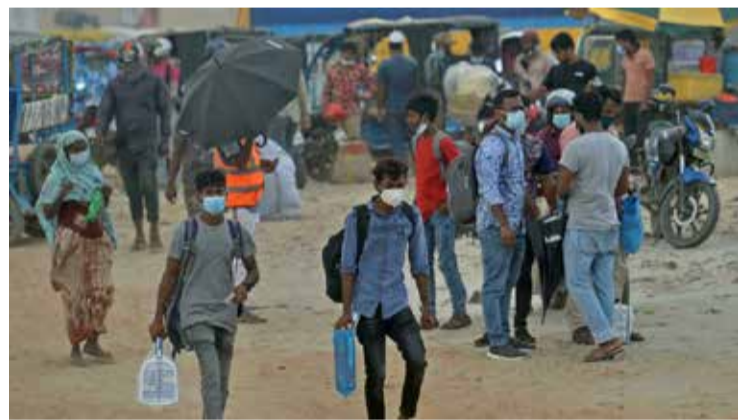
People in Sreenagar, Bangladesh walk to board a ferry to their hometowns

ally head back to their villages families. to mark Eid al-Adha with their Bangladesh imposed its strict-