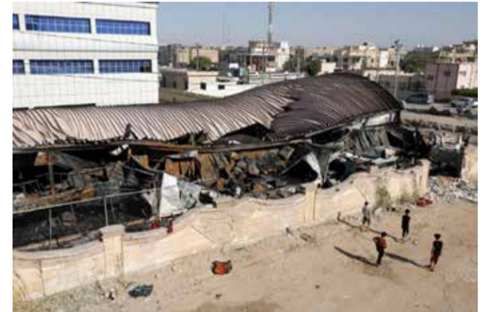
People walk past the damaged al-Hussain coronavirus hospital

● Death toll reaches 92, more than 100 injured