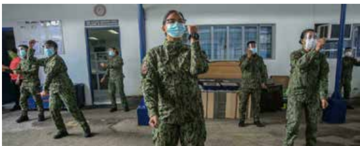
Rules introduced at the start of the pandemic made it compulsory for officers to work out daily and submit monthly body mass index readings

for the 220,000 members of the force to work out daily and submit monthly body mass index (BMI) readings.