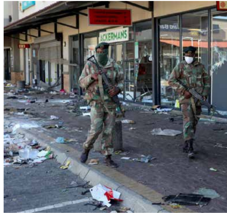
Members of the military patrol past looted shops as the country deploys army to quell President Jacob Zuma, in Soweto, South Africa