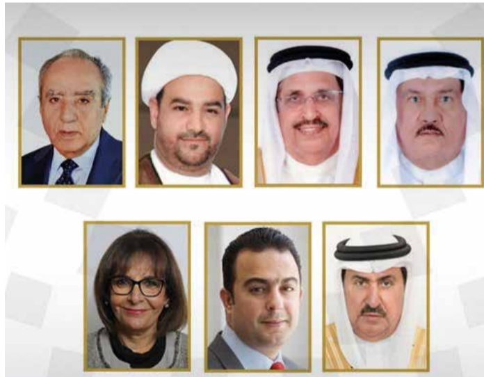
Shura Council's Human Rights Committee members

It also highlighted the progress made by the Bahrain government, represented by the Interior Ministry, to ensure care for detainees and convicts, as well as meet their needs and ensure their safety and rights within the reformation and rehabilitation institution.