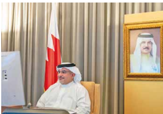
His Royal Highness Prince Salman bin Hamad Al Khalifa, the Crown Prince and Prime Minister, chaired the 390th Coordination Committee meeting, which was held remotely yesterday. HRH Prince Salman was briefed on the latest developments in travel procedures through Bahrain International Airport. They also discussed the latest developments in dealing with the COVID-19 and related procedures.