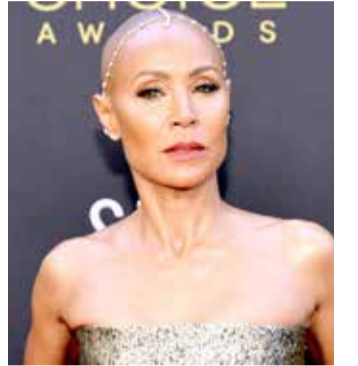
Jada Pinkett Smith

Asked if she was offended by the joke, she refused to