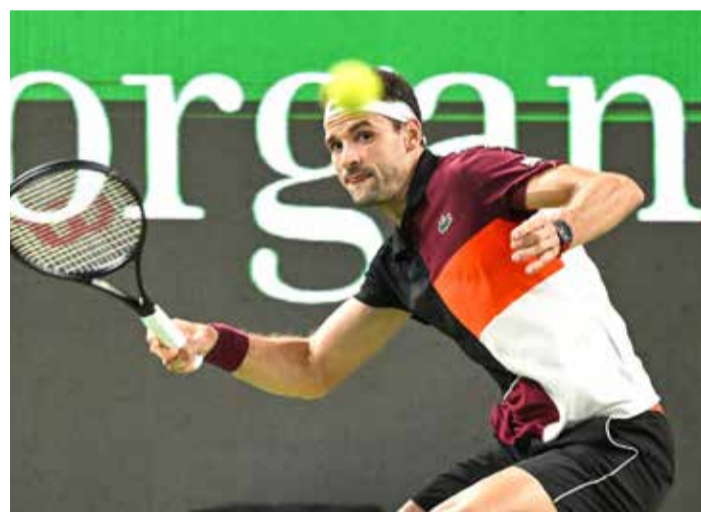
Bulgaria's Grigor Dimitrov hits a return against Chile's Nicolas Jarry

Grigor Dimitrov said he was playing some of the best tennis in his career as he marched into the Shanghai Masters semi-finals yesterday and a clash with Andrey Rublev. The 18th seed from Bulgaria did not face a single break point in defeating big-serving Nicolas Jarry of Chile 7-6 (7/2), 6-4 in their quarter-final. The 32-year-old Dimitrov, whose last ATP title was six years ago, faces Rublev in the last four after the Russian swept past France's Ugo Humbert 6-2, 6-3 in 90 minutes. Saturday's other semi-final is between Poland's 16th seed Hubert Hurkacz and 26th-seeded American Sebastian Korda. Dimitrov defeated top seed Carlos Alcaraz in the last 16 and the draw has opened up, with Rublev the only player in the world's top 10 still left. Asked if he was playing his best since 2017, when he won four titles including the season-ending ATP Finals, Dimitrov replied: "I think one of the best seasons, absolutely, no doubt about that." A philosophical Dimitrov has