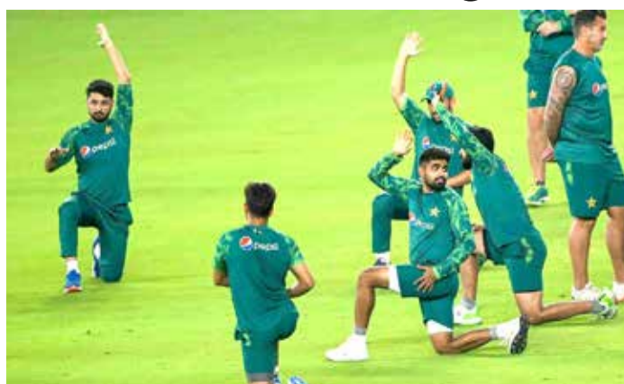
Pakistan's players attend a practice session

"We will try to play well and it all depends on how you play on the day, just like we did in