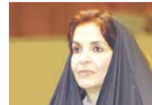
HRH Princess Sabeeka

Her Royal Highness Princess Sabeeka bint Ibrahim Al Khalifa, Wife of His Majesty the King and President of the Supreme Council for Women (SCW), sent a cable of congratulations to His Highness Shaikh Isa bin Salman bin Hamad Al Khalifa, Chairman of the Isa bin Salman Education Charitable Trust, on the issuance of the decree appointing him as chairman of the Labour Fund, Tamkeen.