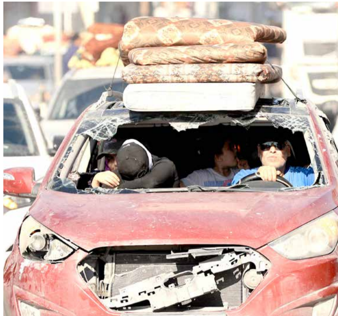
Riding in a damaged vehicle a Palestinian family flees with hundreds of other following the Israeli army’s warning to leave their homes and move south before an expected ground offensive, in Gaza City

In Gaza, United Nations officials said the Israeli military told them the evacuation should be