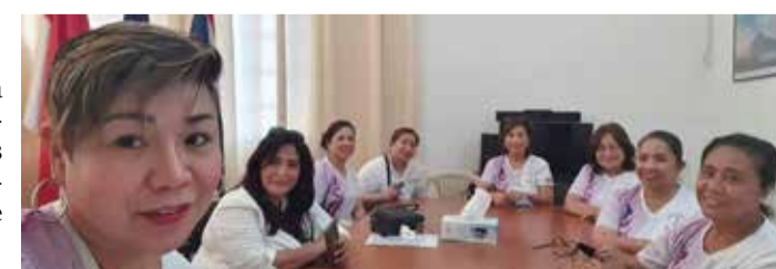
Pinay Ikaw Na officers hold a meeting to discuss the event

Pinay president: "Proceeds from this tournament will benefit charity groups selected by the organisation."