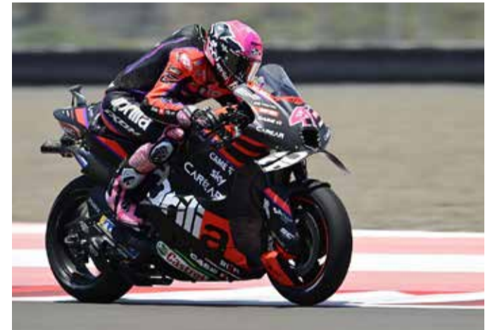
Aprilia Racing's Aleix Espargaro (L) rides his bike