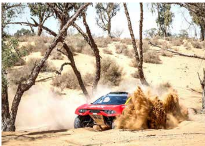
Sebastien Loeb in his Bahrain Raid Xtreme Prodrive Hunter