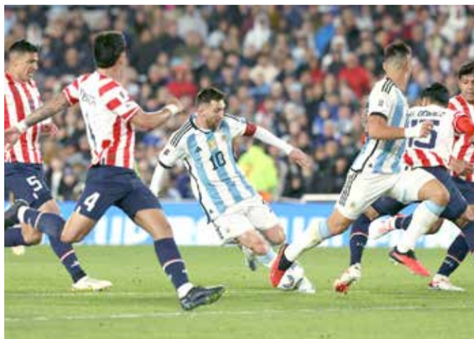
Argentina's forward Lionel Messi (C) controls the ball

qualifying, but they were left frustrated after Bello's brilliant late leveller. Brazil took the lead when Neymar had a shot pushed wide in the 49th minute and from the resulting corner, taken by the striker, Arsenal defender Gabriel rose at the near post to angle home a fine header. The goal forced Venezuela into a more adventurous approach and Wilker Angel flashed a header just wide from a 62nd-minute corner. Rodrygo then found himself in a great position in the box but the Real Madrid winger blasted his shot into the side netting. With five minutes left, the home crowd in Cuiaba were left stunned when Jefferson Savarino whipped in a cross and Bello leapt acrobatically to blast a spectacular overhead kick past Ederson. The result leaves Brazil in second place in the 10-team qualifying standings, two ahead of Colombia and two behind Argentina.