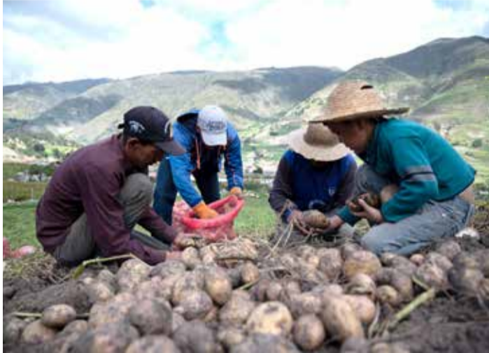
Farmers collect the crop of potatoes grown in Mucuchies, Merida state, Venezuela