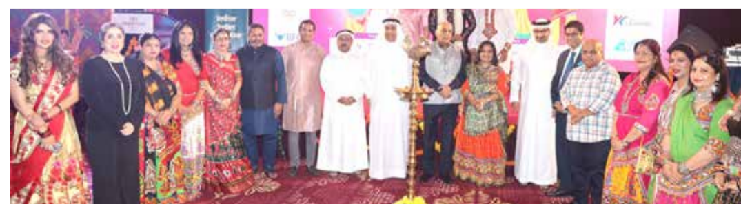
Special invitees to the event