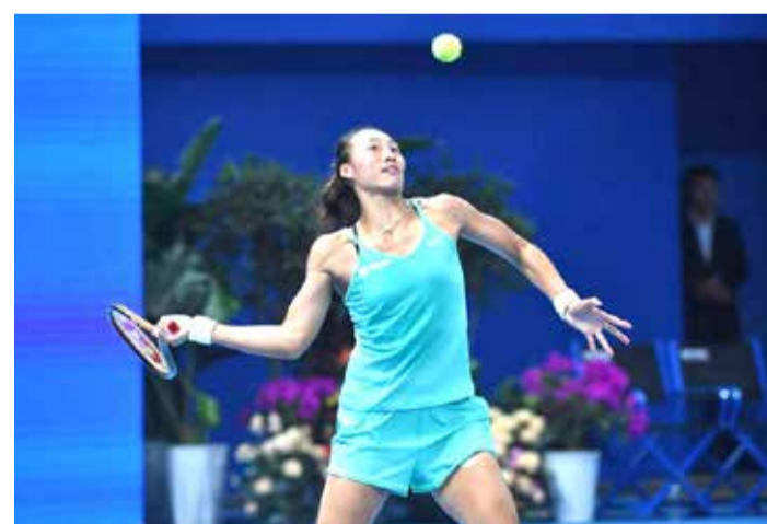
China's Zheng Qinwen hits a return to Ukraine's Anhelina Kalinina

Zheng Qinwen called it "a big step" after advancing to her third semi-final of the year with a 6-3, 6-2 win over Ukrainian Anhelina Kalinina at the Zhengzhou Open yesterday. The 21-year-old rising Chinese star is fresh off a statement summer during which she lifted a maiden WTA trophy and reached a first Grand Slam quarter-final at the US Open. Up next is a rematch with Jasmine Paolini, who lost to the world number 24 in the Palermo final in July. "It's been a long time I didn't arrive to the semi-finals at a WTA 500 tournament so this is a big step for me again," said Zheng, who won Asian Games gold this month. "It was a tough match against Paolini in Palermo, I think she's really difficult to beat. She's a good fighter." Facing Kalinina for the first time at tour level and third time overall, Zheng dropped just four points behind her first serve en route to grabbing the 41-minute