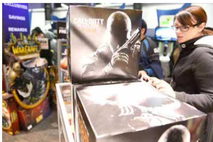
A gamer looks at the display for "Call of Duty: Black Ops II" as she waits for midnight to buy Activision's news release in the "Call of Duty" series, at a Game Stop store in Universal City, California

British regulators were the final obstacle to the deal, and they approved Microsoft's $69-billion