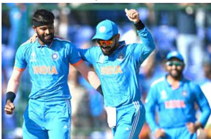
India's Hardik Pandya (L) celebrates with teammate Virat Kohli as their team captain Rohit Sharma watches

Rohit said the team has momentum after they won the Asia Cup in Sri Lanka and then beat Australia in a three-match se-