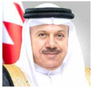
Dr. Al Zayani

Foreign Affairs Minister Dr. Abdullatif bin Rashid Al Zayani made phone calls with a number of foreign ministers to discuss developments in Gaza.