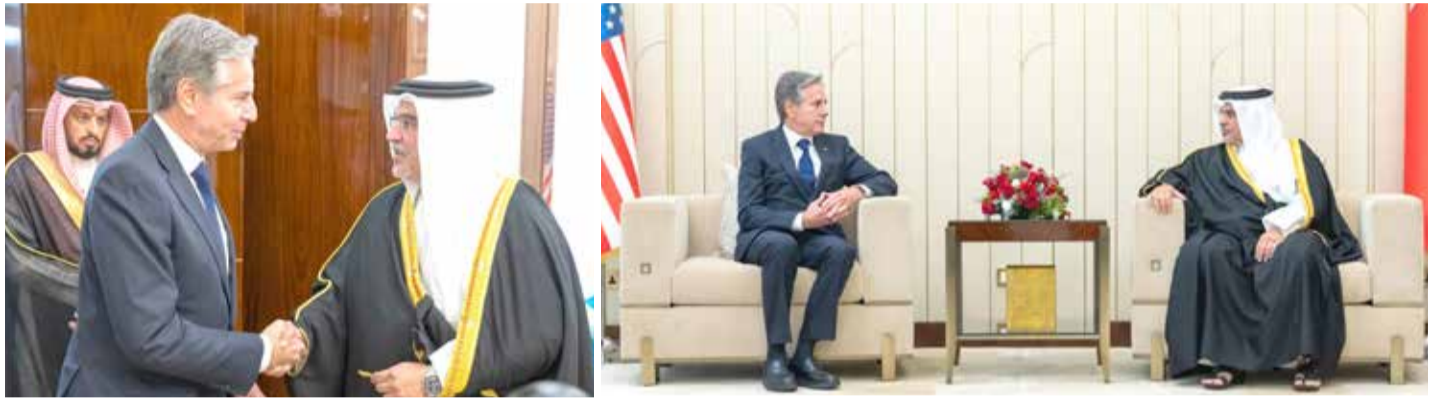
HRH Prince Salman holds talks with US Secretary of State Blinken

During the meeting, regional and global developments, including providing humanitarian relief, food, water, electricity, medical aid, and civilian protection in the Gaza Strip, were discussed.