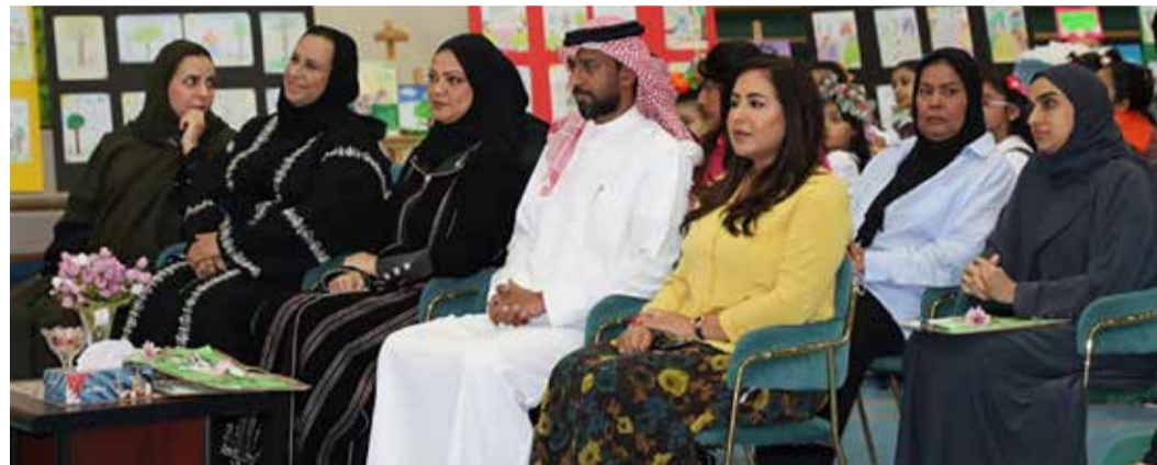
Participants at the eco-friendly event

The event aimed to promote environmental awareness, en-