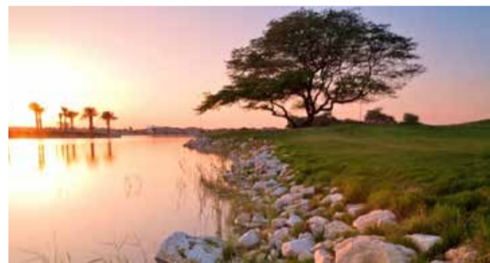
National efforts aim to achieve a greener future for the Kingdom. (Image used for illustrative purposes only)

This collaborative approach aims to achieve sustainable development goals and aligns with Bahrain's National Afforestation Plan, which aims to double the number of trees in the country. Bahrain's vision, led by His Royal Highness Prince Salman bin Hamad Al Khalifa, the Crown Prince and