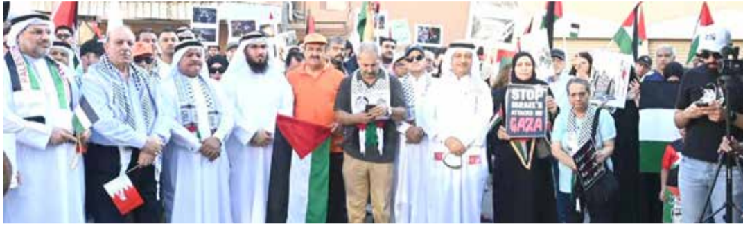
Bahrainis and expatriates show their unwavering support for the Palestinians in Gaza