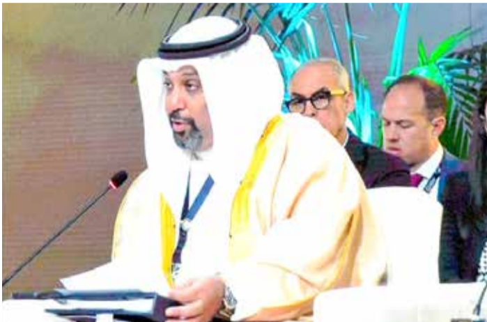
Shaikh Salman speaks at the event

The meeting took place during the annual gathering of the World Bank and the Interna-