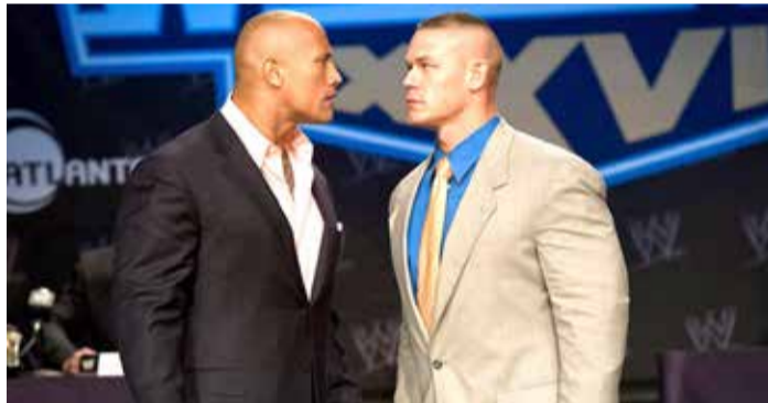
Dwayne Johnson and John Cena

"I violated his trust and I made allegations about his perspective that I knew nothing