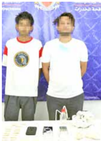
The two suspects with the drugs seized from them

rectorate of Criminal Investigation and Forensic Science urged all citizens and residents to report any complaints, observations, or suspicious messages related to drug trafficking and to seek assistance in drug control by contacting the 24-hour hotline at 996, ensuring the complete confidentiality of the information.