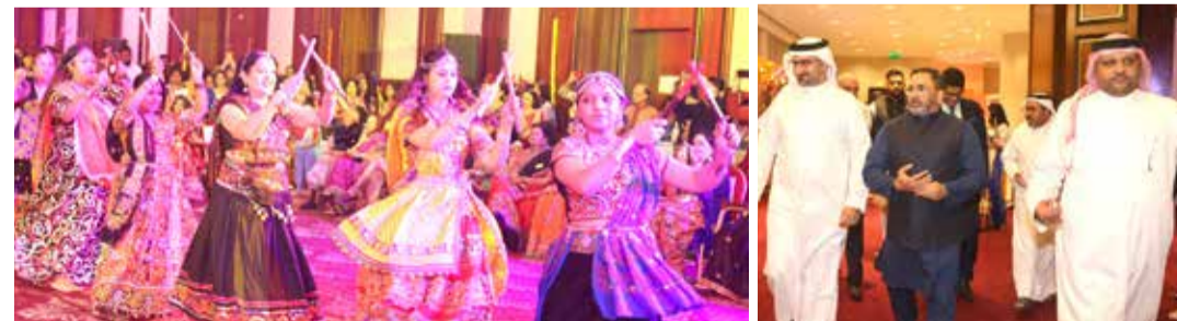
The popular Dandiya Utsav dance is the highlight of the night

The ILA's Dandiya Utsav is one of the most popular events in Bahrain and is a great opportunity for people from different cultures to come together and celebrate.