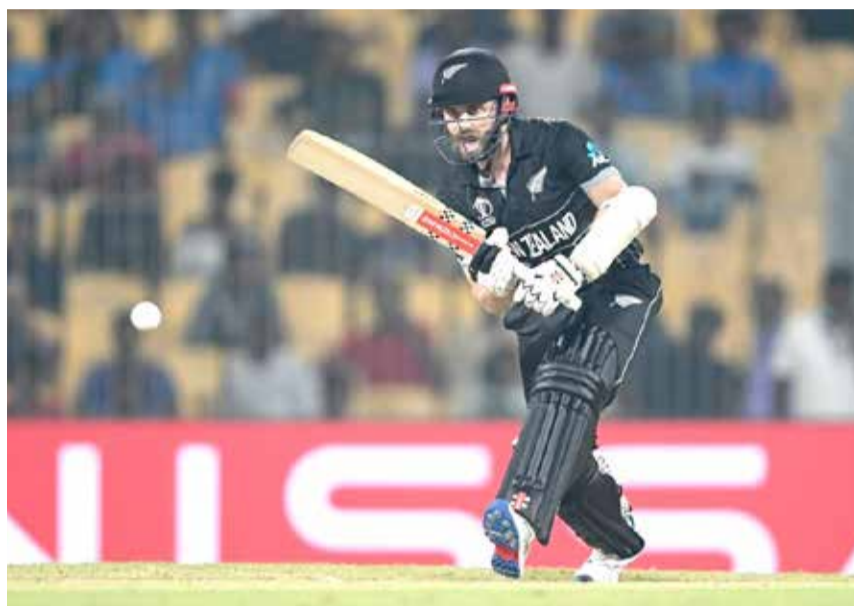
New Zealand's Kane Williamson plays a shot

New Zealand comfortably wrapped up their third win with 43 balls to spare. Williamson had put on a sec-