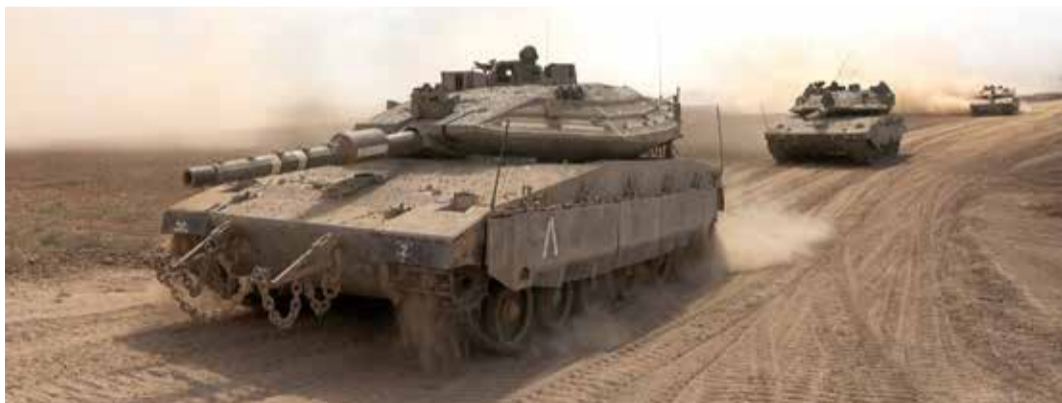
Israeli army battle tanks move along the border with the Gaza Strip in southern Israel yesterday.

amid massive bombardments, also asked over a million residents of northern Gaza to flee to the southern side of the Palestinian exclave, within 24 hours.