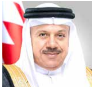
Dr. Al Zayani

Foreign Affairs Minister Dr. Abdullatif bin Rashid Al Zayani made phone calls with a number of foreign ministers to discuss developments in Gaza.