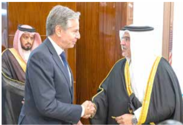
HRH Prince Salman holds talks with US Secretary of State Blinken

During the meeting, regional and global developments, including providing humanitarian relief, food, water, electricity, medical aid, and civilian protection in the Gaza Strip, were discussed.