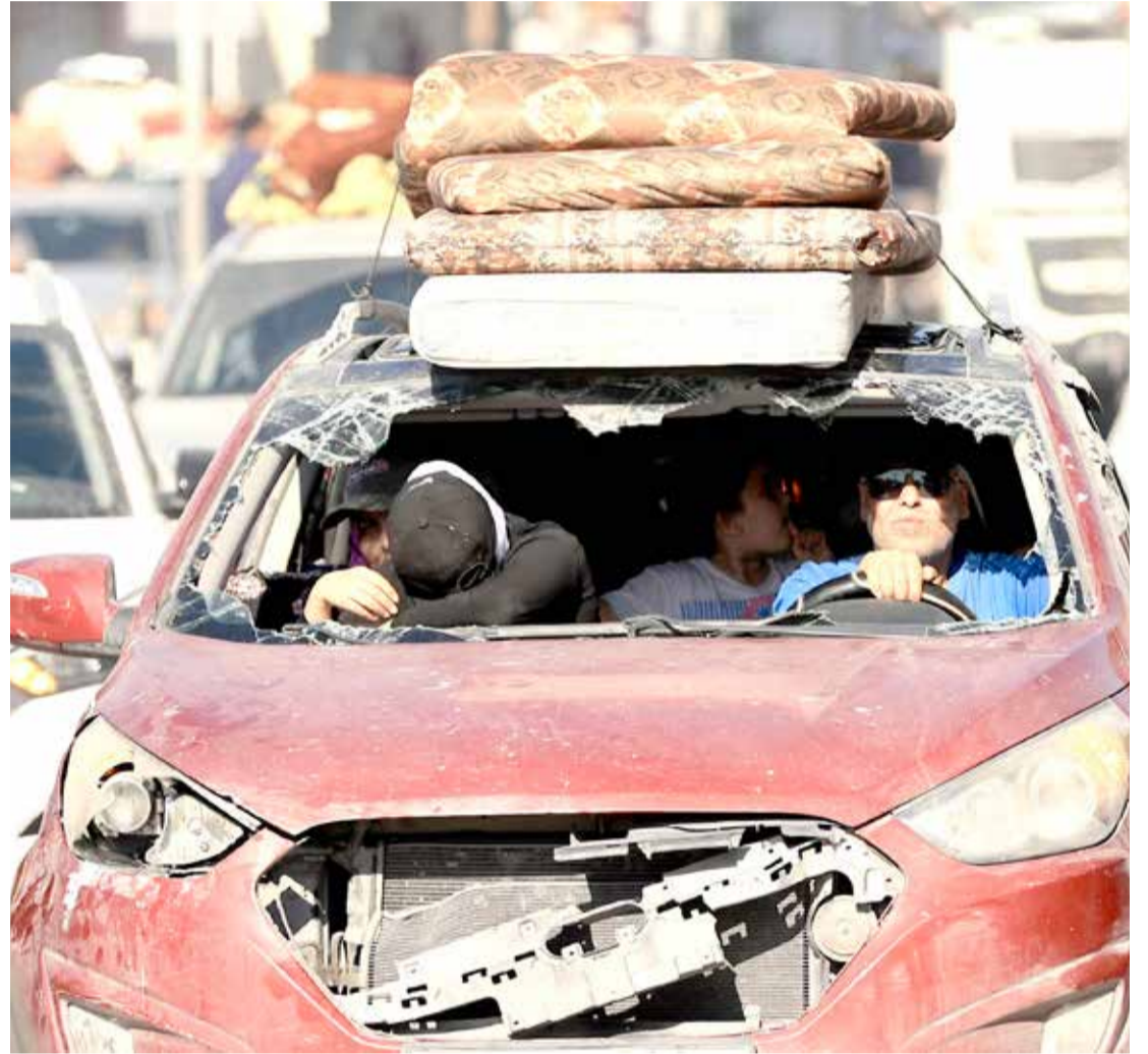
Riding in a damaged vehicle a Palestinian family flees with hundreds of other following the Israeli army's warning to leave their homes and move south before an expected ground offensive, in Gaza City

In Gaza, United Nations officials said the Israeli military told them the evacuation should be