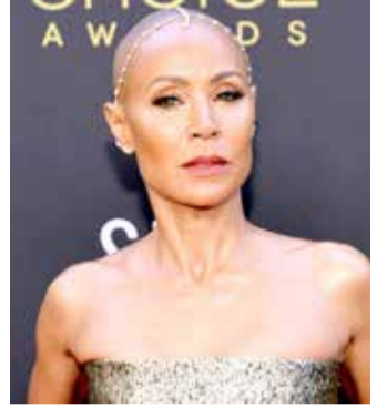
Jada Pinkett Smith

Asked if she was offended by the joke, she refused to