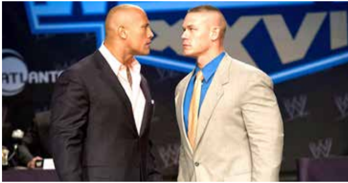
Dwayne Johnson and John Cena

"I violated his trust and I made allegations about his perspective that I knew nothing