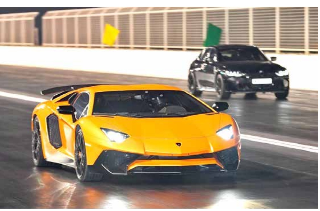
A car in action at BIC

are sure to satisfy one's need calling the BIC Hotline on +973for speed as BIC continues its 17450000. More information packed programme of engaging is also available through both channels.