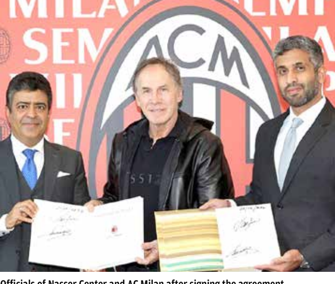
Officials of Nasser Center and AC Milan after signing the agreement

both institutions to create a ro-tunity: a high school program education.