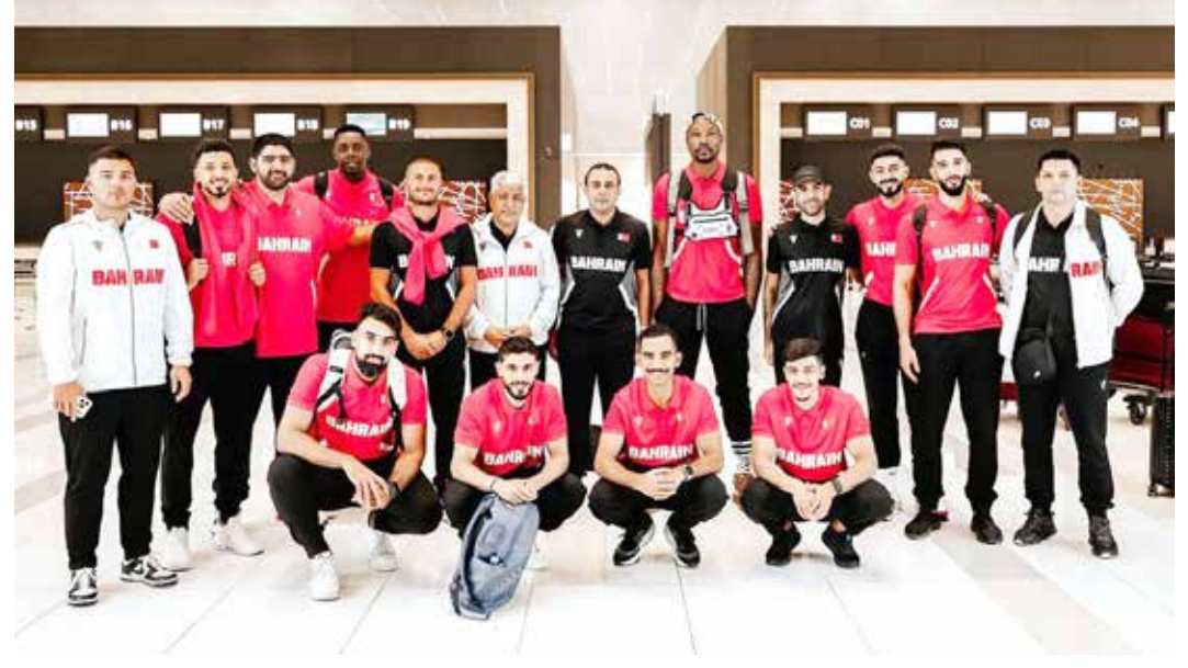
Bahrain's national basketball team ahead of their departure

A training camp in Tunisia might seem unconventional, but for Bahrain's coaching staff, it's a calculated move. Tunisia boasts Bahrain's 77-75 win over Qatar a strong basketball culture and in the Gulf Cup final was noth- high-caliber competition, cre-