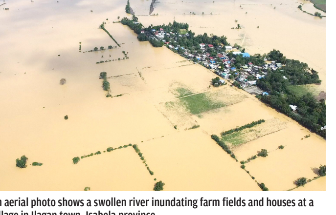
An aerial photo shows a swollen river inundating farm fields and houses at a village in Ilagan town, Isabela province

idents in vulnerable areas, by implement the forced evacua- "intense to torrential" rain on force if necessary, as the 120 tion, especially for susceptible Thursday and Friday, which can kilometres (75 miles) an hour areas," he told AFP, adding as trigger floods and landslides typhoon bears down on the many as 40,000 people in the with the ground still sodden province lived in hazard-prone from recent downpours, state