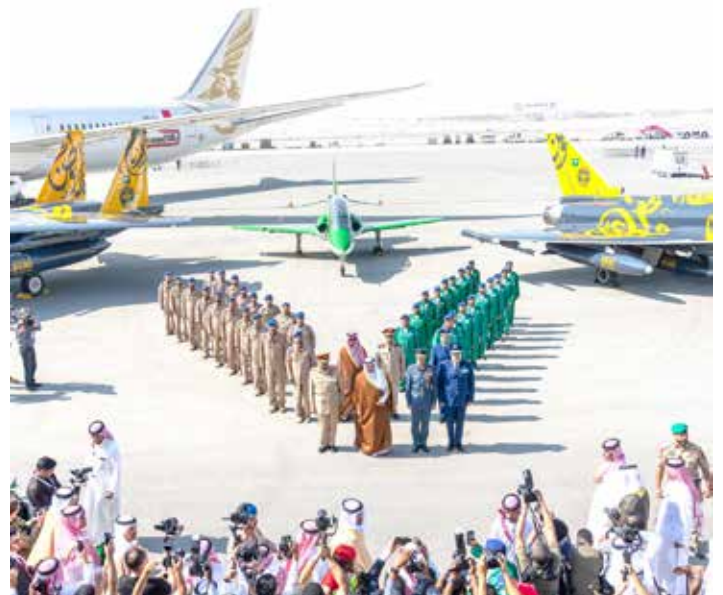
the dedicated Bahraini work-

The Bahrain International Air- ing cutting-edge technology. show, now in its seventh edition, has established a reputation for role in elevating the event was