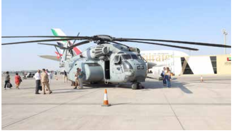
From the F-15SA and F-16 Fighting Falcon to the JF-17 Thunder, Mirage 2000-9, Boeing 787-9 Dreamliner, Dhruv helicopters, and the A380 superjumbo, Bahrain's skies were a symphony of aviation excellence at the Bahrain International Airshow 2024 that began on Wednesday. The airshow will continue until Friday.