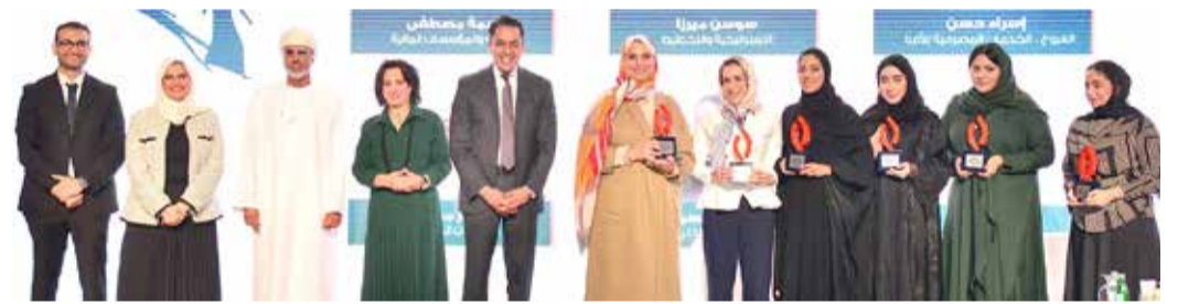
Her Excellency Shaikha Mai bint Mohammed Al Khalifa with Al Salam Bank officials and dignitaries

Al Salam Bank celebrated the conclusion of the 'Qaedat Al Salam' Women Leadership program in a special ceremony held on Monday at the Four Seasons Hotel Bahrain Bay.