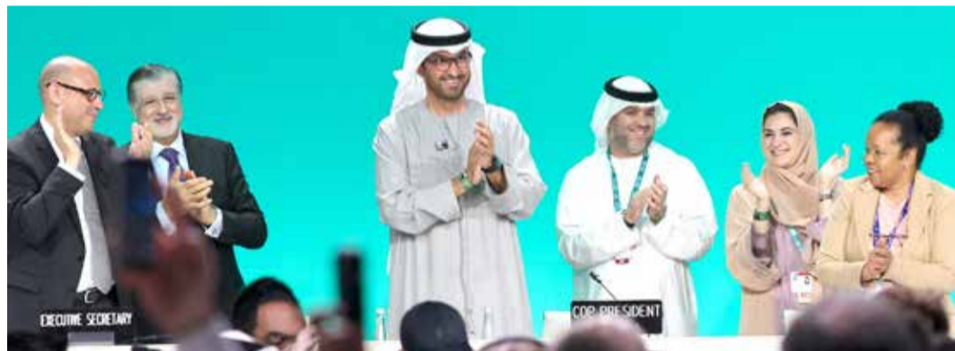
COP28 president Sultan Ahmed Al Jaber, centre, applauds among other officials before a plenary session in Dubai.

Describing the deal as bringing "transformational change", Jaber said: "We have helped restore faith and trust in multilat-