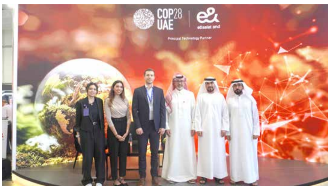
Representatives from Beyon, e& and du at COP28

The Hub will foster a collaborative environment where tele-