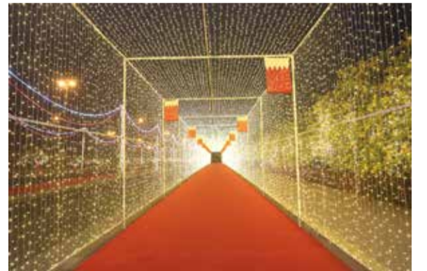
The Southern Municipality decorated a number of major landmarks and public streets on the occasion of the national holidays.