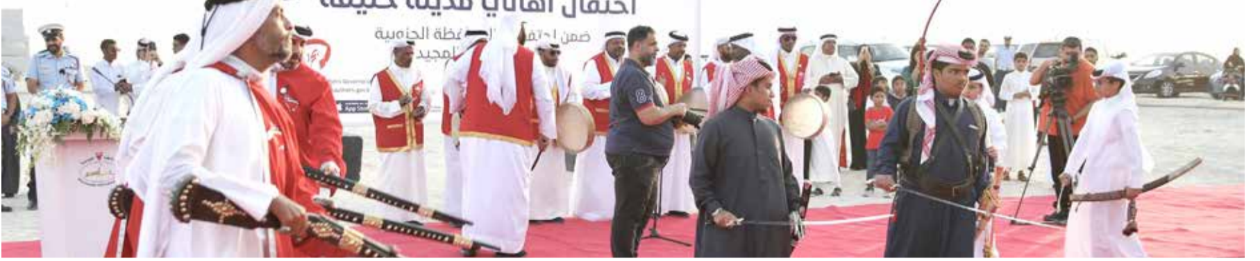
Young and old share the joy of the occasion