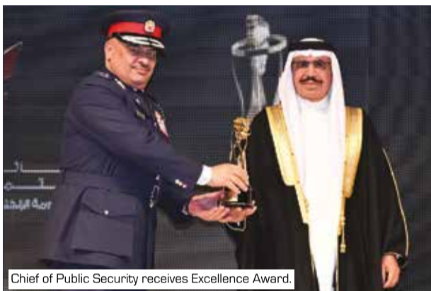
Chief of Public Security receives Excellence Award.

The General Directorate of Media and Security Culture worked throughout 2023 to reinforce performance and provide professional media content, releasing 1,168 press releases in Arabic and translating them into English. It produced 418 videos, 683 radio productions, and many publications. Meanwhile, the followers of the Interior Ministry account on the "X" social media platform reached 492,000.