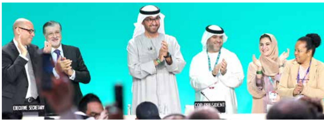
COP28 president Sultan Ahmed Al Jaber (C) applauds among other officials before a plenary session during the United Nations climate summit in Dubai

"Oil demand is expected to be supported by resilient global GDP growth, amid continued improvements in economic ac-