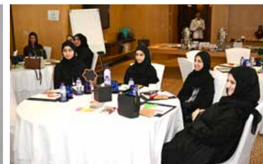
Participants at the Women's Day celebration