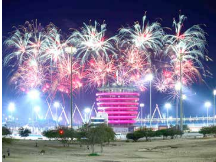
Fireworks at BIC in previous years (File photo)

● BIC set for Kingdom's huge National Day fireworks display Saturday night starting at 7pm