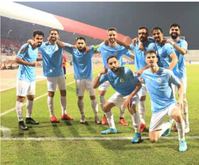
Riffa players celebrate a win this season

The other pairing in this stage pits Al Kahrabaa of Iraq against