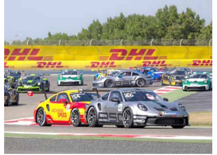
Action from the opening round of the Porsche Carrera Cup Middle East at BIC last month

Formerly known as the Porsche Sprint Challenge Middle East, the PCCME pits its roster of global competitors against one another in identical 510hp Porsche 992 GT3 Cup cars. Races are held at top tracks across the Gulf, highlighted by BIC in Sakhir and including Dubai Autodrome and Yas Marina Circuit in the UAE, as