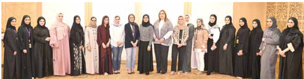
Participants during a group photo opportunity