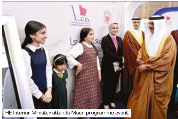
HE Interior Minister attends Maan programme event.

participating in the tournament in 2009. Bahrain also won the Best Team Leader Award 2023 in the Royal Military Academy "Sandhurst" event.