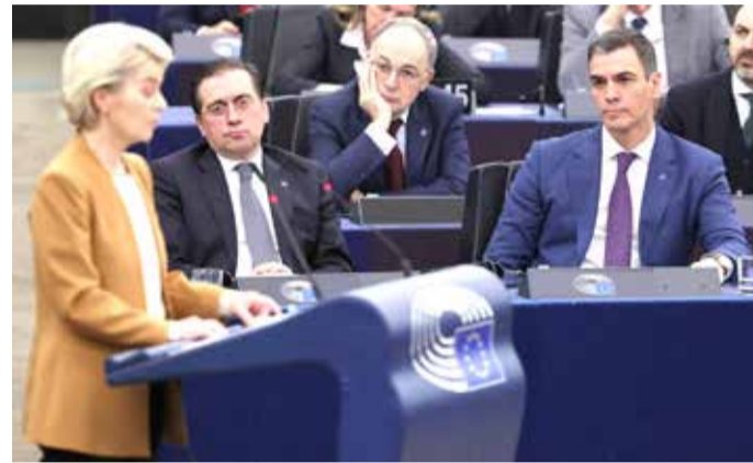
Spain's Prime minister Pedro Sanchez (R) listens to European Commission President Ursula von der Leyen

The EU has failed to have a united stance on the violence roiling the Middle East since