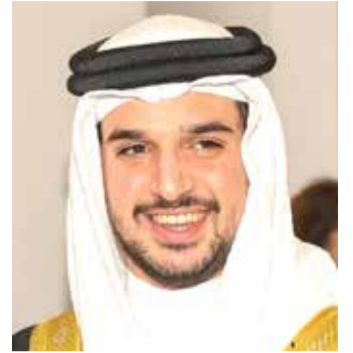
HH Shaikh Isa bin Abdulla Al Khalifa