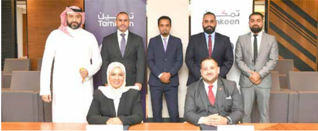
The deal signing

As part of the support provided, more than 30% of Aramex Bahrain employees will benefit from the recently launched