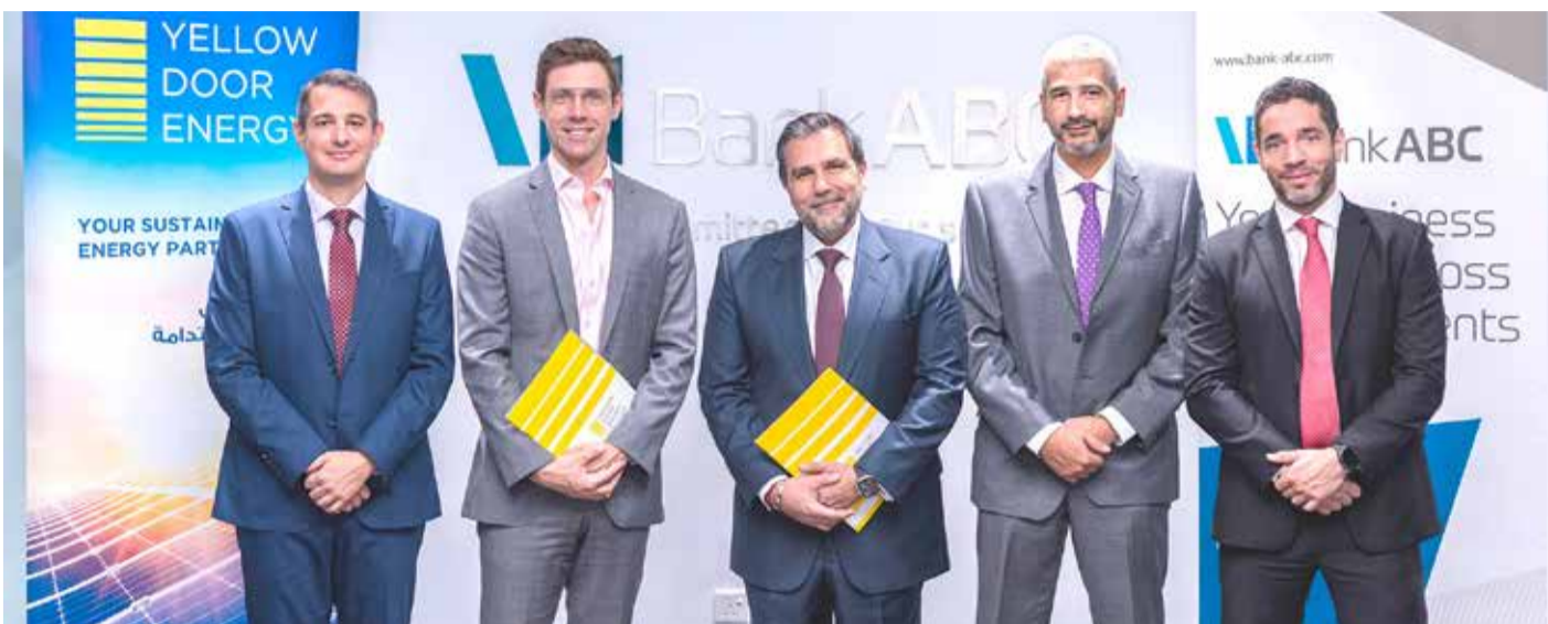
Bank ABC and Yellow Door Energy teams at the signing ceremony

Bank ABC yesterday announced the signing of a financing agreement with Yellow Door Energy, a leading sustainable energy partner for businesses in the Middle East, Africa and beyond at the Bank ABC branch at the Dubai International Financial Centre (DIFC). In line with COP28 UAE's