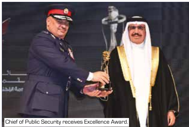
Chief of Public Security receives Excellence Award.