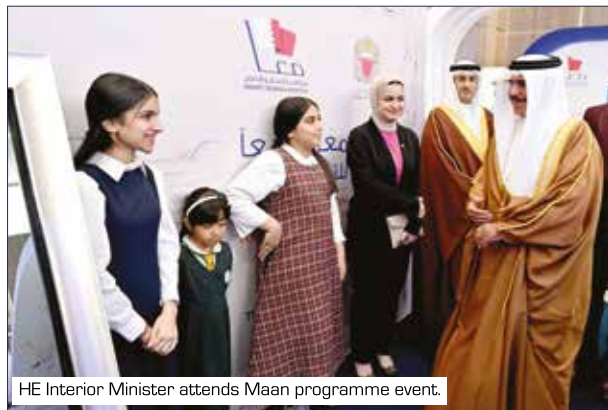
HE Interior Minister attends Maan programme event.