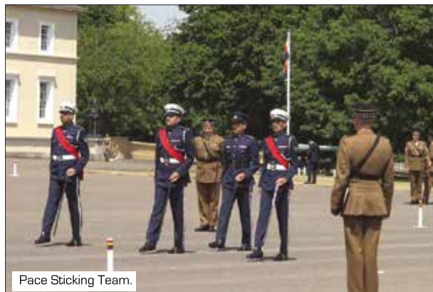
Pace Sticking Team.