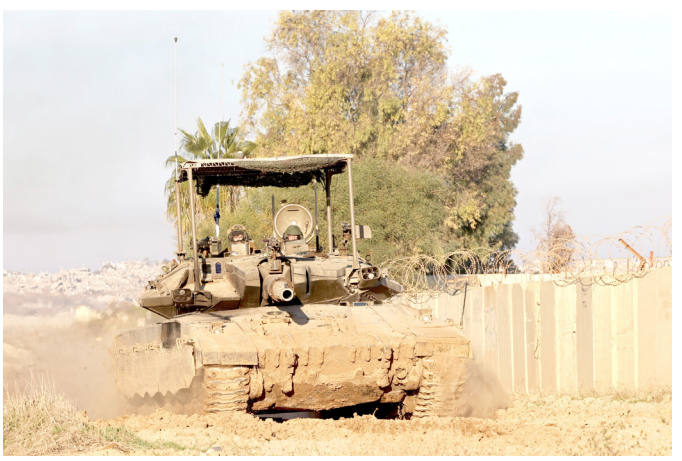
An Israeli army tank drives into position near Israel's southern border with the Gaza Strip where the major issues that