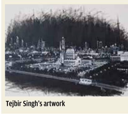
Tejbir Singh's artwork