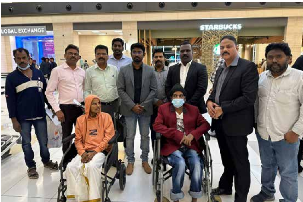
The home-bound patients with Annai Tamil Mandram and the team

They were battling to return to their native country while being hospitalised. Social workers contacted them and took the initiative to arrange for their return to India.