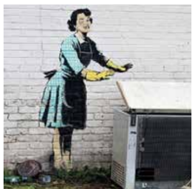
An artwork depicting violence against wor

British street artist Banksy confirmed a new mural showing a 1950s housewife with a swollen eye apparently pushing a man into an abandoned chest freezer was his work early on Valentine's Day, just hours before the appliance was removed. The artwork, which Banksy titled 'Valentine's day mas-cara' on his website, appeared in the seaside town of Margate,