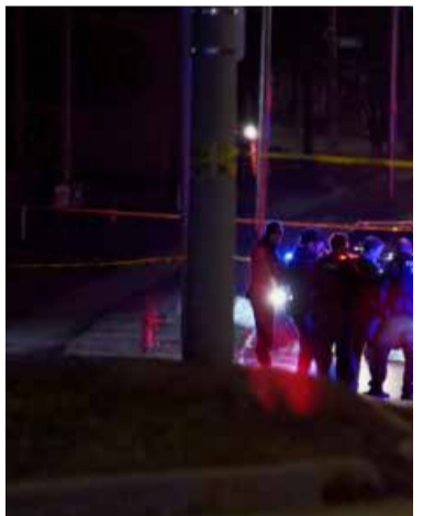
Police officers surround a scene where the East Lansing, Michigan, US

Police searched yesterday for the motive that caused a gunman to go on a shooting rampage at Michigan State University that left three people dead and five injured before an hours-long manhunt ended with the suspect's death. The 43-year-old gunman had no known affiliation to the university police said at a news briefing on Tuesday, more than five hours after the violence began on the East Lansing campus, about