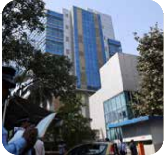
India tax officers search BBC offices

◆ Indian tax officers searched the BBC's bureaus in New Delhi and Mumbai yesterday, the British broadcaster said. "The Income Tax Authorities are currently at the BBC offices in New Delhi and Mumbai and we are fully cooperating. We hope to have this situation resolved as soon as possible," the BBC said in a statement. An Income Tax Department official, speaking on condition of anonymity, said that a "credible survey operation was ongoing" and that the department would not be able to share details. The department did not respond to a Reuters email seeking comment. Britain's Foreign Office said it was closely monitoring reports of tax surveys conducted at the BBC's offices.