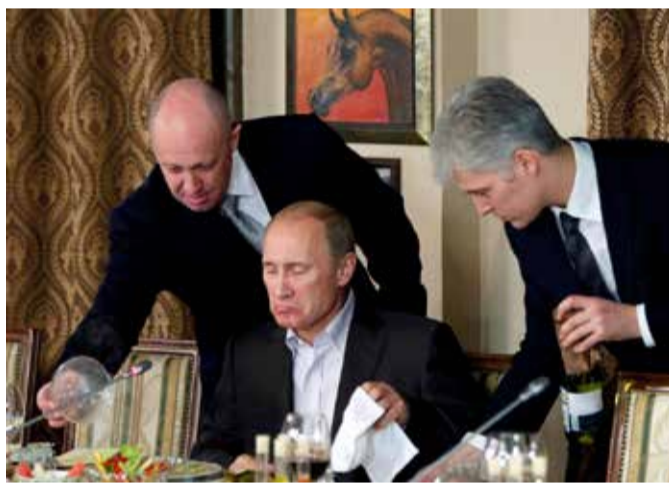
Evgeny Prigozhin (L) assists Russian Prime Minister Vladimir Putin during a dinner with foreign scholars and journalists at the restaurant Cheval Blanc on the premises of an equestrian complex outside Moscow