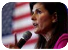
Nikki Haley launches 2024 Republican presidential bid, first challenge to Trump

◆ Former UN Ambassador Nikki Haley said yesterday that she will seek the Republican presidential nomination in 2024, putting her at odds with one-time boss Donald Trump, the ex-president also seeking to win back the White House. "I'm Nikki Haley and I'm running for president," Haley said in a video that her team sent out by email. Haley, a former South Carolina governor who served as U.S. ambassador to the United Nations under Trump, will lay out her campaign plans in a speech in Charleston, South Carolina, on Wednesday. She became Trump's first direct challenger in a Republican field expected to grow in coming weeks and months.