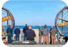
WHO increasing health surveillance after Equatorial Guinea finds Marburg virus