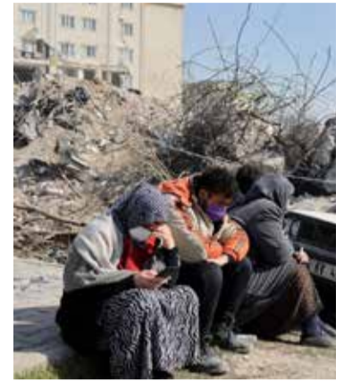
People sit as others search amid the rubble in Kahramanmaras, Turkey

The seven rescued on Tuesday included two brothers, aged 17 and 21, pulled from an apartment block in Kahramanmaras province, and a woman rescued from the rubble of a building in the southern Turkish city of Antakya, Turkish media said.