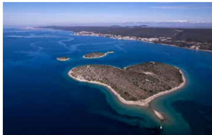
A drone picture taken from above near Biograd na Moru shows Island Galesnjak, Croatia