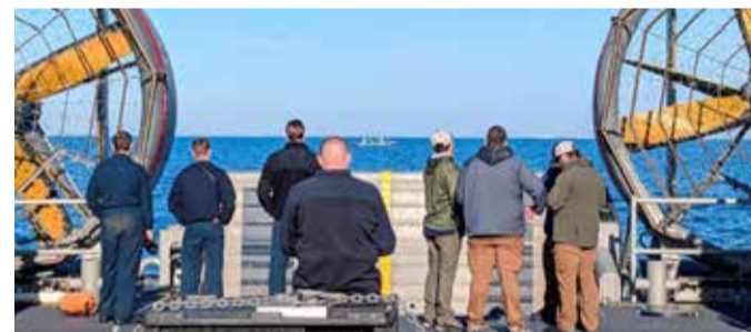
FBI Special Agents assigned to the bureau's Evidence Response Team ready to process material recovered from the high-altitude Chinese balloon