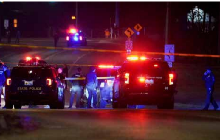
Suspect was located as they respond to a shooting at Michigan State University in