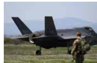
A Dutch soldier stands guard as a Royal Netherlands Air Force F-35 takes off at Graf Ignatievo airbase, Bulgaria

"After identification, it turned out to be three aircraft: a Russian IL-20M Coot-A that was escorted by two Su-27 Flankers. The Dutch F-35s escorted the formation from a