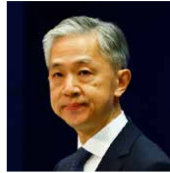
Chinese Foreign Ministry spokesperson Wang Wenbin

"The United States should conduct a thorough investigation and give China an expla-