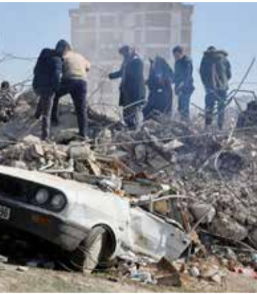
People in the aftermath of a deadly earthquake

Both countries need humanitarian assistance."