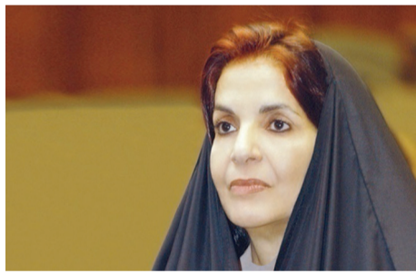
HRH Princess Sabeeka

She also pointed out that the "Together for the Safety of Bahrain" campaign is