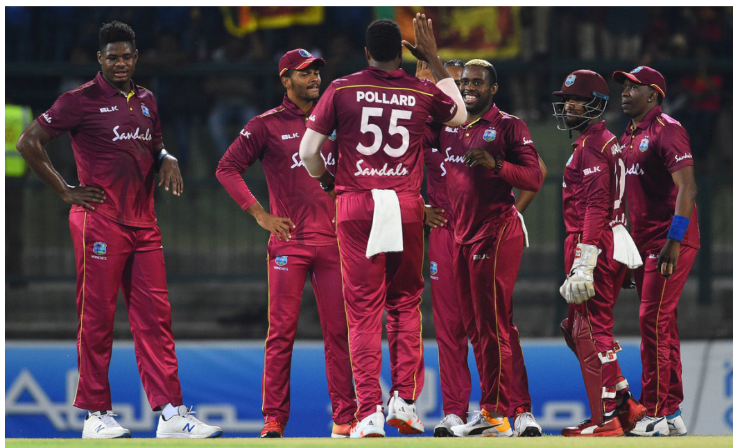
West Indies' players celebrate during a match against Sri Lanka (file photo)

the series would go ahead but that would depend on whether it was deemed safe.