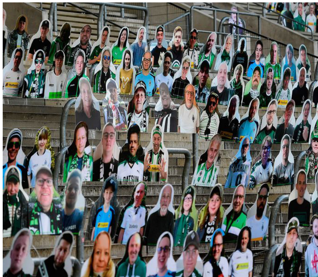
Cardboard cut-outs with portraits of Borussia Mönchengladbach's supporters are seen at the Borussia Park football stadium