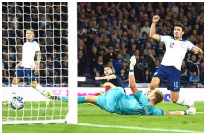
Scotland's defender Andrew Robertson (C) celebrates as England's defender Harry Maguire (R) reacts after scoring an own goal

"I have been through a lot in the last couple of years and I