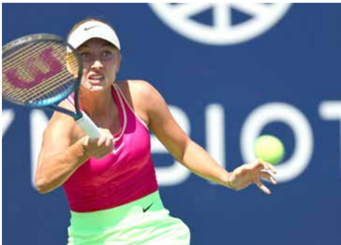
Anastasia Potapova plays a forehand in the first set against Ons Jabeur

"She is truly one of the best in the world and with her style it's