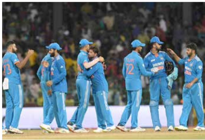
India's team celebrates the win against Sri Lanka