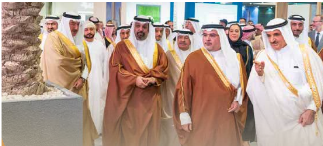
HRH Prince Salman touring Cityscape after the inaugural ceremony on Tuesday.

His Royal Highness was speaking as he launched yesterday the second edition of Cityscape Bahrain 2023, at Exhibition World Bahrain, in Sakhir. HRH the Crown Prince and Prime Minister was accompanied by a number of senior officials. He highlighted the efforts