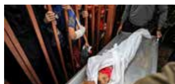
People look through a metal fence as the body of a child killed in Israeli bombardment is being taken for burial, outside the morgue at Nasser hospital in Khan Yunis in the southern Gaza Strip yesterday.

“The Secretary-General is deeply disturbed by the horrible