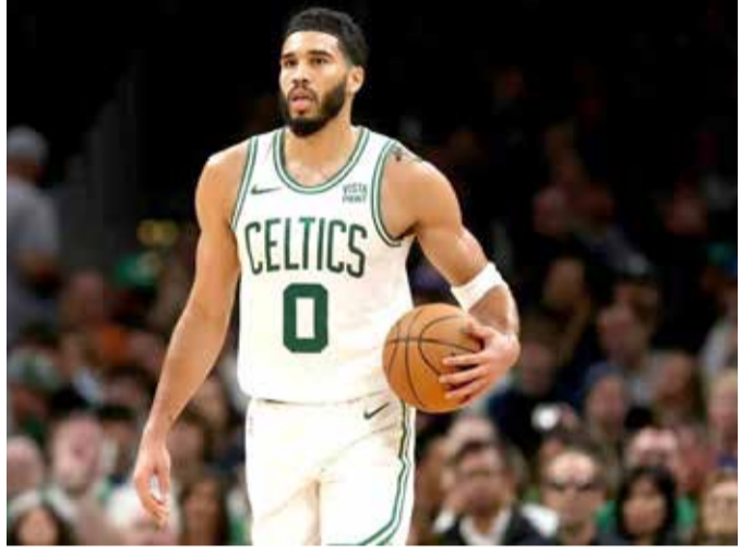
Jayson Tatum of Boston Celtics in action

AFP | New York Jayson Tatum and Kristaps Porzingis led a second-half fightback as the Boston Celtics overpowered the New York Knicks 114-98 in the NBA on Monday. Tatum finished with 35 points - including 17 in the fourth quarter - while Porzingis added 21 to fire the Celtics to their eighth win of the season. "First half, they were scoring at will, but second half we started making stops," Tatum said after the Celtics bagged their third straight victory. "We've had three games in four days, now we go out on the road for a week and play some good teams - hopefully we can keep it going," Tatum added. New York caused Boston problems in the first half, edging into an eight-point lead in the second quarter with Jalen Brunson and Julius Randle both influential at Boston's TD Garden. But Jaylen Brown drained a superb three-pointer from 25 feet on the stroke of half-time