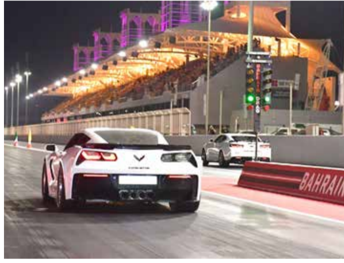
Action from a past event at BIC

Bahrain International Circuit's (BIC) quarter-mile drag strip is set to get busy with high-intensity action tomorrow with the Kanoo Motors Rolling Drag Nights. This popular activity at "The Home of Motorsport in the Middle East" gives participants a chance to bring their own cars or motorbikes and go one-on-one along BIC's world-class strip, which is a member of the prestigious NHRA Worldwide Network of the US-based National Hot Rod Association (NHRA). The Kanoo Motors Rolling Drag Nights is similar to BIC's Ebrahim K Kanoo Drag and Drift Nights, but in the former, those taking part do not start