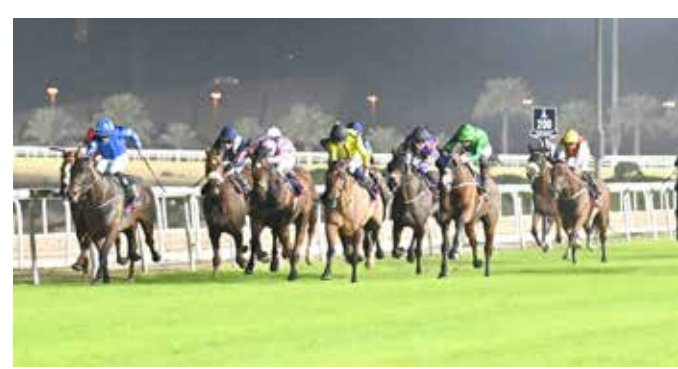
Action from a previous race at REHC TDT | Manama

Excitement is building Friday's races will feature 12 for the 13th race of the events, including key rounds prestigious trophies.