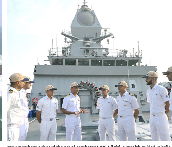
crew members onboard the naval combatant INS Nilgiri, a stealth guided missile

Delhi bolsters defence against submarine. "The commissioning forts into building vessels within In 2024, India spent an all-time approved India-based defence submarines. Vineet Sharma, com- "India is a maritime nation," feet) long vessel which the navy at sea."