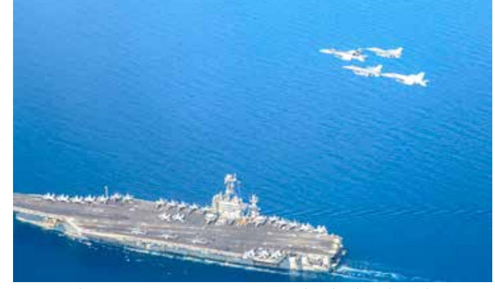
The Iran-backed rebels said US Navy F/A-18E Super Hornets, attached to Carrier Air Wing 1 (CVW-1) and Belgian Air Force F-16s flying over the Nimitz-class aircraft carrier USS Harry S.

they used "winged missiles and drones" during what they de- Truman (CVN 75) in the Mediterranean Sea