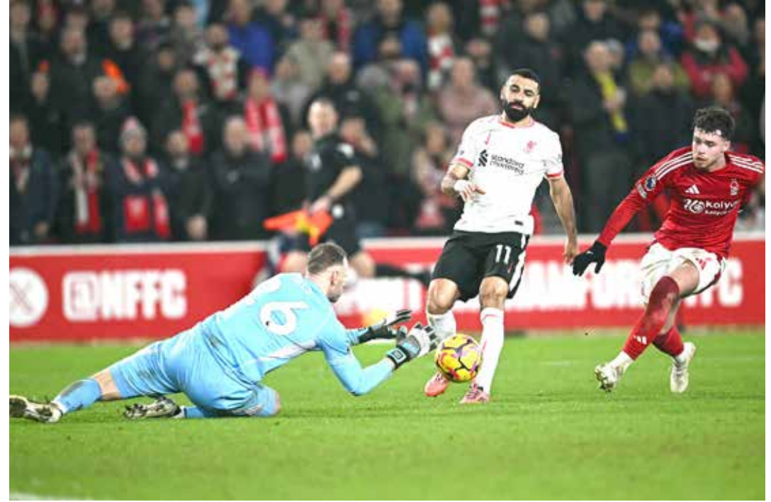
Although \, Liverpool \, had \, strug- \\

"I could not have asked for beyond them. more. Second half was outstand-