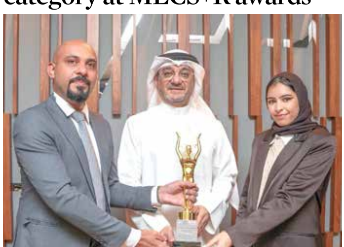
The award ceremony TDT | Manama

tres & Retailers (MECS+R) is our visitors." the leading body representing the shopping center and retail paign reached over 15 million industry in the Middle East people, with a majority of the and North Africa.