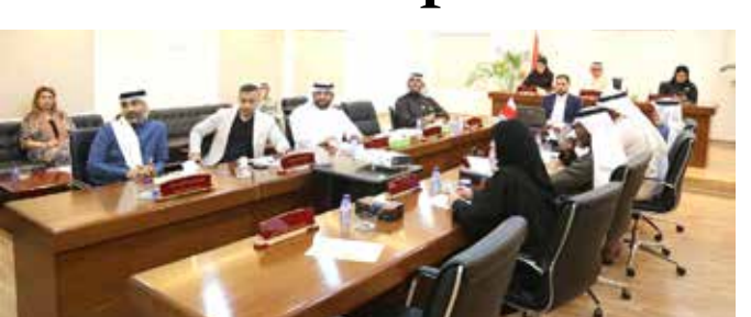
Council meeting in progress