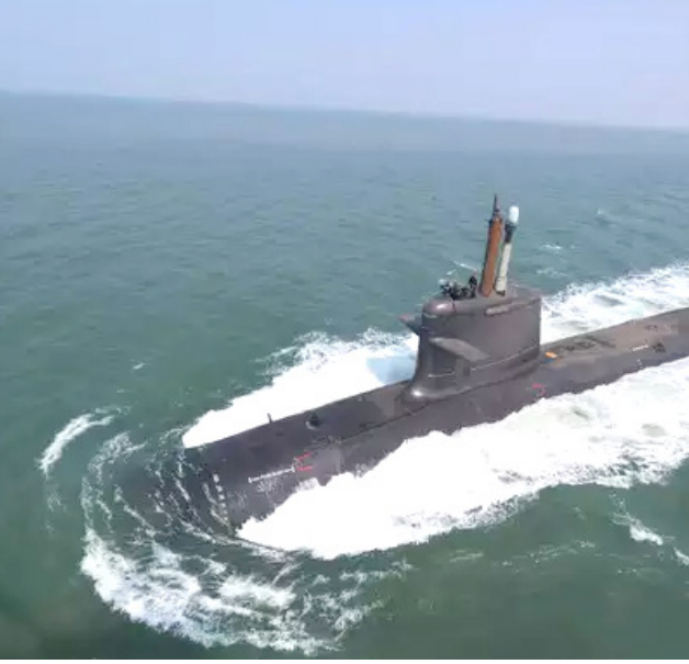
The naval combatant INS Vaghsheer, a Scorpene-class submarine of the Indian Navy,

Drime Minister Narendra Modi of the world," Modi, wearing a na- towards being a global leader in marines from around 150 to 170 according to the defence ministry, States, Israel and Spain. an increase of some 17 percent on India is also in talks with Paris volumes" about the capability always secured."