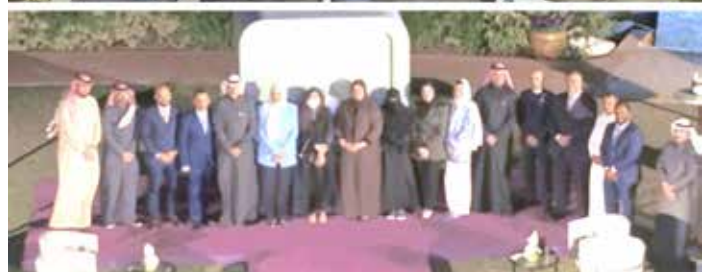
2024. We also congratulate the lets in the monthly 'Tejoori for the Tejoori Al Islami account needs and simplify their finanwinners of the diamond brace- Her' draws, and we hope that will continue to support their cial matters.