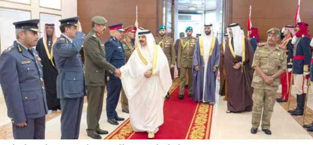
HM the King receives a warm welcome upon his return to the Kingdom

Both monarchs reaffirmed the world. Investment Company, which the contributions of the Oma- their commitment to the prin-